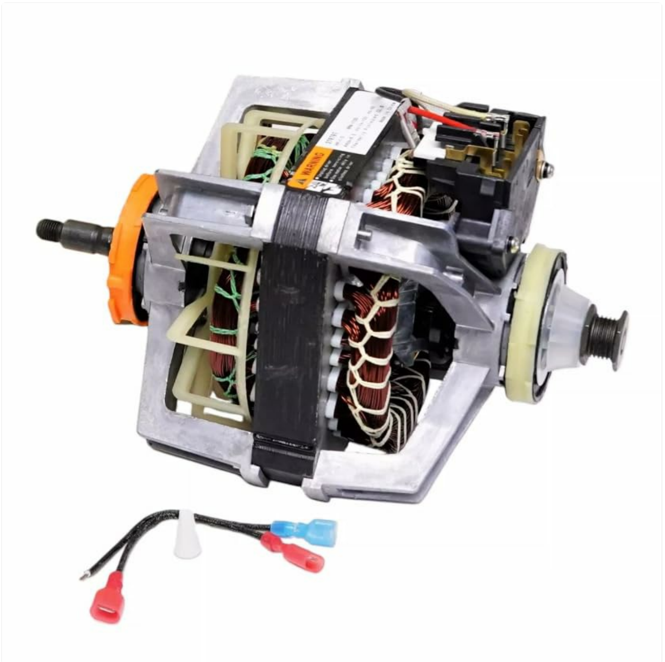
Image: The complete replacement dryer drive motor assembly, including the motor unit and accompanying wiring connectors.