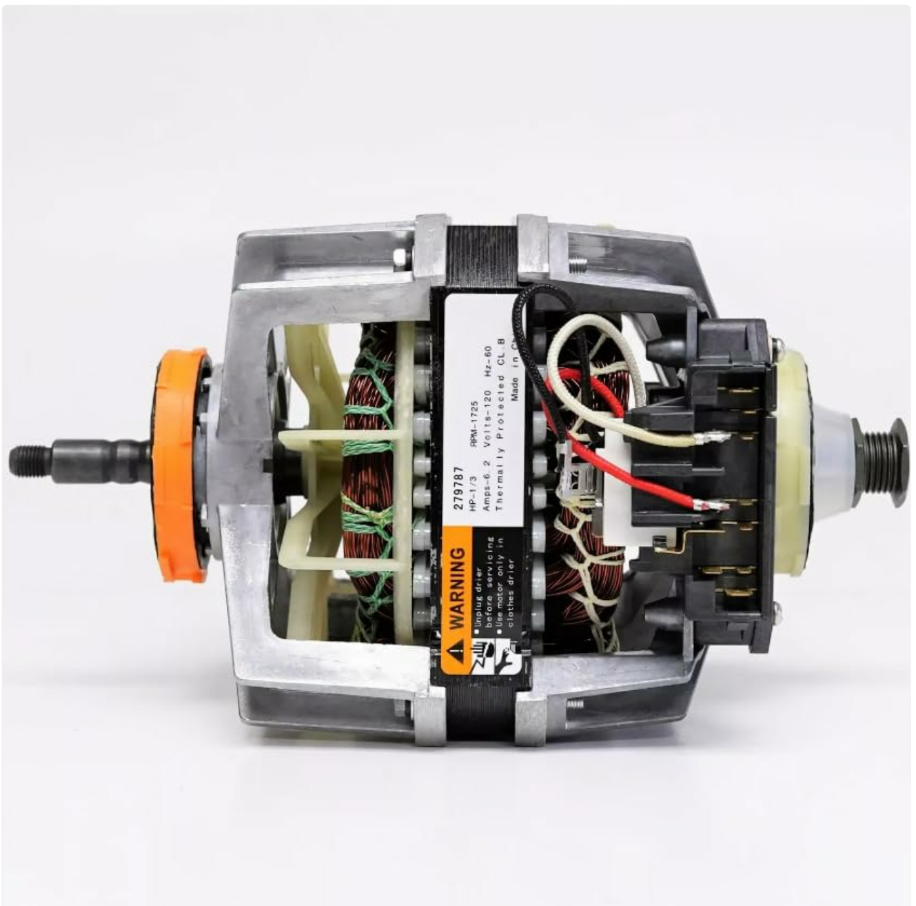
Image: A side view of the replacement dryer drive motor, showing its general shape and connection points.

Identify the existing drive motor. It is typically located at the bottom of the dryer drum assembly and connected to the drive belt and blower wheel.