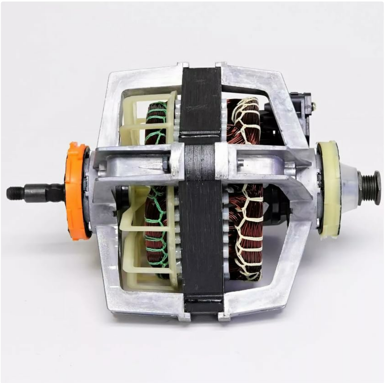
Image: An overhead view of the replacement dryer drive motor, showing the overall structure and shaft.