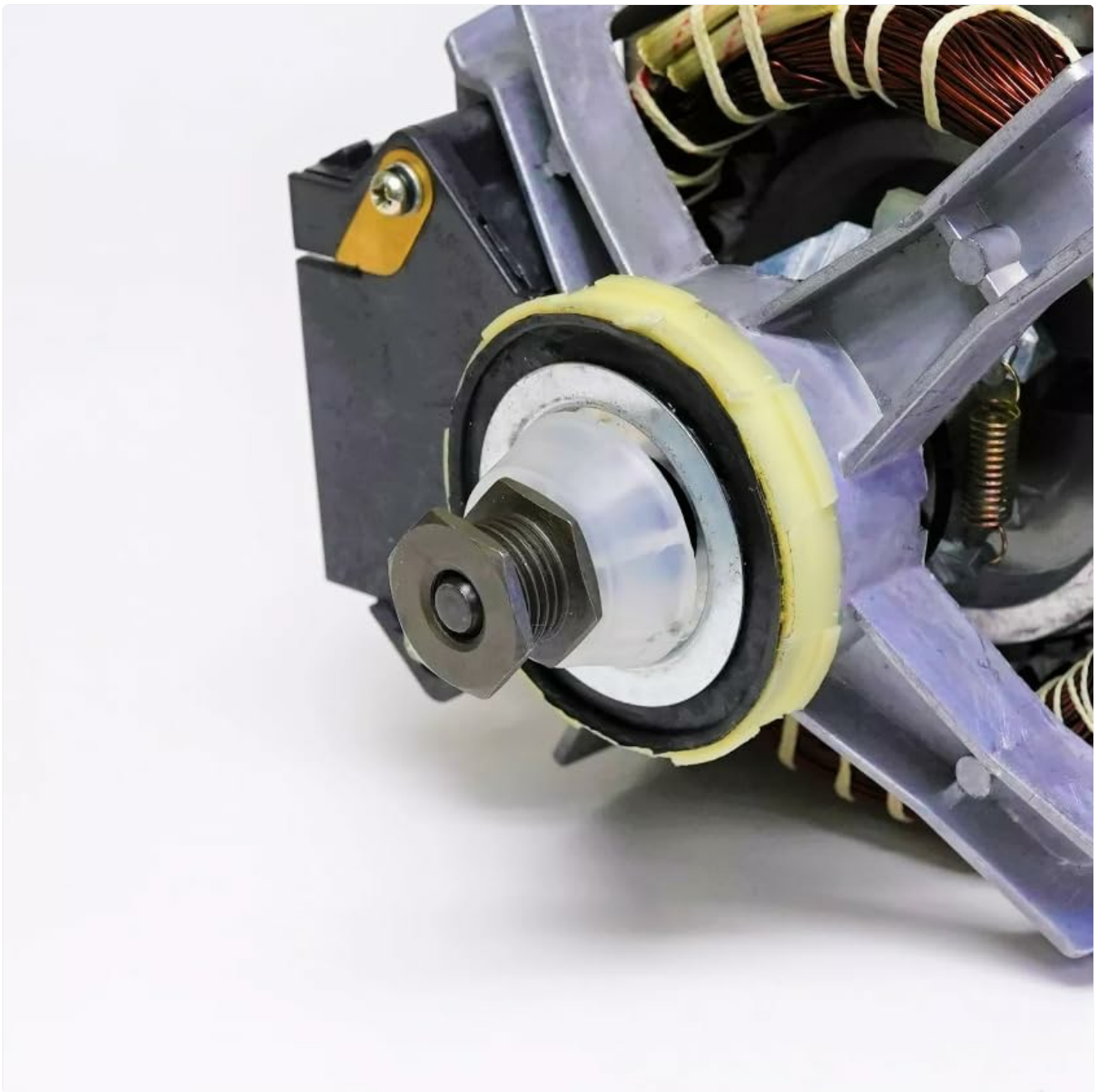
Image: A close-up of the motor shaft where the blower wheel attaches, showing the threaded end and mounting point.