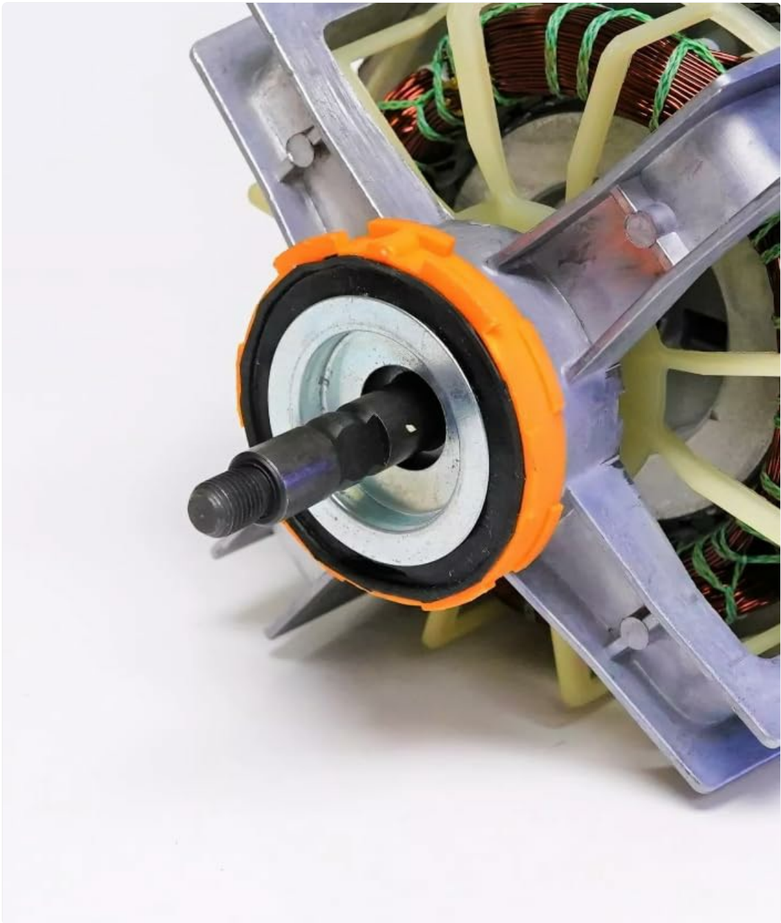
Image: A close-up of the motor shaft where the drive pulley attaches, showing the smooth shaft and retaining ring groove.