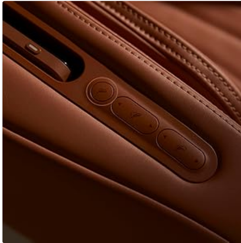
Figure 2: Integrated control panel for easy access to functions.

Locate the main power switch, usually at the back or side of the chair. Flip the switch to the ON position. The chair will enter standby mode. To begin a massage, use the remote control.