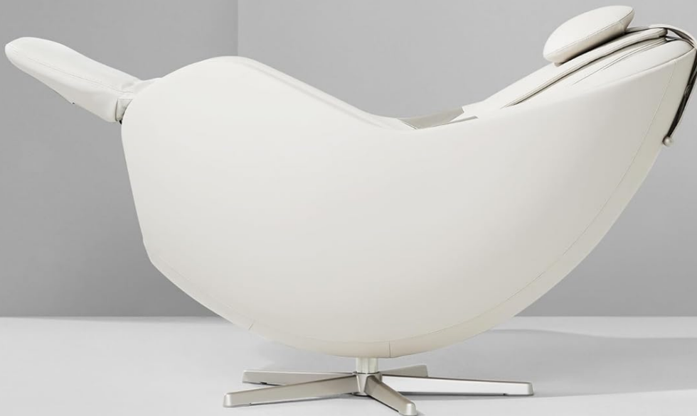
Figure 5: The M6 in its optimal Zero Gravity recline position.

With a simple touch, the M6s reclines the upper body up to 150° and elevates the built-in footrest up to 80°, effortlessly creating the perfect Zero Gravity Position for optimal massage and relaxation.