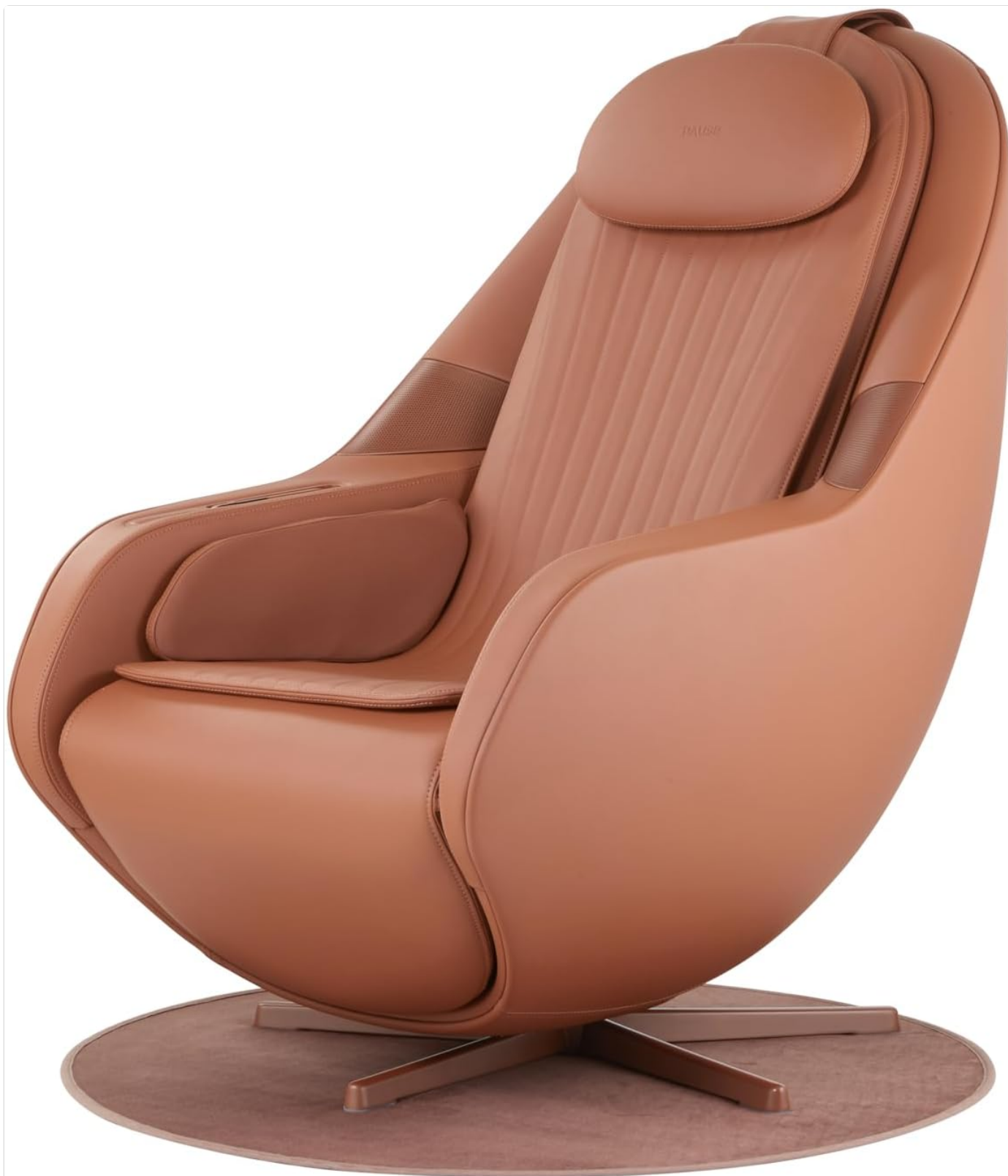
Figure 1: The CERAGEM M6 Luxury Massage Chair, ready for placement.