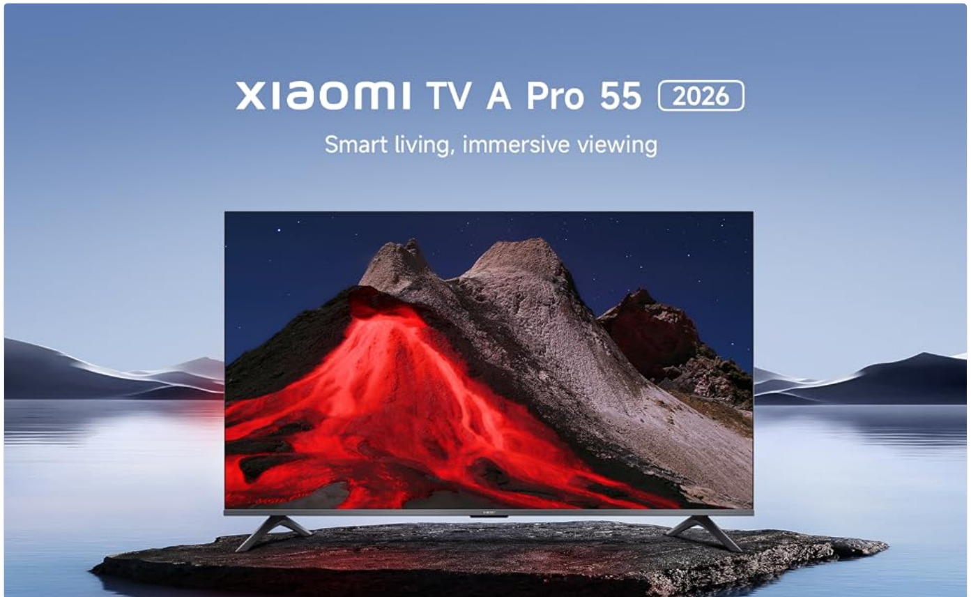
Image: The Xiaomi TV A Pro 55" 2026 displayed on its stand, showcasing its sleek design and vibrant display.

Carefully remove the TV from its packaging. It is recommended to have two people for this process due to the size and weight of the unit. Place the TV on a stable, flat surface or prepare for wall mounting.