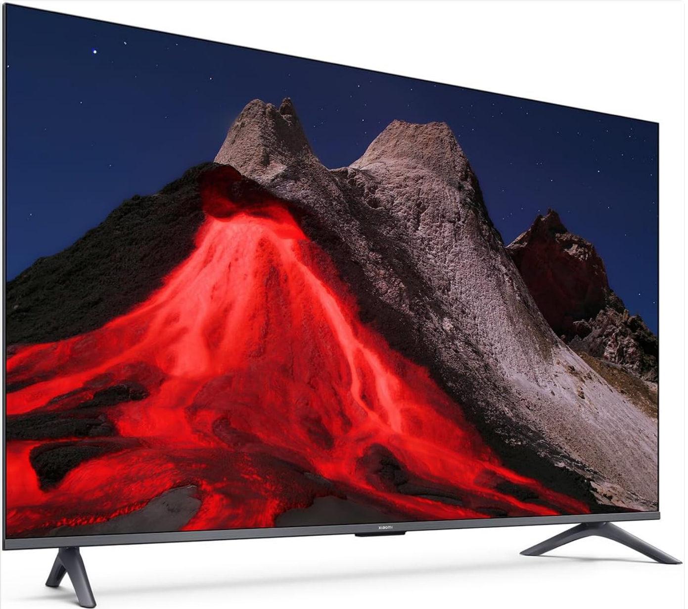
Image: A side-angle view of the Xiaomi TV A Pro 55" 2026, illustrating its thin bezel and potential port locations.