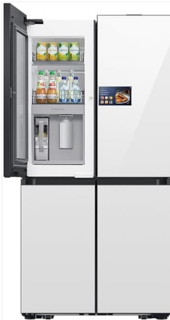
Figure 4.5: Water Dispenser and Auto-Fill Pitcher. This image displays the open left door of the refrigerator, revealing the internal water dispenser and the convenient auto-fill water pitcher, along with stored beverages.