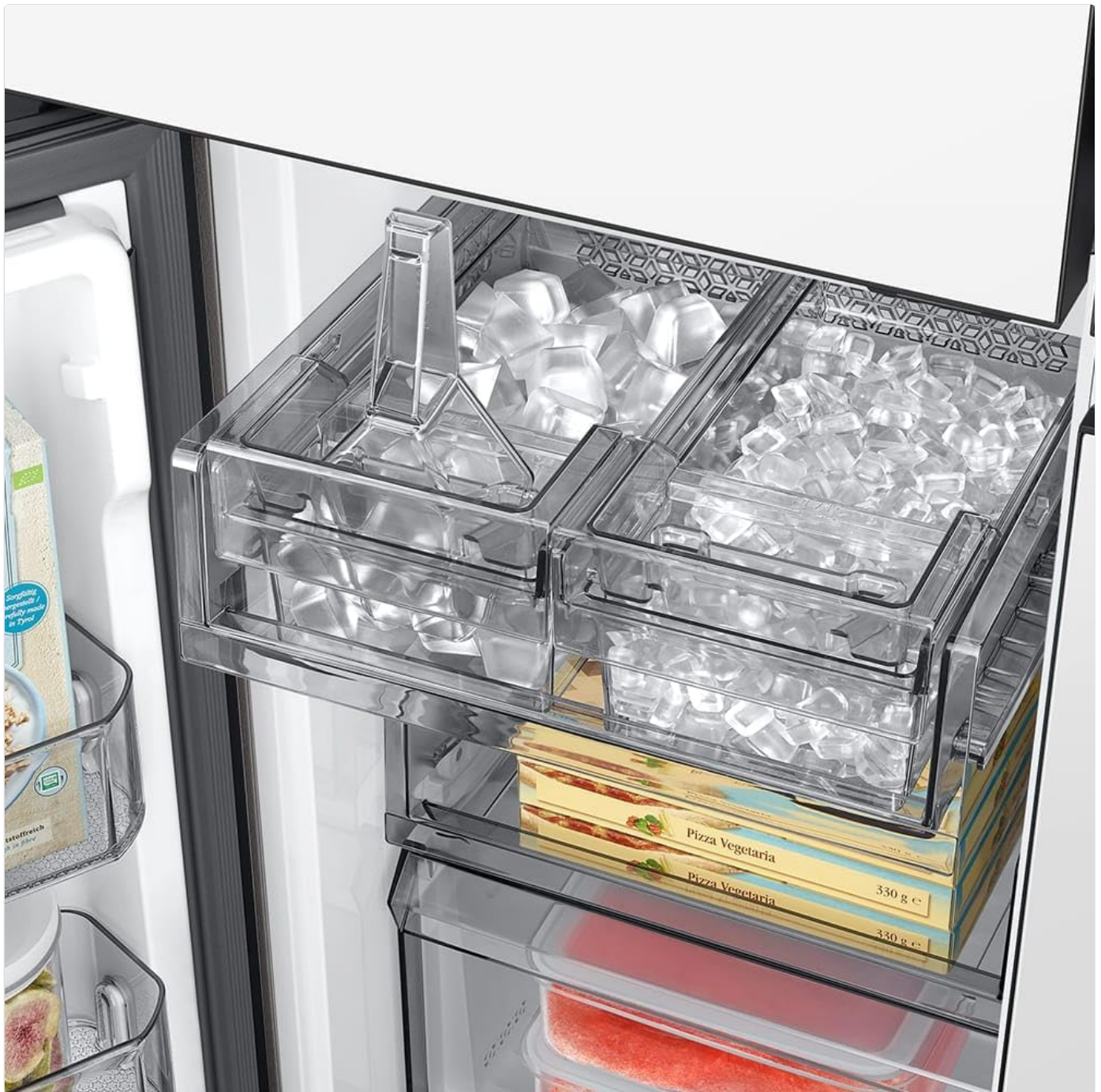
Figure 4.4: Dual Auto Ice Maker. This image shows the transparent ice bins of the Dual Auto Ice Maker, containing both standard cube ice and smaller Ice Bites, ready for use.