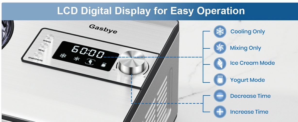
Image: A detailed view of the control panel, highlighting the digital display and function buttons for various modes and time adjustments.

The Gasbye Ice Cream Maker features an intuitive LED display and control buttons for easy operation.