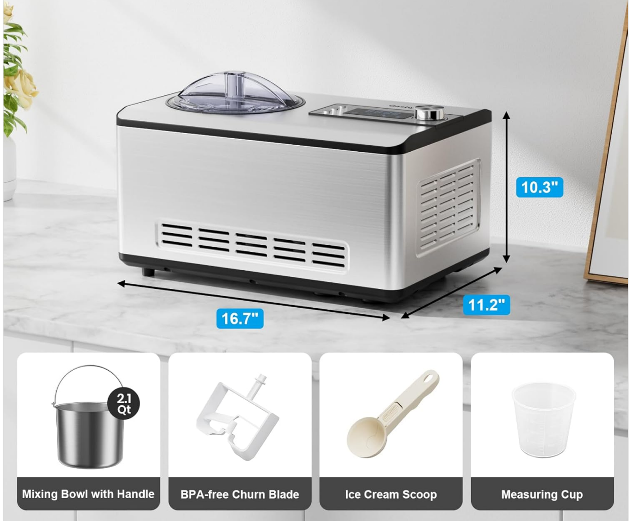
Image: A visual representation of the included accessories: a mixing bowl with handle, a BPA-free churn blade, an ice cream scoop, a measuring cup, the user manual, and a recipe book.