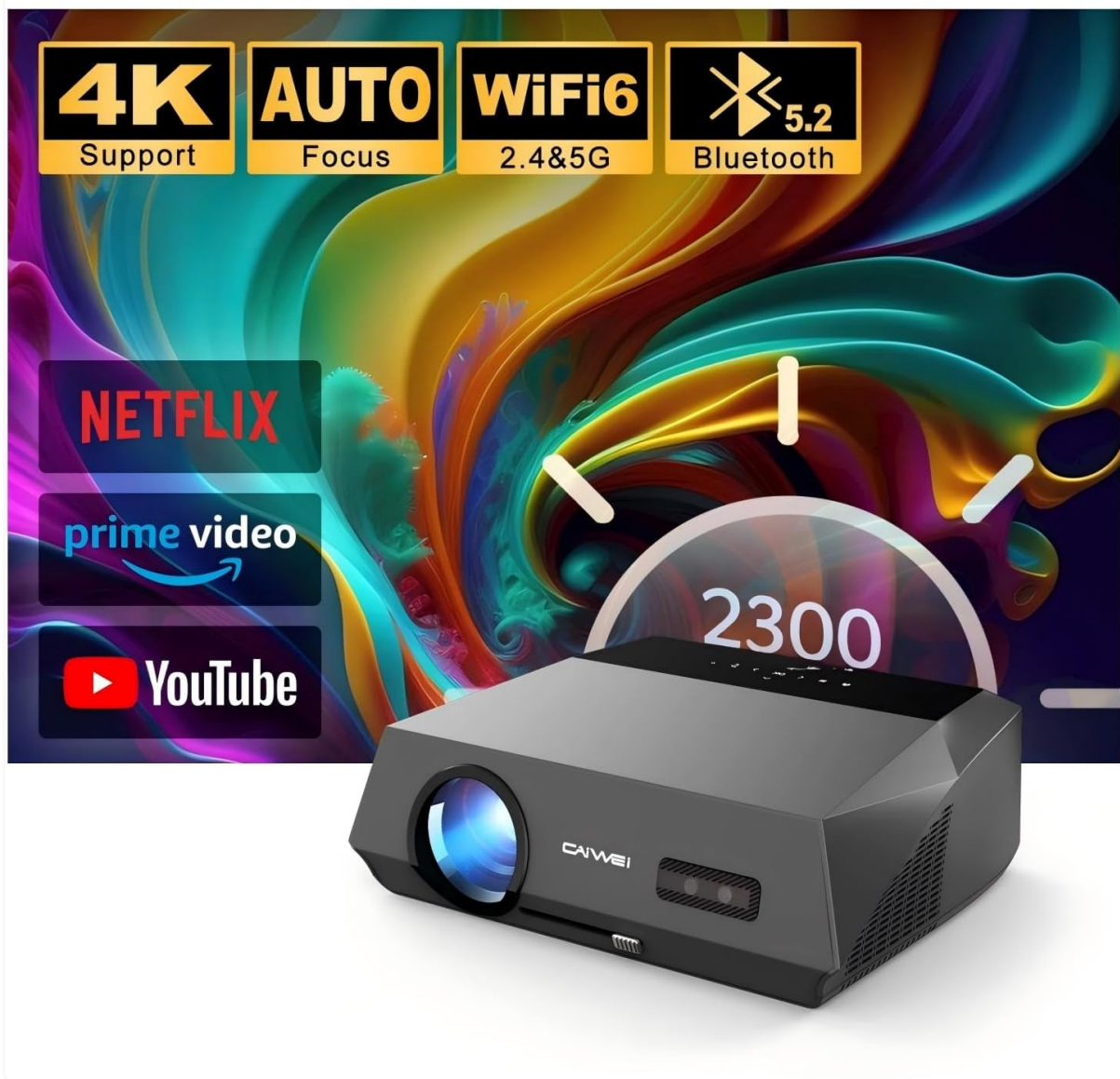
Image 1.1: CAIWEI A10Q Smart Projector showcasing its main features including 4K support, auto focus, WiFi 6, Bluetooth 5.2, and streaming app compatibility.