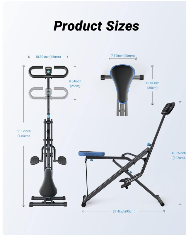
Image Description: Diagram illustrating the detailed product dimensions of the MERACH R07 Squat Rowing Machine in both upright and folded positions.