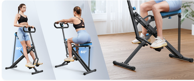
Image Description: A detailed view of the MERACH R07, highlighting its dimensions and various components like anti-slip pedals and adjustable squat depth.

Remove preassembled bolts, nuts, and washers from the Front and Rear Foot Tubes (#36 and #38). Attach these tubes to the Main Frame (#28) using the removed hardware. Secure tightly with the cross spanner (#B).