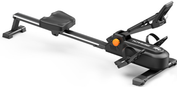
Image: The 16-level tension control knob on the MERACH R26, allowing for customized workout intensity.