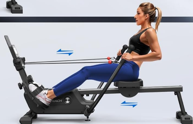
Image: Visual guide to the 7+ training modes available on the MERACH R26, illustrating varied arm movements.