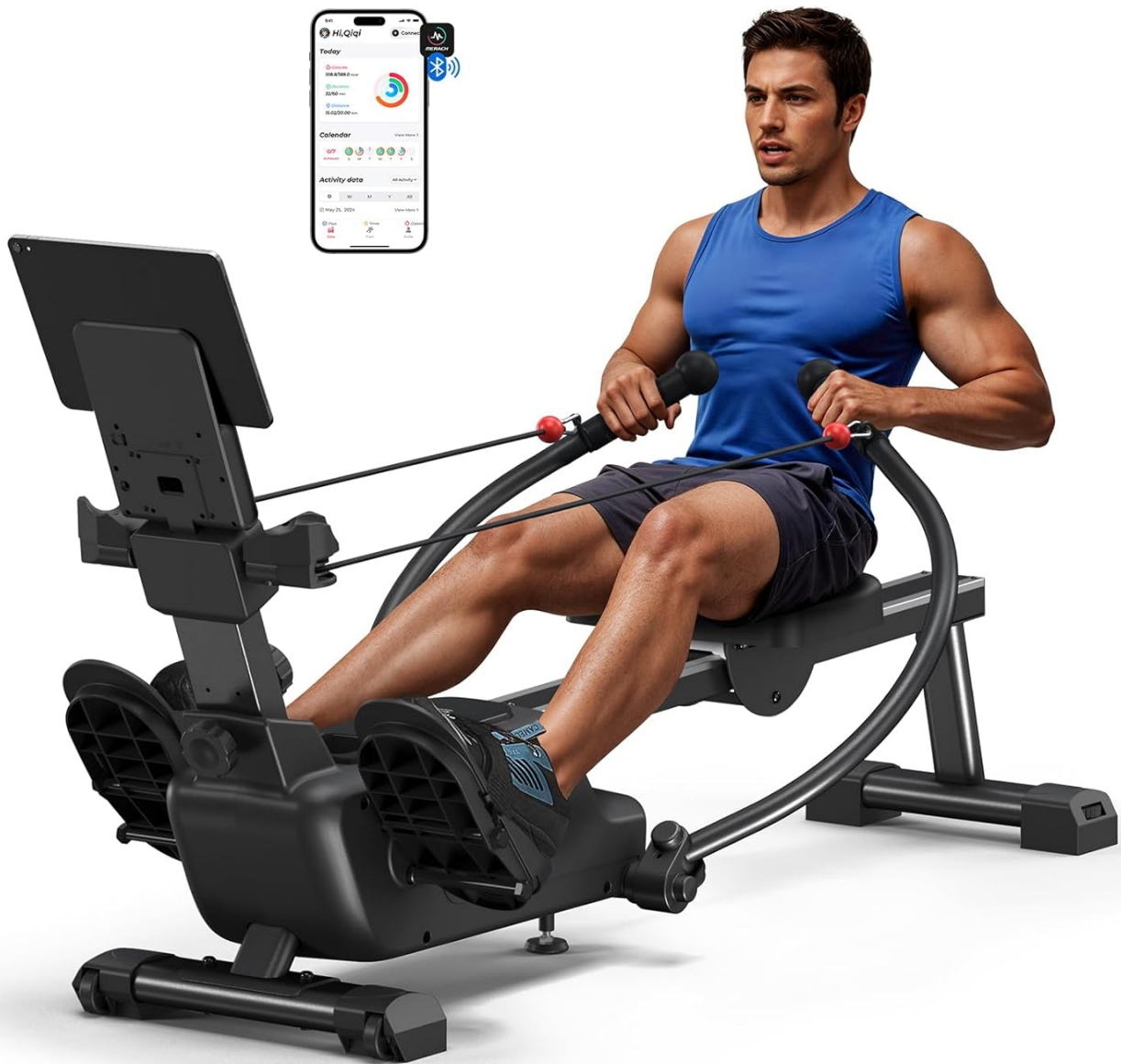
Image: The MERACH R26 Sculls Rowing Machine, showcasing its design and a user in action.