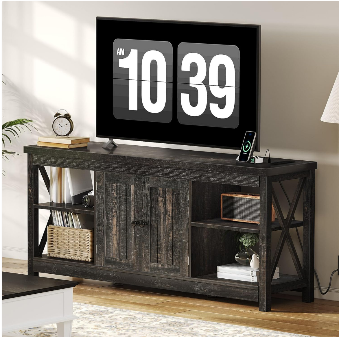
Image: A visual representation of the adjustable shelf feature within the TV stand's cabinet, demonstrating how the shelf height can be changed to accommodate different items.