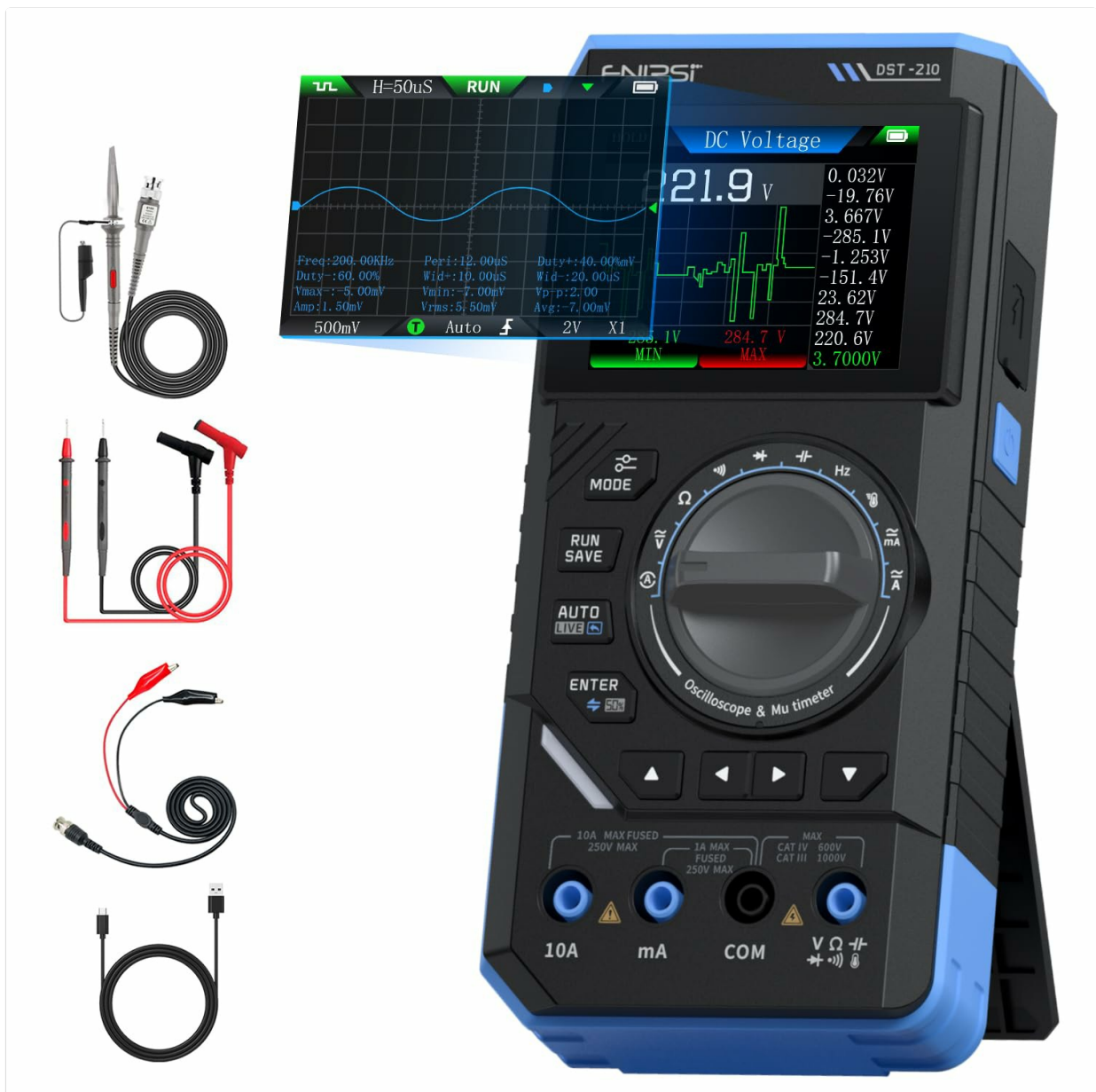
Figure 2: FNIRSI DST-210 with all probes connected for various functions.