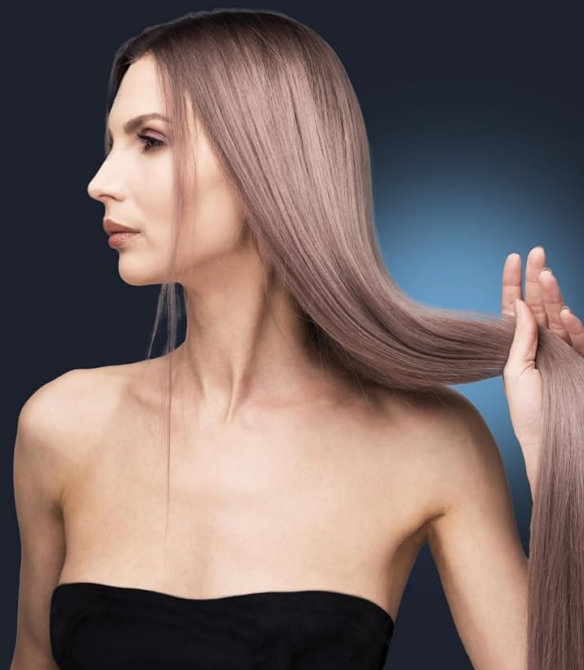
Image 4.2: Intelligent heat management ensures stable temperature, protecting hair from heat damage.