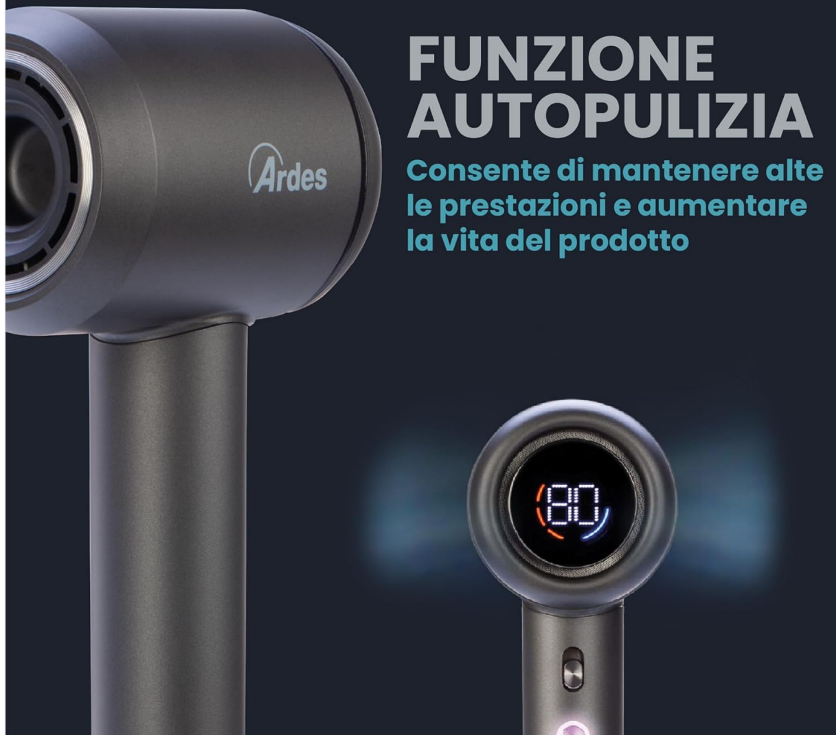
Image 5.1: The auto-cleaning function helps maintain high performance and extends product life.