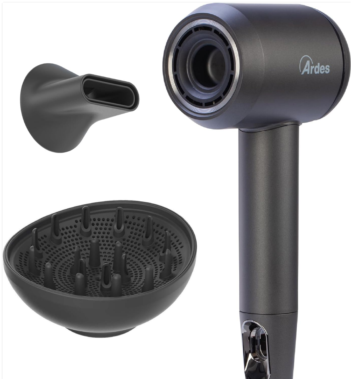
Image 2.1: Ardes Hair Pro D ARPHON05 hair dryer with its included concentrator and diffuser attachments.