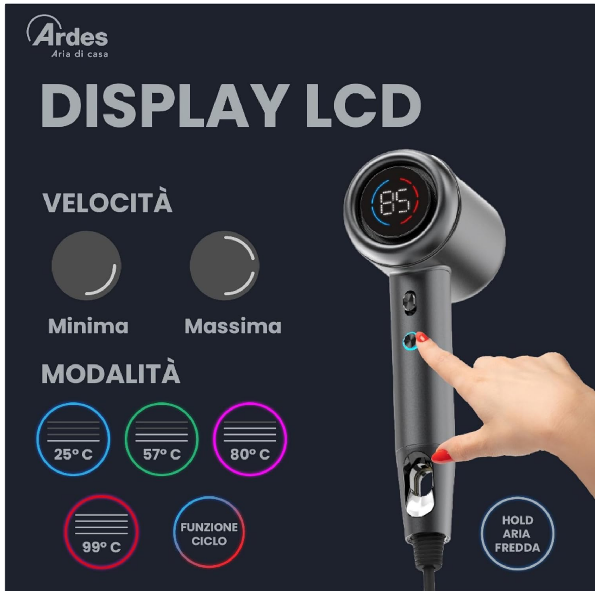
Image 4.1: The LCD display provides a clear overview of the selected speed and temperature settings.

respective buttons on the handle to cycle through the options. The selected settings will be displayed on the LCD screen.