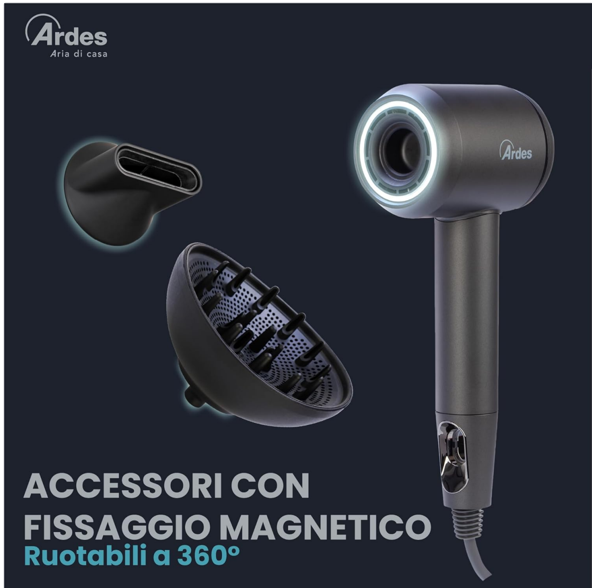
Image 3.1: Magnetic attachments for easy and secure connection of styling accessories.

The concentrator and diffuser attachments connect magnetically to the front of the hair dryer. Simply align the attachment with the nozzle and it will snap into place. They can be rotated 360° for precise styling.