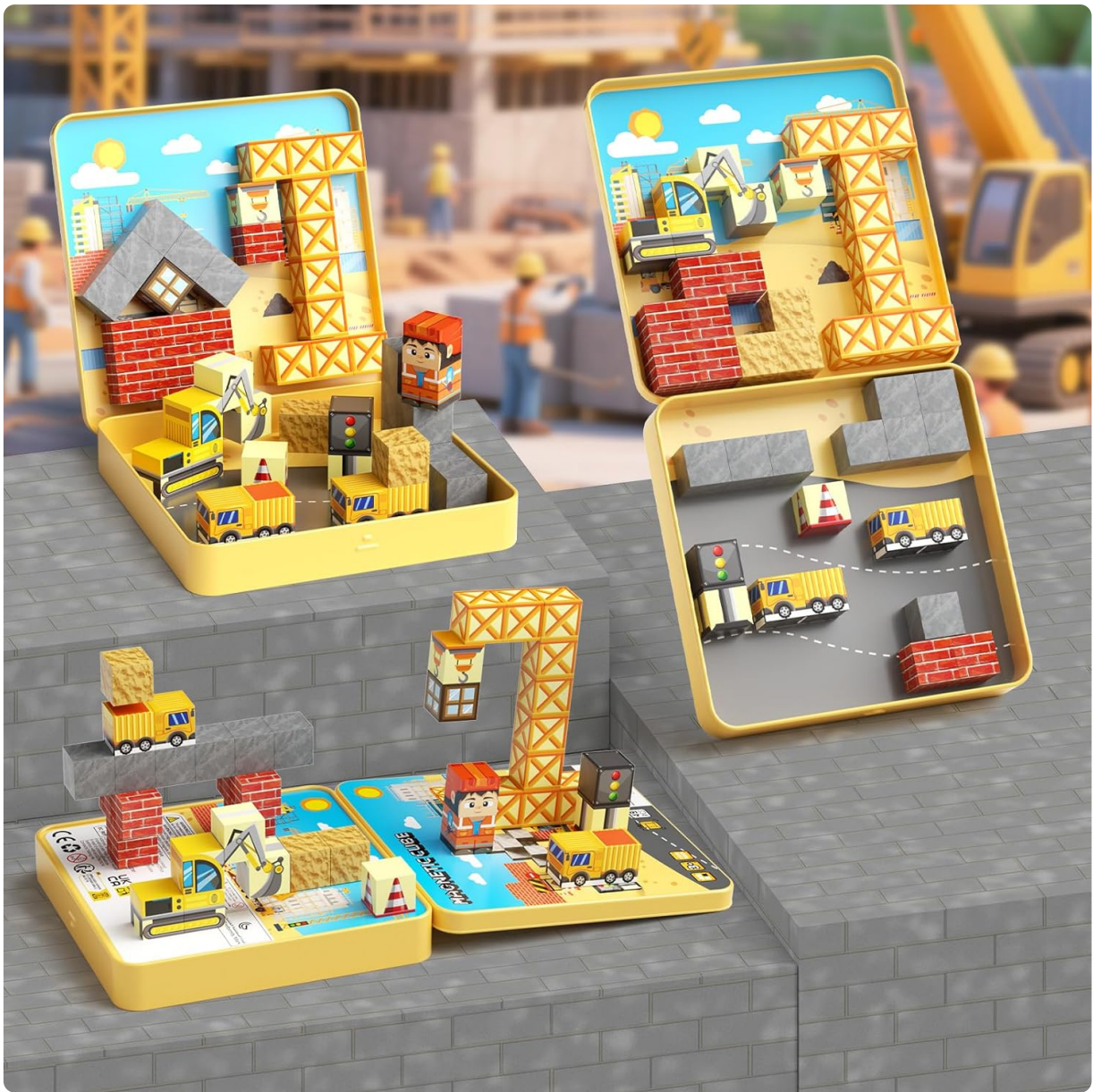
Image: The compact tin box fits easily into a backpack, emphasizing its travel-friendly design and ease of storage.