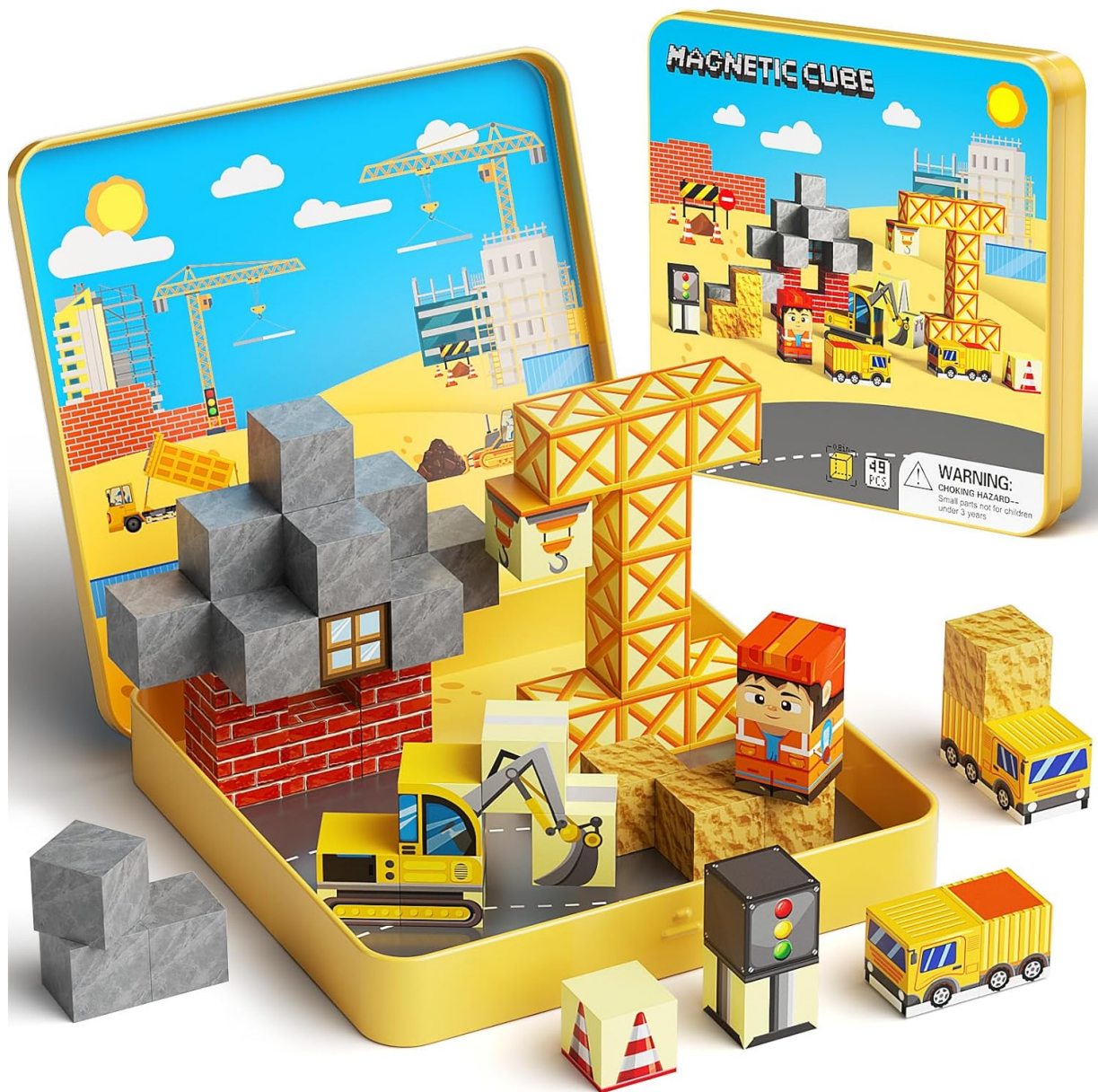
Image: The magnetic building blocks arranged to form a construction scene, utilizing the tin box as a play base.