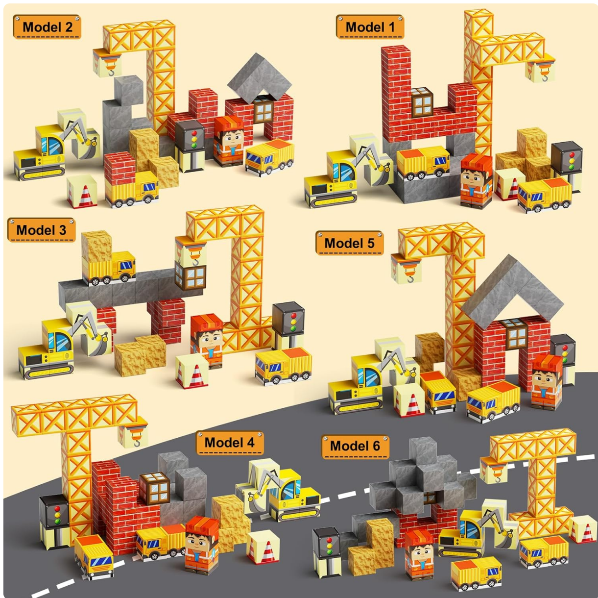
Image: Examples of various structures that can be built with the magnetic blocks, including cranes, buildings, and vehicles.

Your browser does not support the video tag.