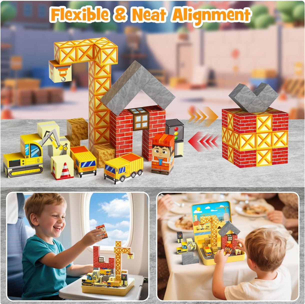
Image: Magnetic blocks showcasing flexible and neat alignment, allowing for diverse construction designs.