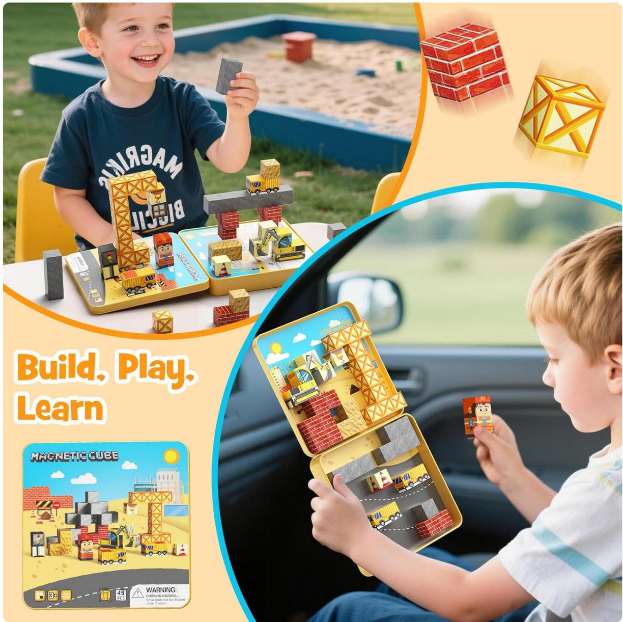
Image: A child engaged in building with the magnetic blocks, demonstrating hands-on play.