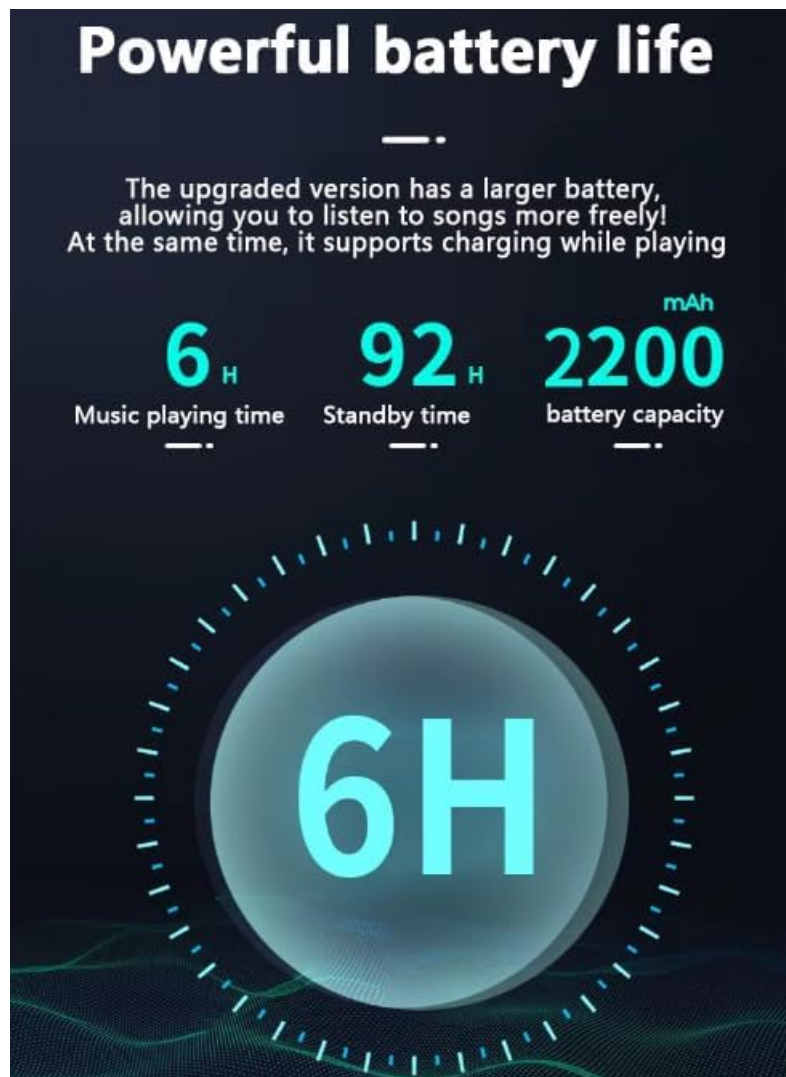
Figure 5: Battery performance details: 6 hours music playback, 92 hours standby, 2200mAh capacity.