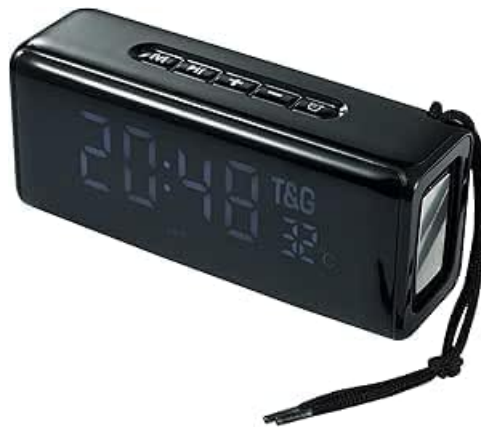
Figure 1: Front view of the Merv TG-174 speaker, showing the digital display and control buttons on top.