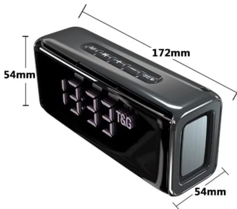
Figure 4: Dimensions of the Merv TG-174 speaker: 172mm length, 54mm width, 54mm height.