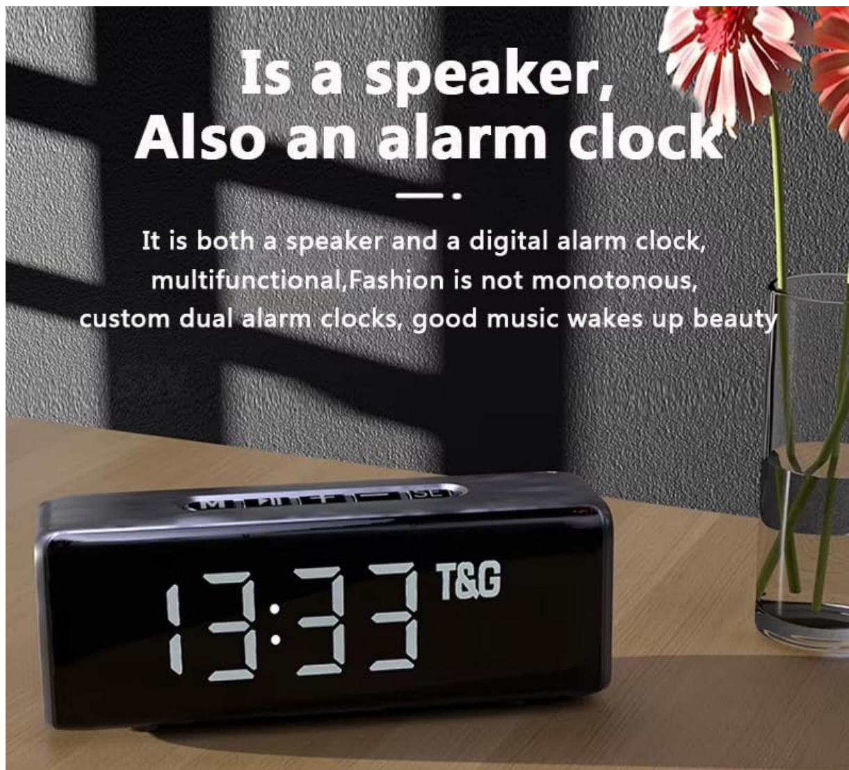
Figure 3: The speaker's digital display showing time and temperature, highlighting its alarm clock capability.