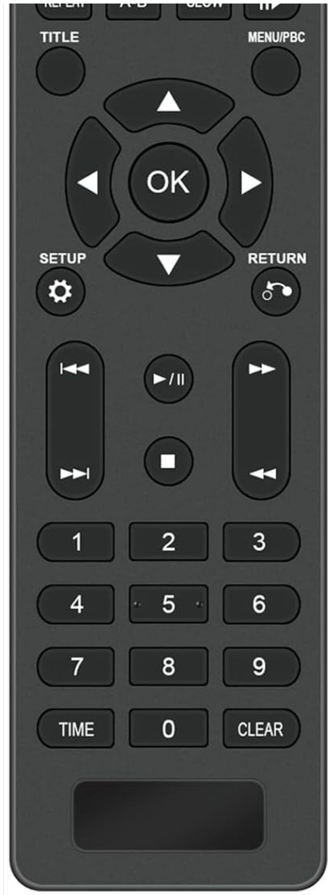
Figure 1: Front view of the ECONTROLLY Replacement Remote Control, showing all buttons and their labels.