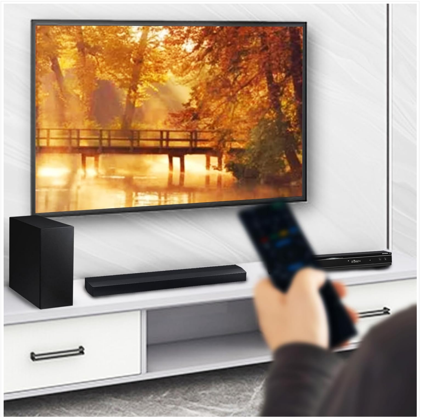
Figure 3: Example of the remote control in use with a compatible DVD player and television.