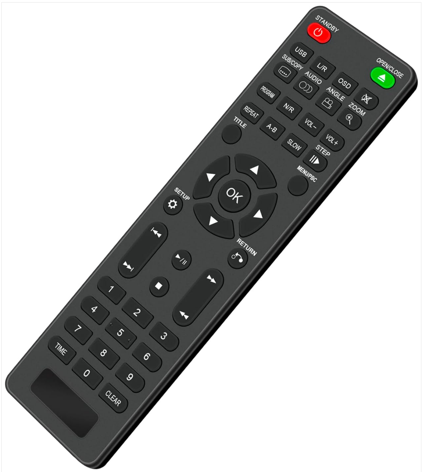
Figure 2: Angled view of the remote control, highlighting its ergonomic design.