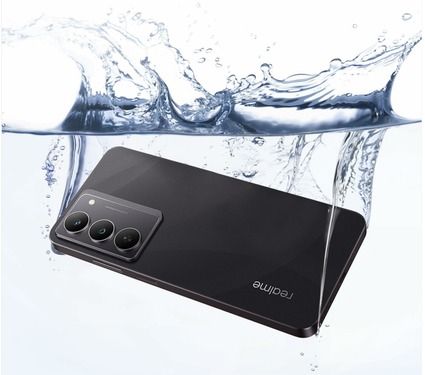
Image: The realme 14x 5G Smartphone being splashed with water, illustrating its IP69 water and dust resistance rating.