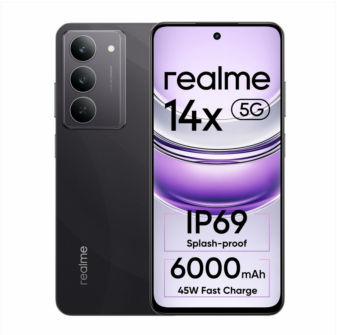
Image: The realme 14x 5G Smartphone in Crystal Black, shown with its main features highlighted, including IP69 rating, 6000mAh battery, and 45W fast charge capability. This image represents the primary device and its key specifications.