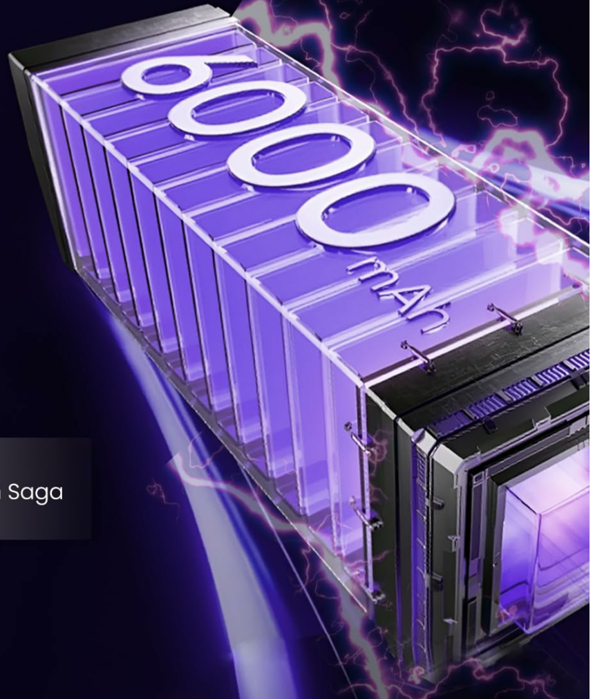
Image: An illustration depicting the 6000mAh battery capacity and 45W fast charging capability of the realme 14x 5G Smartphone, showing estimated usage times for various activities.