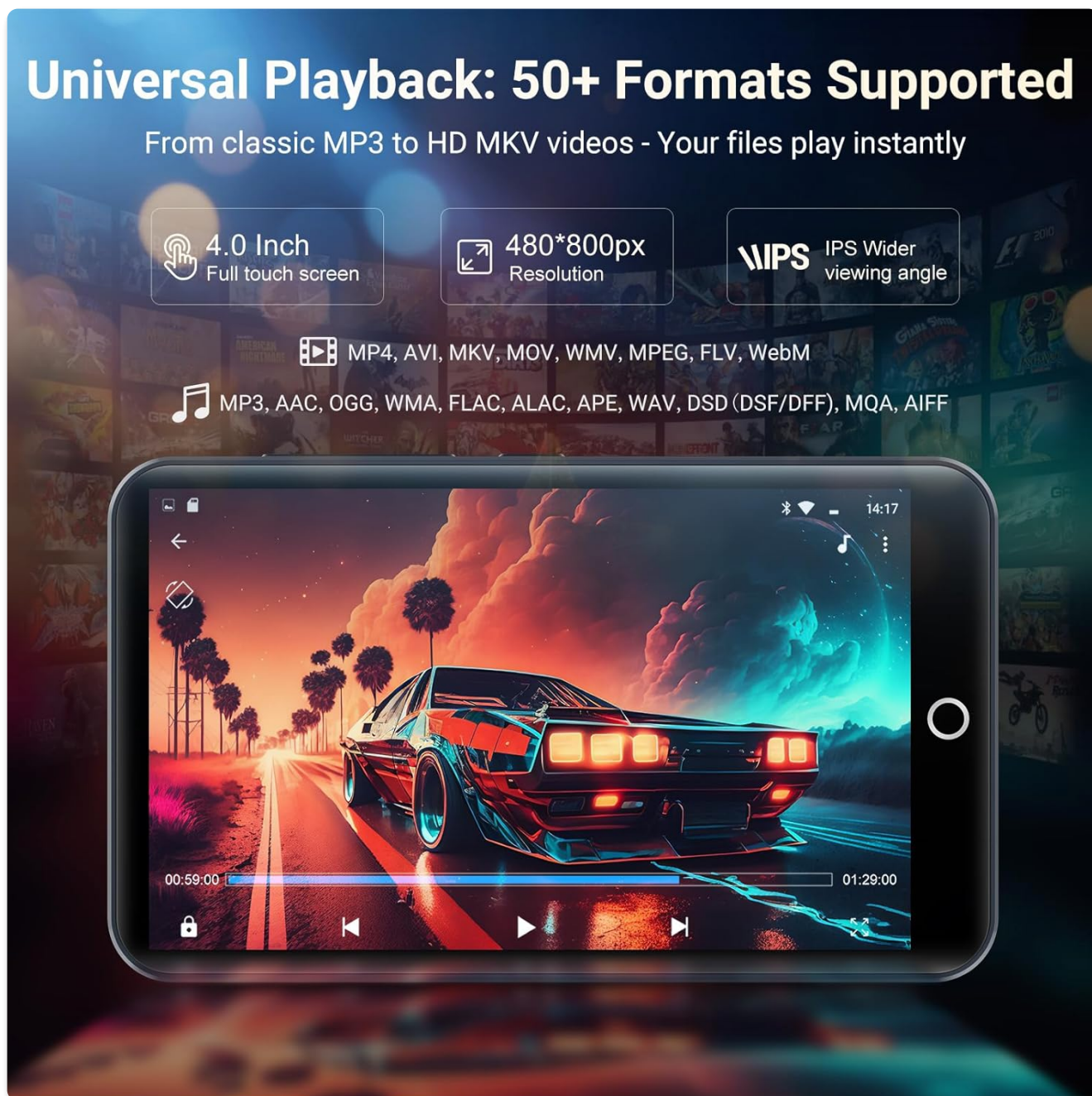
The MECHEN H10 displaying a video in landscape mode, highlighting its 4-inch IPS touchscreen and support for various media formats.

The MECHEN H10 features a responsive 4-inch IPS touchscreen for intuitive navigation. Swipe through screens, tap icons to open applications, and use the physical buttons for volume control and power.