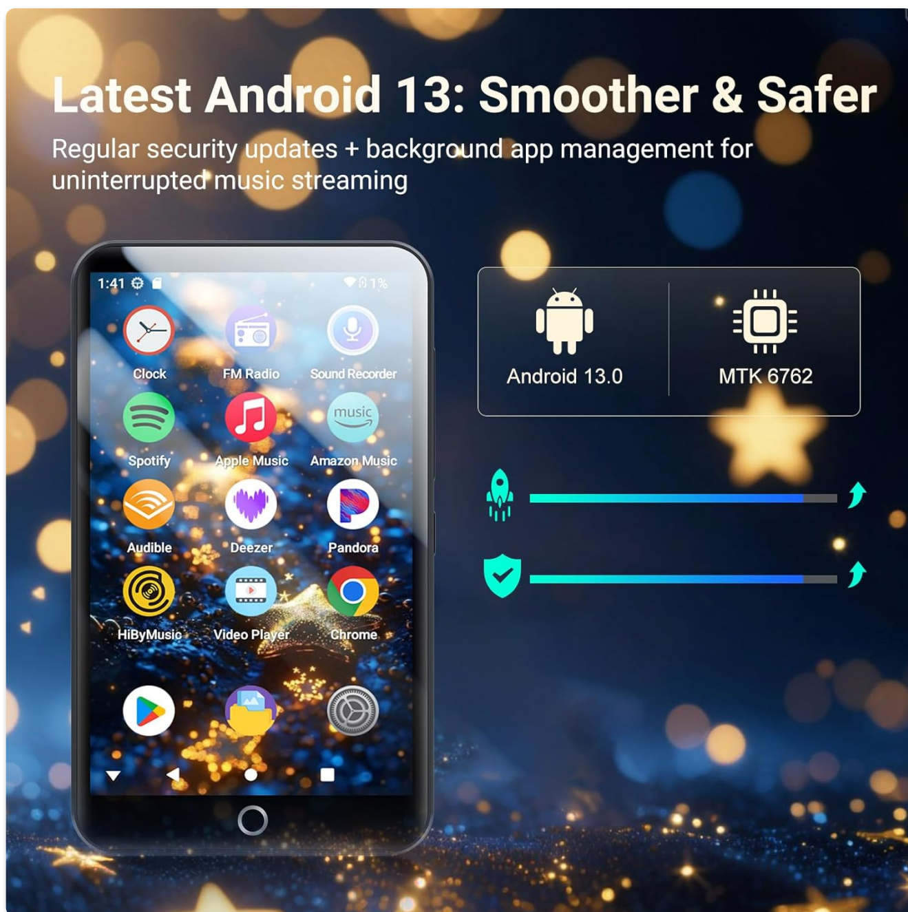
The MECHEN H10 display showing the Android 13 interface with various pre-installed applications, indicating a smooth and modern user experience.

Press and hold the Power button for 3 seconds to turn on the device. Follow the on-screen prompts to select language, time zone, and accept Google Terms to activate Google Play services.