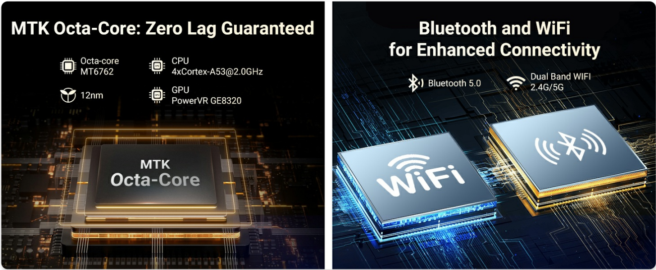
An image showcasing the MTK Octa-Core processor for smooth performance and symbols representing dual-band Wi-Fi and Bluetooth 5.0 for enhanced connectivity on the MECHEN H10.

Your browser does not support the video tag.