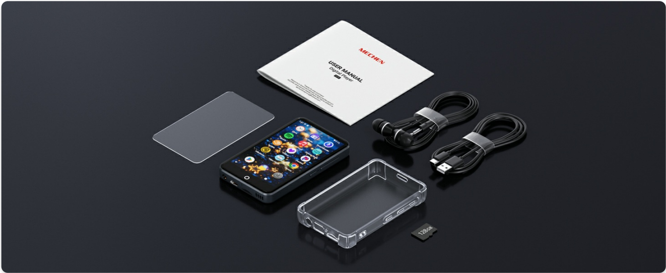
An overhead view of all included accessories: the MECHEN H10 player, USB-C cable, earphones, protective film, protective case, user manual, and a 128GB TF card.