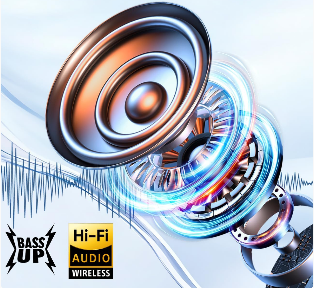
Image: Detailed view of the 12mm dynamic driver responsible for the powerful bass and clear audio.

The 12mm large dynamic drivers deliver pure and high-quality sound with powerful bass.