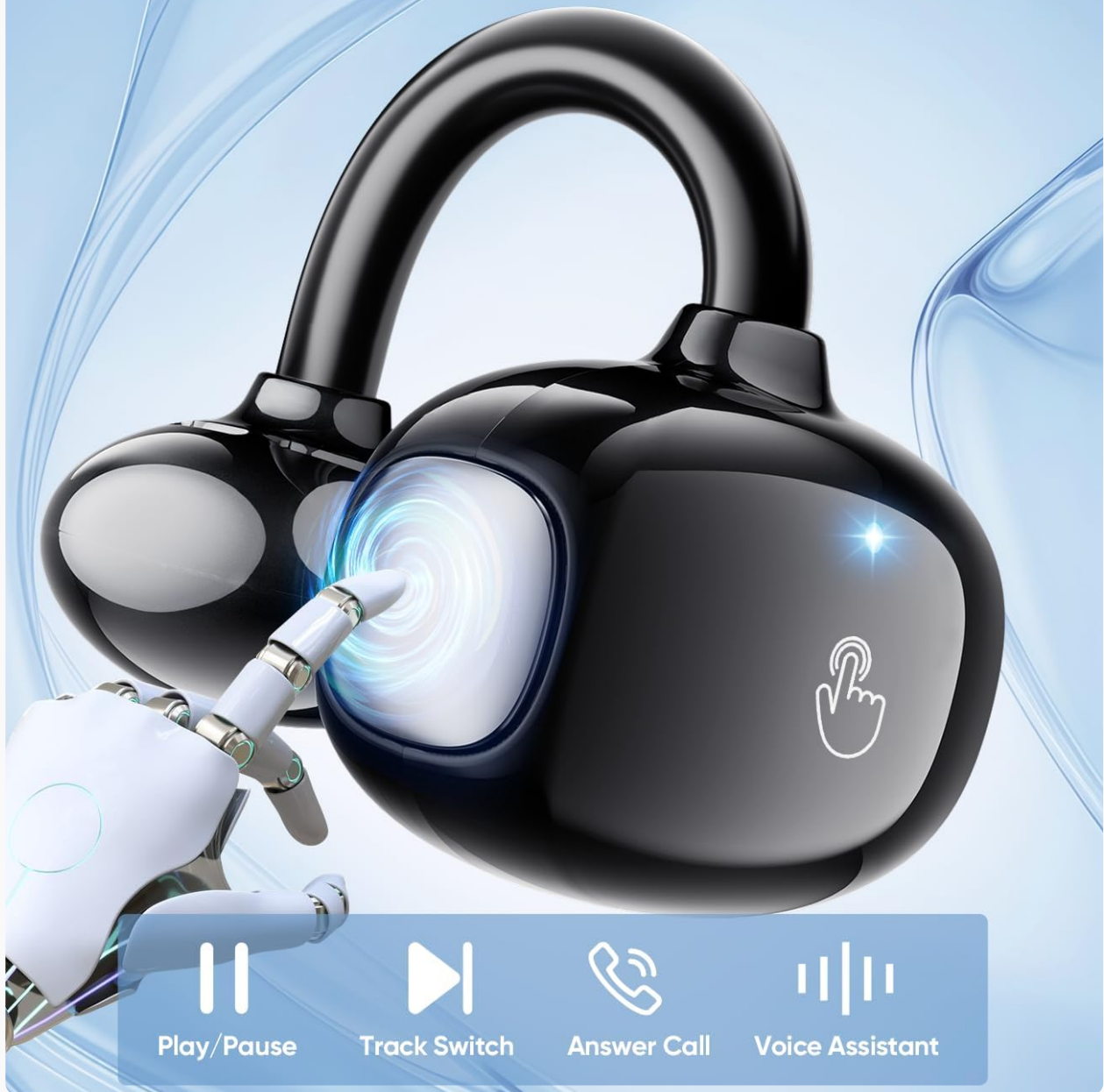
Image: A robotic finger interacting with the physical button on the earbud, highlighting its multifunctionality.

Instant physical control feedback with no fear of mis-touching