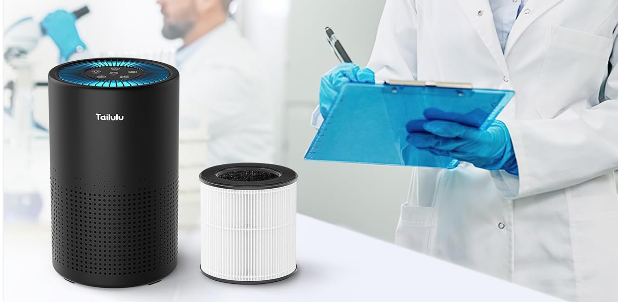
Figure 9: Certifications for the Tailulu Air Purifier, including CARB, CA65, ETL, FCC, and EPA, indicating ozone-free operation.

Compliance with California's Strictest Safety Standards (Available for California).