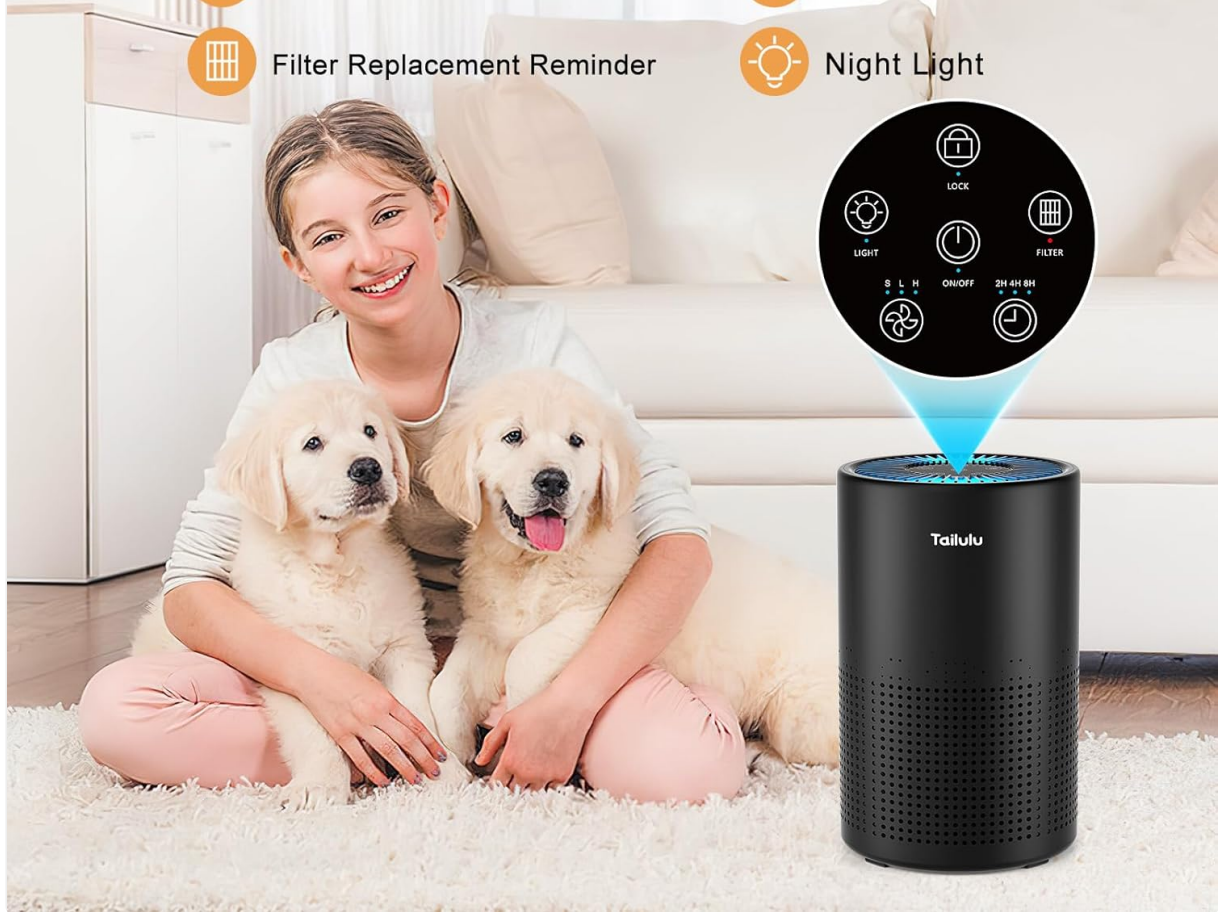
Figure 4: Overview of the smart setting and easy operation control panel with icons for fan modes, timer, child lock, filter reminder, touch ON/OFF, and night light.