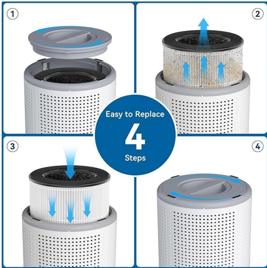
Figure 8: Visual guide for the 4-step filter replacement process.