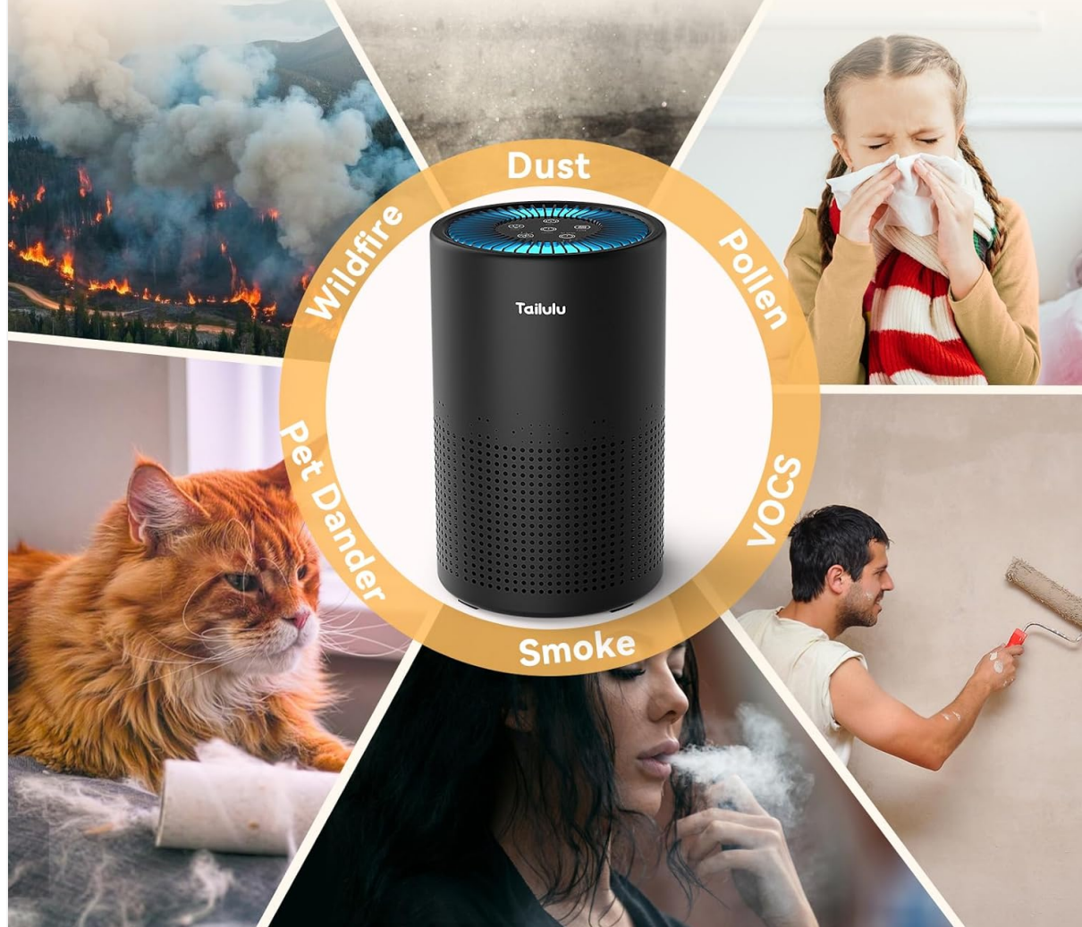
Figure 3: The air purifier's effectiveness against common indoor pollutants such as wildfire smoke, dust, pollen, VOCs, pet dander, and general smoke.