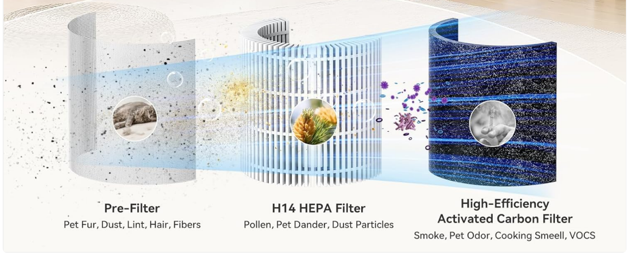
Figure 2: Diagram illustrating the 3-stage filtration system, including pre-filter, H14 HEPA filter, and activated carbon filter.