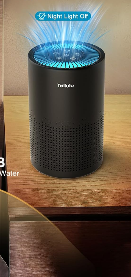
Figure 1: Tailulu AP052 Air Purifier Unit.