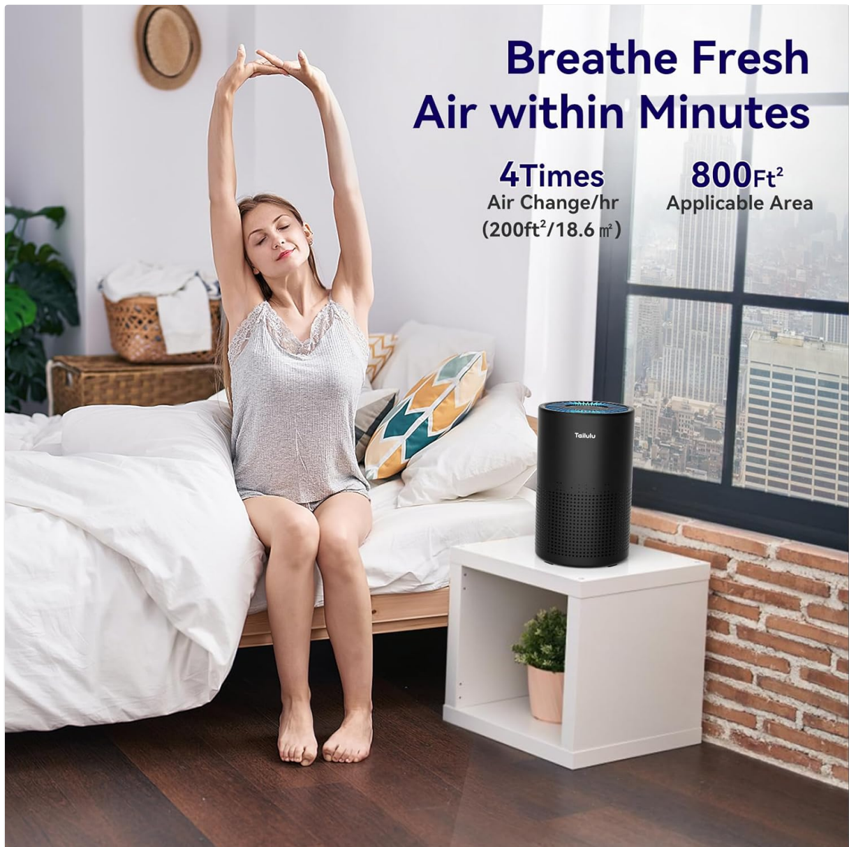
Figure 6: Air purifier operating in a bedroom, demonstrating its coverage and quiet operation.