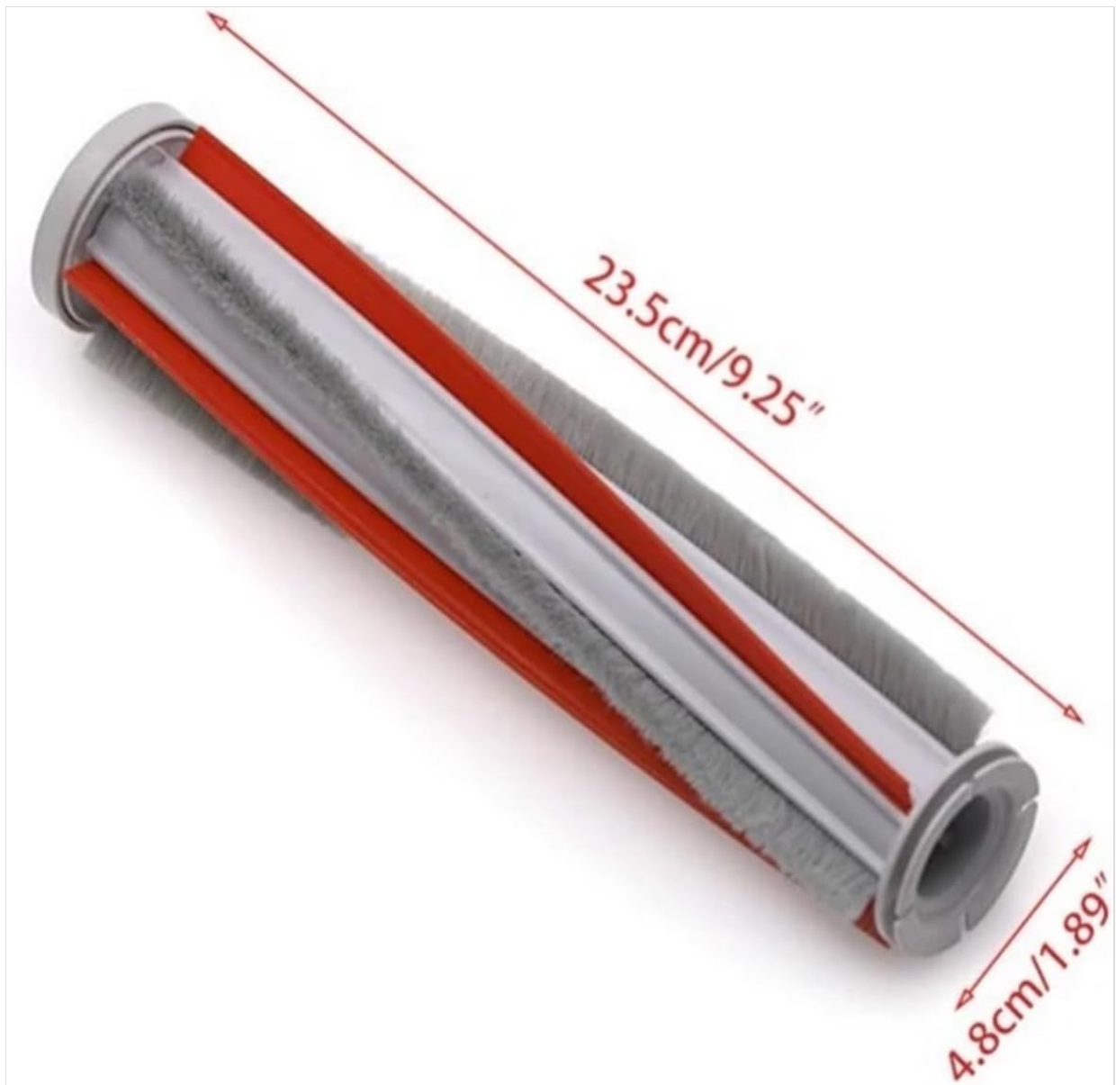
Figure 4: Main roller brush dimensions.