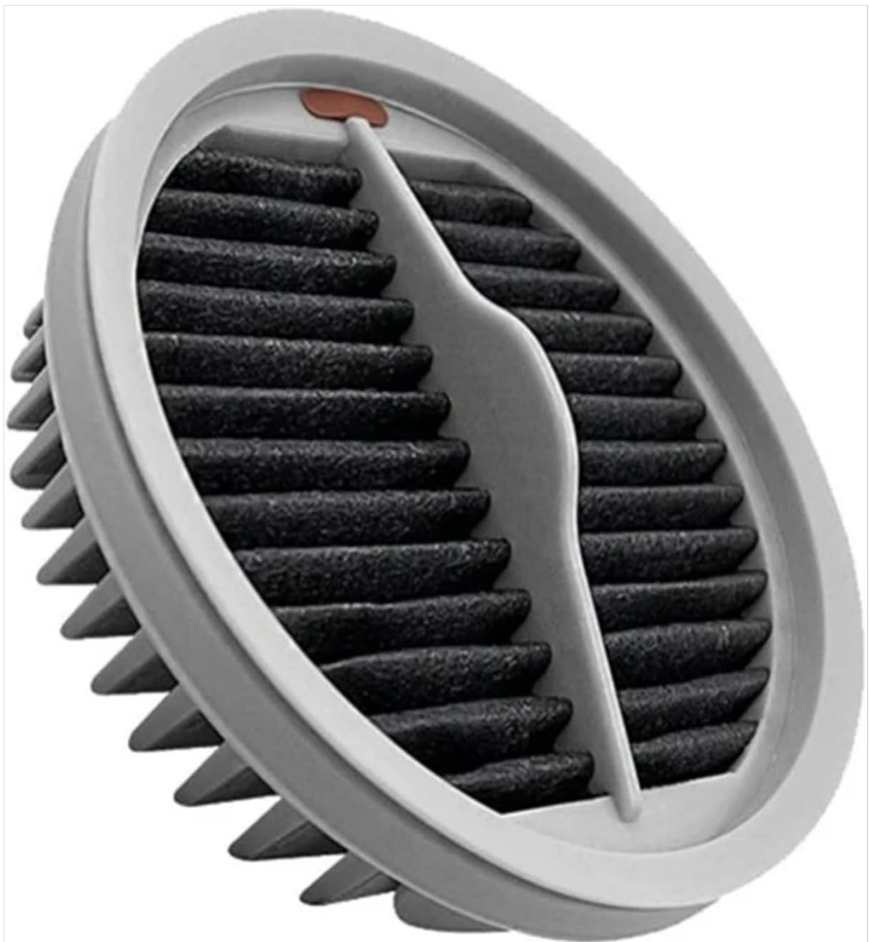
Figure 2: A VEODONT HEPA filter, ready for installation.