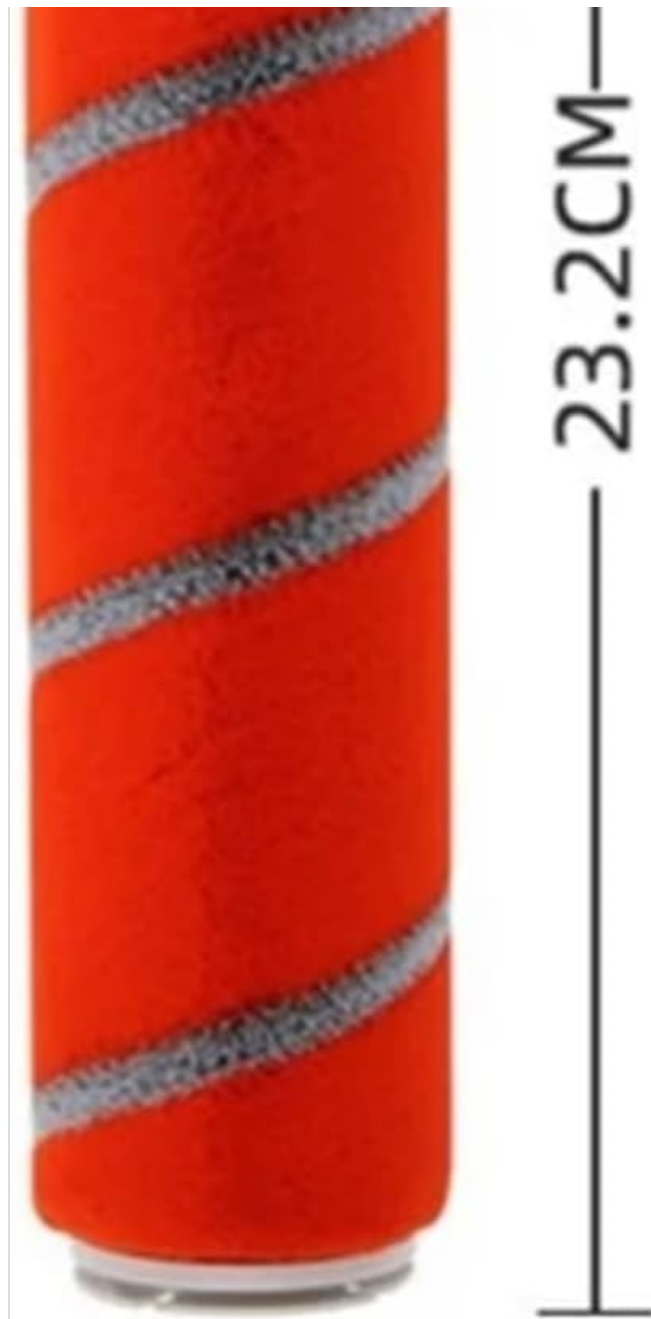
Figure 5: Soft roller brush dimensions.