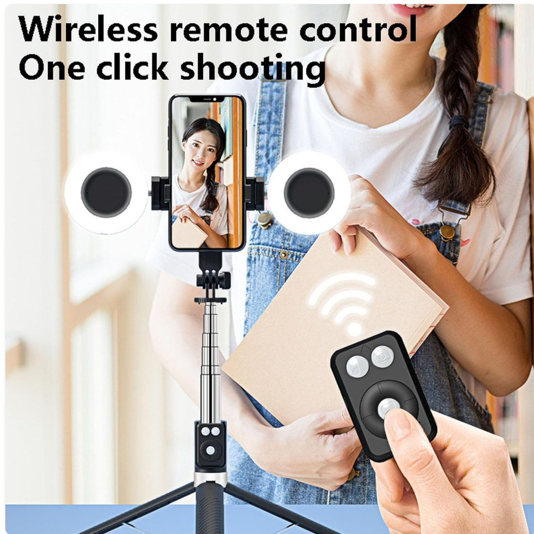
The embedded and detachable wireless remote control for portable storage.

The remote control is typically embedded in the handle. Slide it out. Turn on the remote by pressing and holding the button until an indicator light flashes. On your phone, go to Bluetooth settings and search for available devices. Select the device named "SelfieCom" or similar to pair. The indicator light will stop flashing once paired. No app pairing is needed.