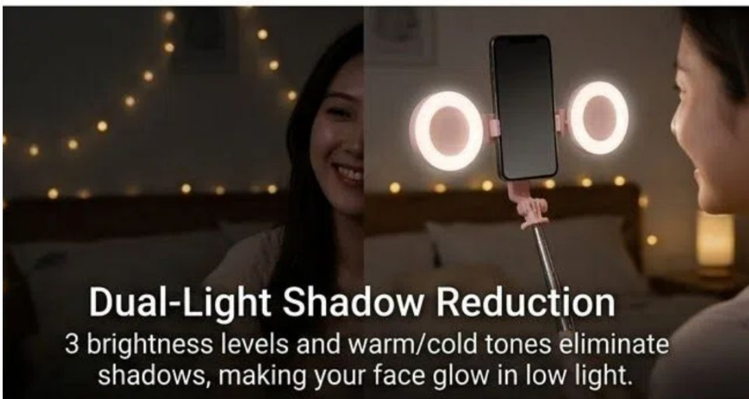
Dual lighting effectively reduces shadows for improved low-light performance.