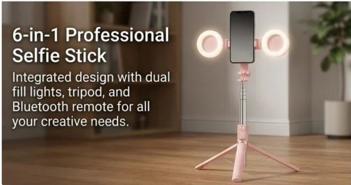
The 6-in-1 Selfie Stick with Fill Light, showcasing its integrated design with dual fill lights, tripod, and Bluetooth remote.

Integrated design with dual fill lights, tripod, and Bluetooth remote for all your creative needs.