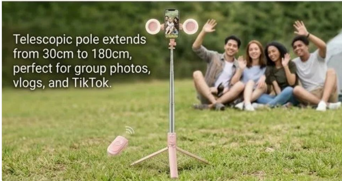
The selfie stick in tripod mode, ideal for group photos and vlogs.