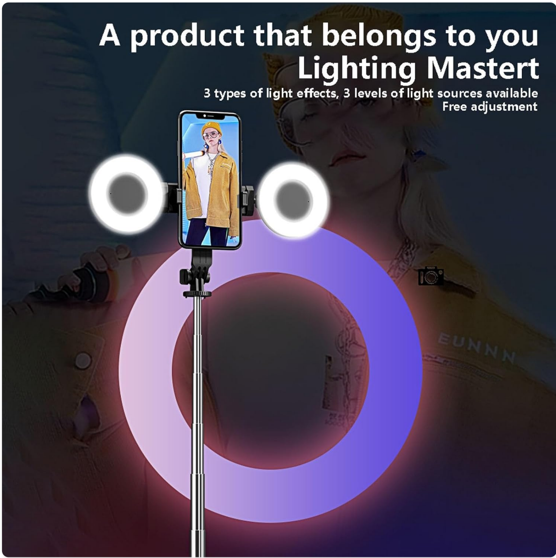
The selfie stick extended to 165cm for a wider shooting range.