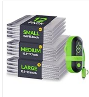
Image: The USB Portable Electric Pump showing its compatibility with chargers, power banks, and PCs.