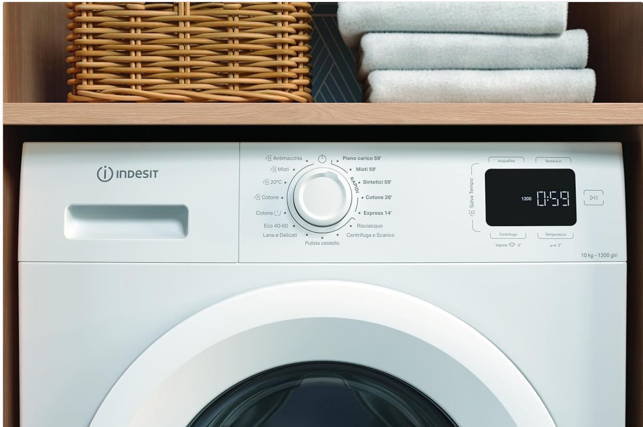
Image: Close-up of the Indesit washing machine's control panel, highlighting the program selection dial and digital display.

The Indesit IM 1072 MY TIME IT offers a variety of programs to suit different laundry needs. Refer to the control panel image for program names.