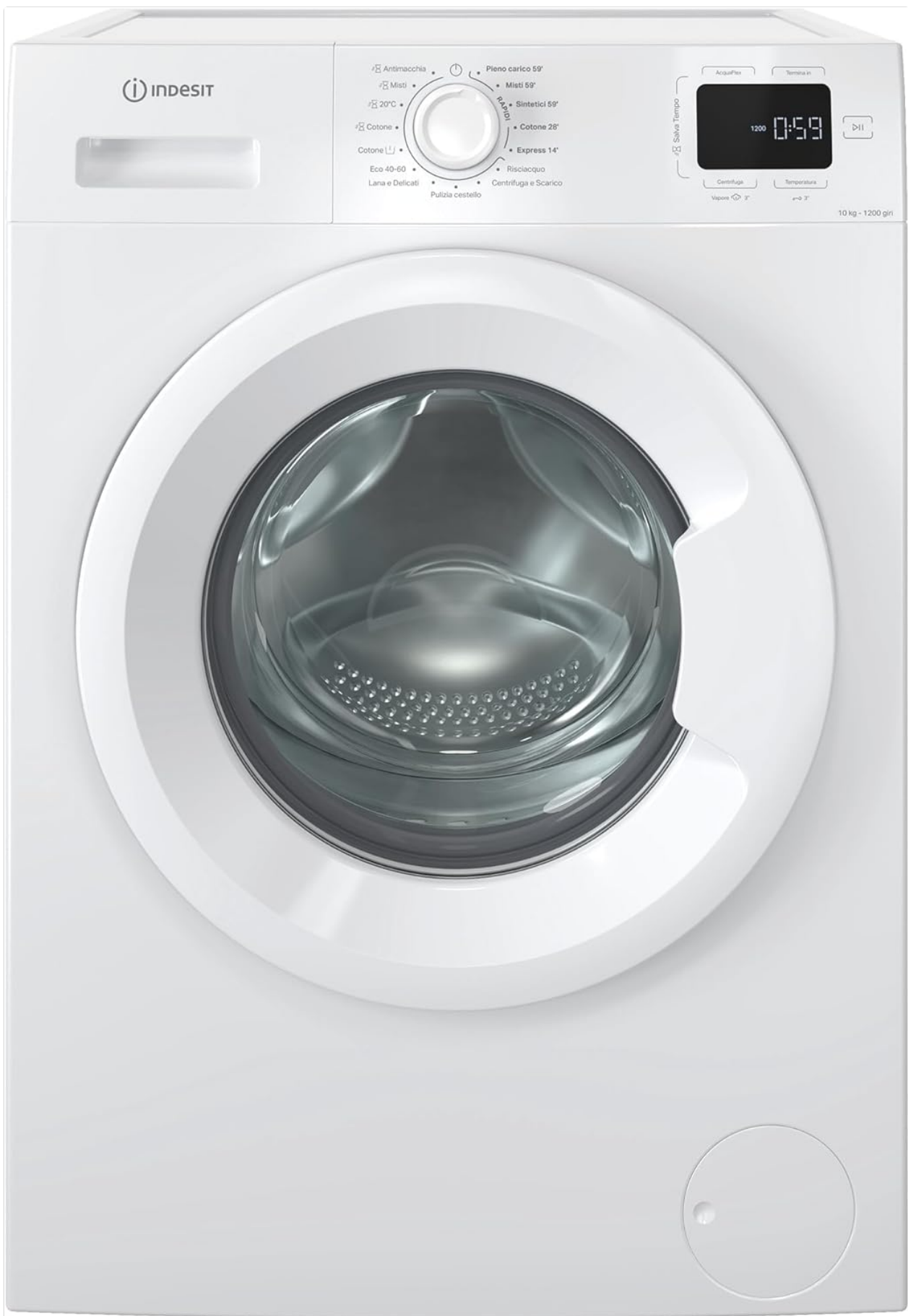
Image: Front view of the Indesit IM 1072 MY TIME IT Washing Machine, showcasing its white finish and central loading door.