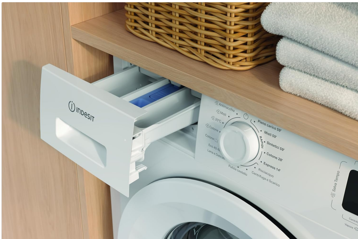
Image: The detergent drawer of the Indesit washing machine pulled open, showing compartments for pre-wash, main wash, and fabric softener.

The detergent dispenser has compartments for: