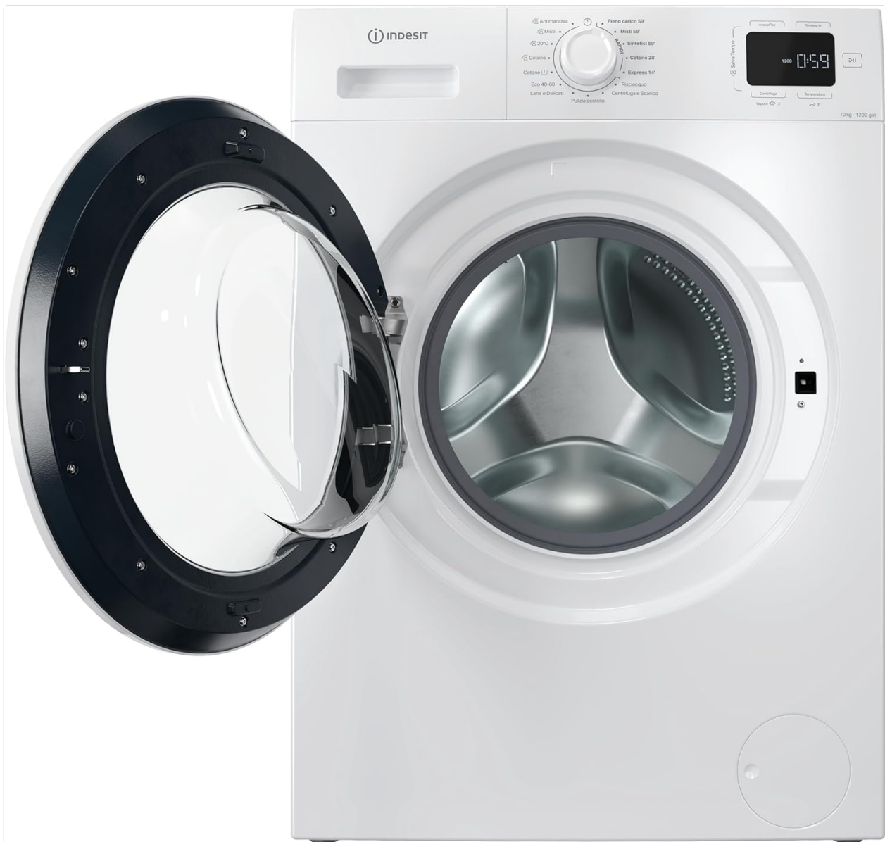
Image: The Indesit washing machine with its door open, revealing the stainless steel drum ready for loading laundry.