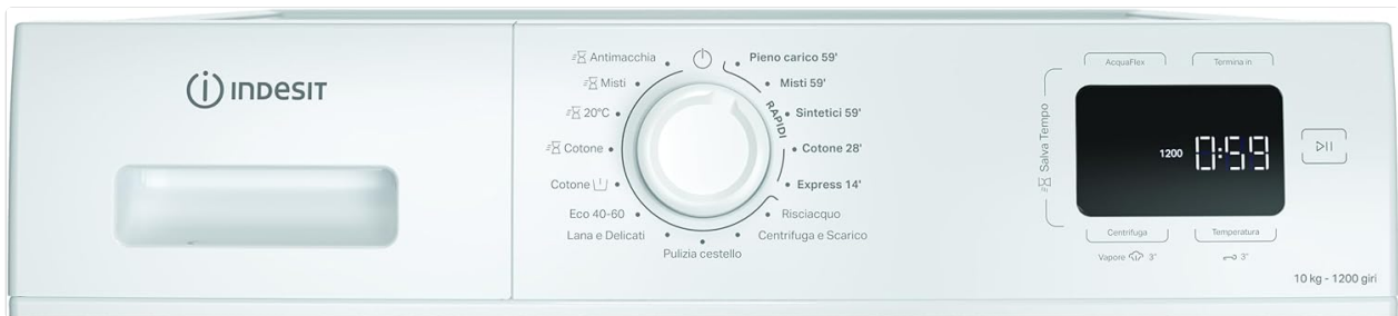
Image: Detailed view of the Indesit washing machine's control panel, showing the program selector dial, display, and function buttons.