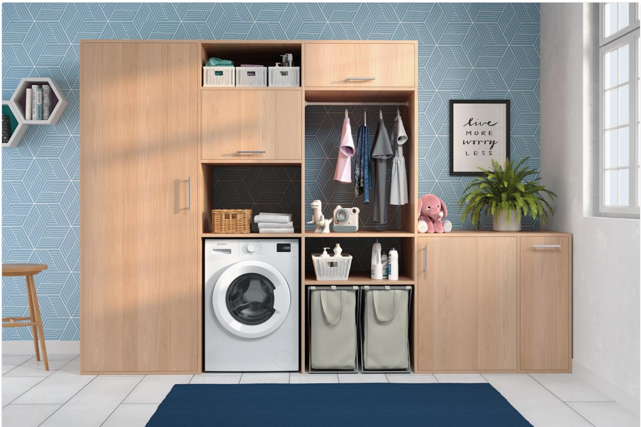
Image: Indesit washing machine integrated into a modern laundry room setup, demonstrating typical placement.

Proper installation is crucial for the safe and efficient operation of your washing machine. Refer to the detailed installation guide provided with the appliance for specific instructions.