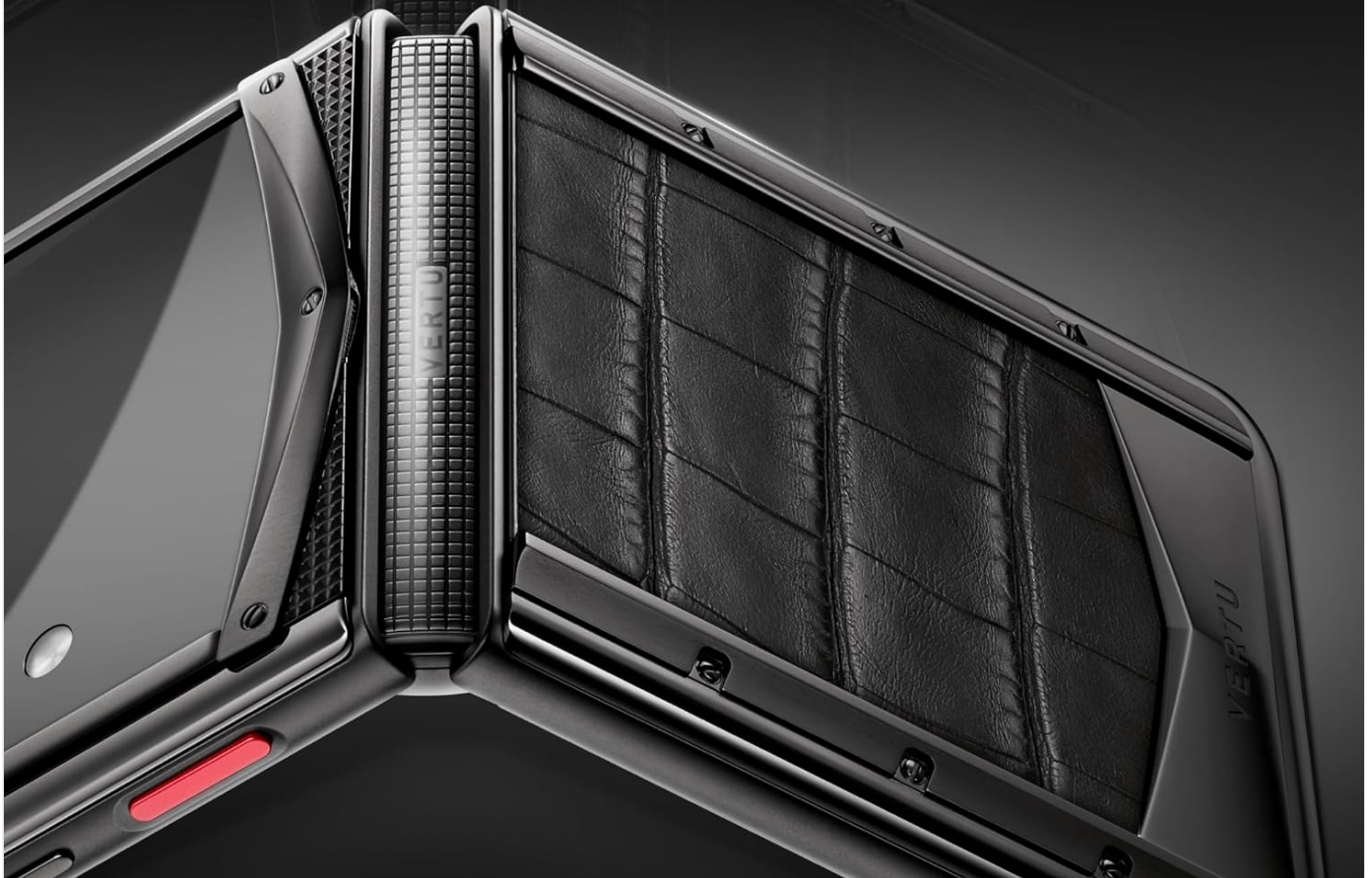
Image: A detailed close-up of the VERTU Quantum Flip's folding hinge mechanism. The image emphasizes the intricate design and robust construction of the 'Quantum King Kong Folding Hinge', a key component of the phone's foldable design.