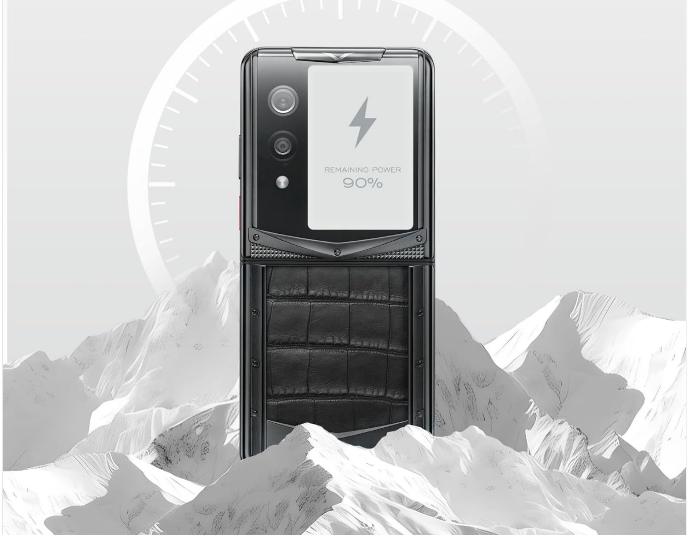
Image: The VERTU Quantum Flip smartphone, folded, with its external screen displaying a high battery percentage (90%). This image highlights the device's strong battery performance and efficient power management.