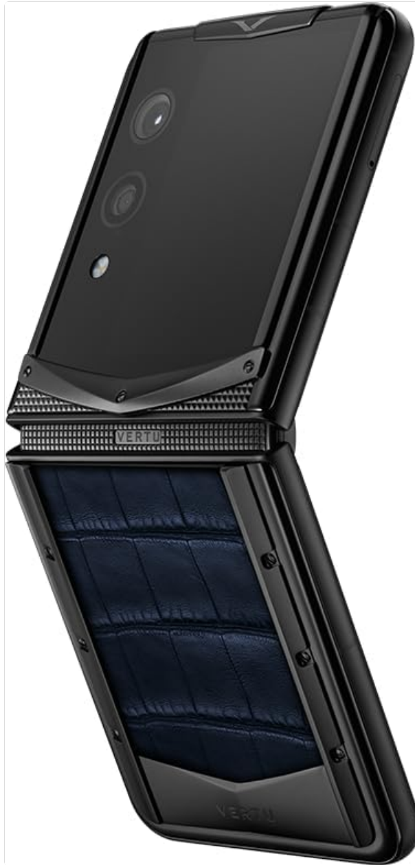
Image: The VERTU Quantum Flip smartphone, folded, highlighting its compact form factor and the distinctive navy blue alligator leather finish on the lower half of the device. The upper half shows the camera module and a sleek black surface.

Your VERTU Quantum Flip features a 6.9-inch FHD+ OLED main display and a 3-inch external OLED screen. The external screen allows for quick glances at notifications, time, and other essential information without unfolding the device. Certain applications and features can be accessed directly from the external display for enhanced efficiency.