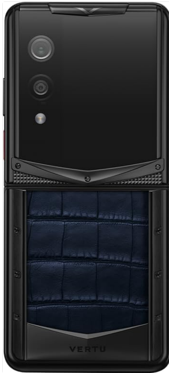
Image: The VERTU Quantum Flip smartphone in its unfolded position, viewed from the rear. The image clearly displays the dual camera setup and flash on the upper section, along with the textured navy blue alligator leather on the lower section, emphasizing the premium materials.