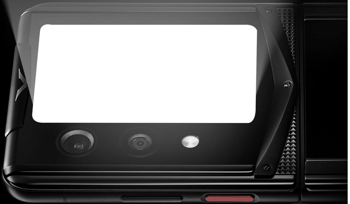
Image: A close-up view of the VERTU Quantum Flip's external display, shown illuminated. This image highlights the functionality of the secondary screen, which can be used for quick access to information or AI-powered features.