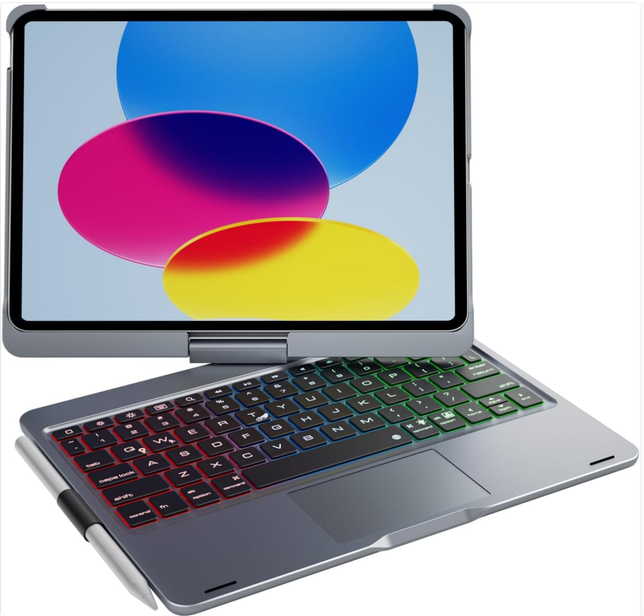
Image 1.1: doqo Keyboard Case with an iPad, showcasing the keyboard and the tablet in an open position.