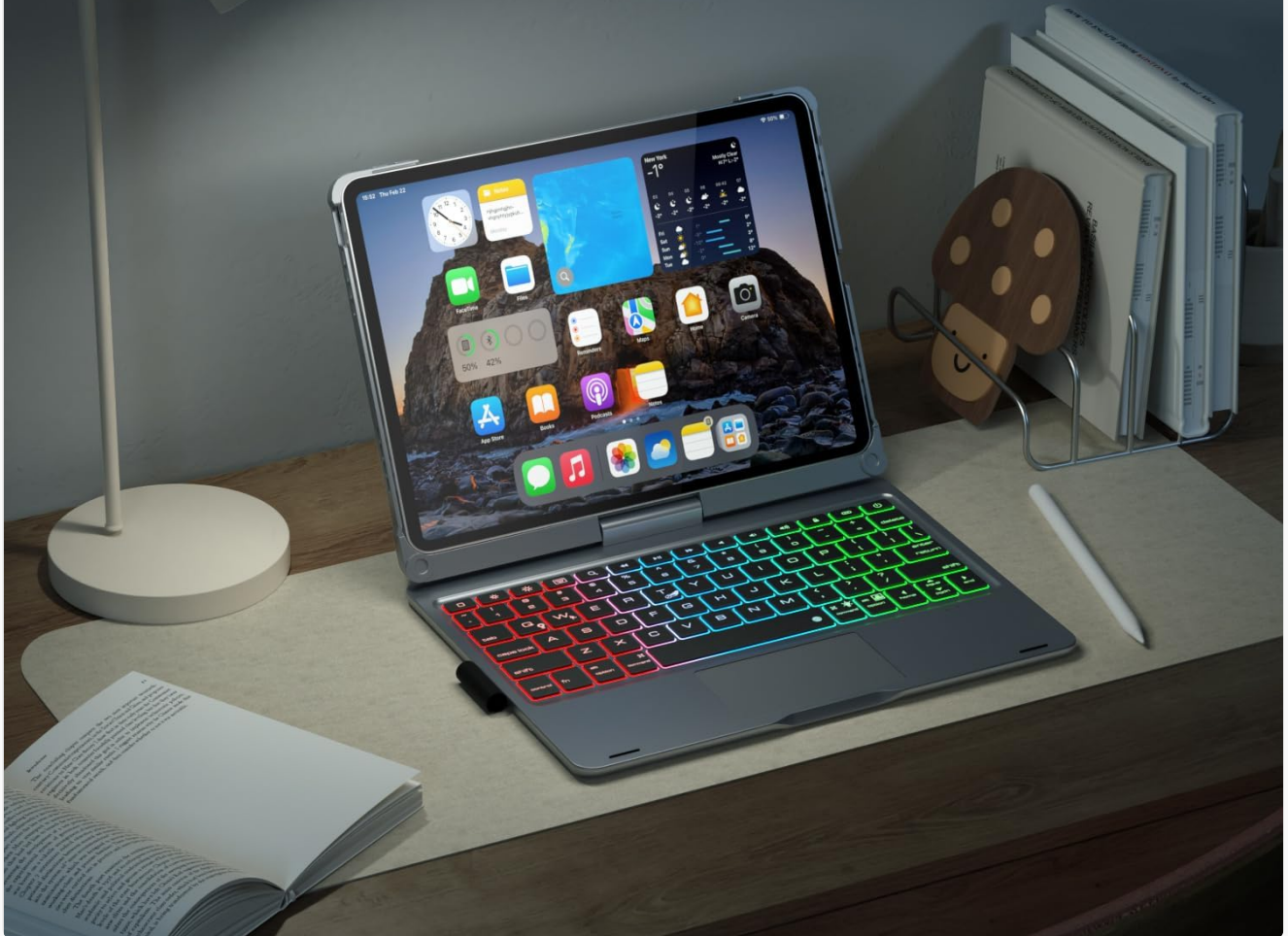
Image 3.3: The doqo keyboard case displaying its 7-color RGB backlit keys, illustrating how laser-etched characters enhance visibility.

Laser-etched keycap characters that shine through make the keyboard backlighting more eye-friendly