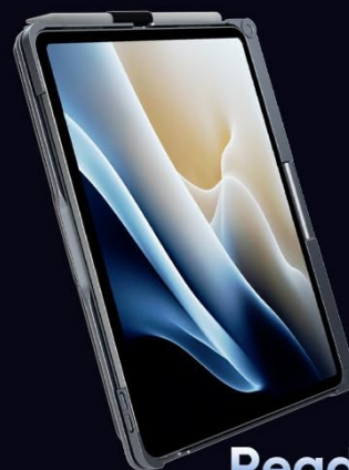
Image 3.1: Illustration of the six versatile usage modes: Sharing, Protect, Painting, Watching, Working, and Reading, enabled by the 360° rotatable and 180° folding design.