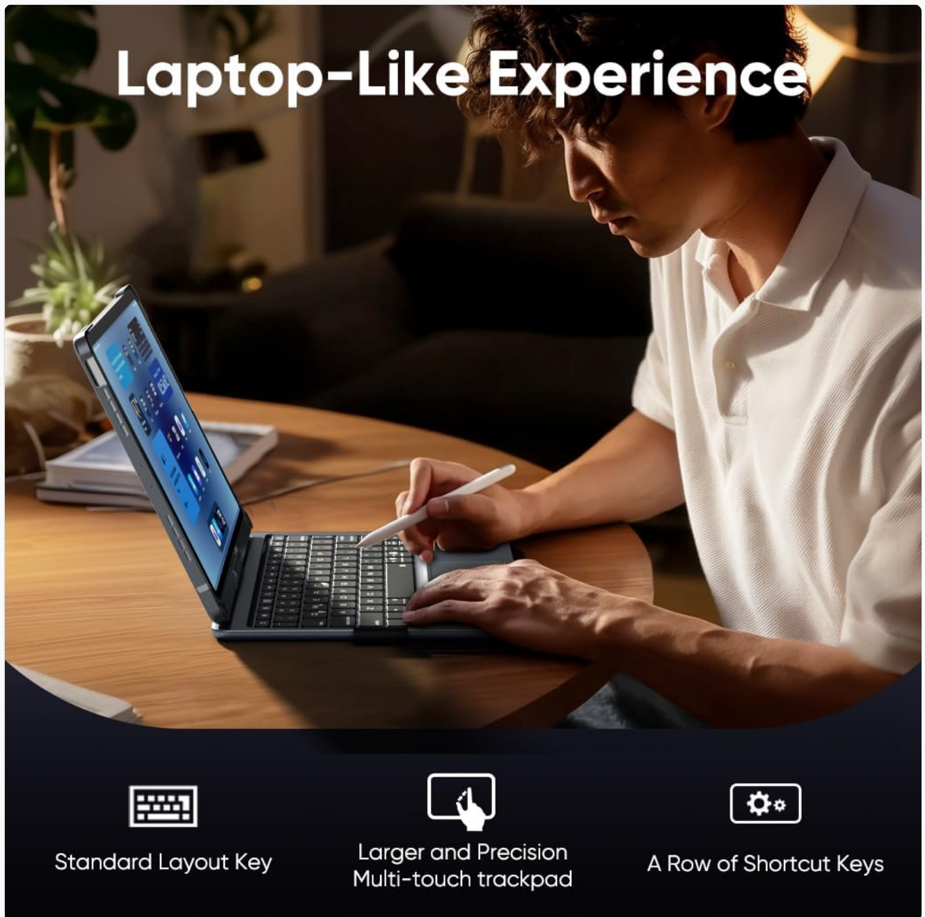
Image 3.2: A user interacting with the doqo keyboard case, highlighting the standard layout keys, multi-touch trackpad, and a row of shortcut keys for a laptop-like experience.