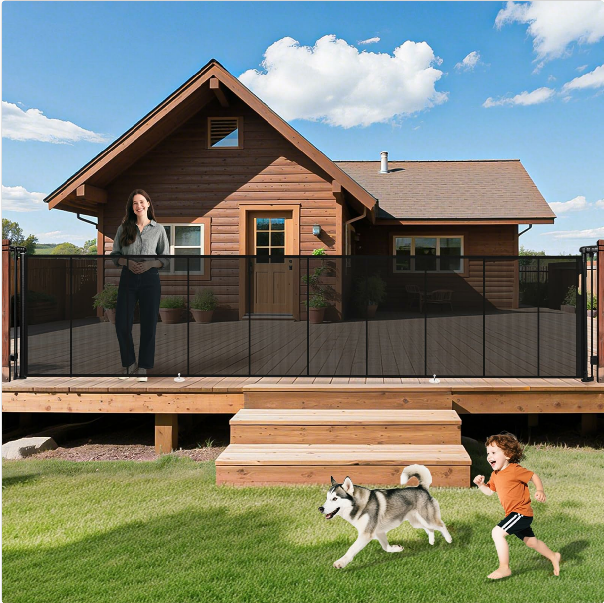
Image: The Pravoluxmax Retractable Baby Gate in its fully extended position, showcasing its wide coverage.