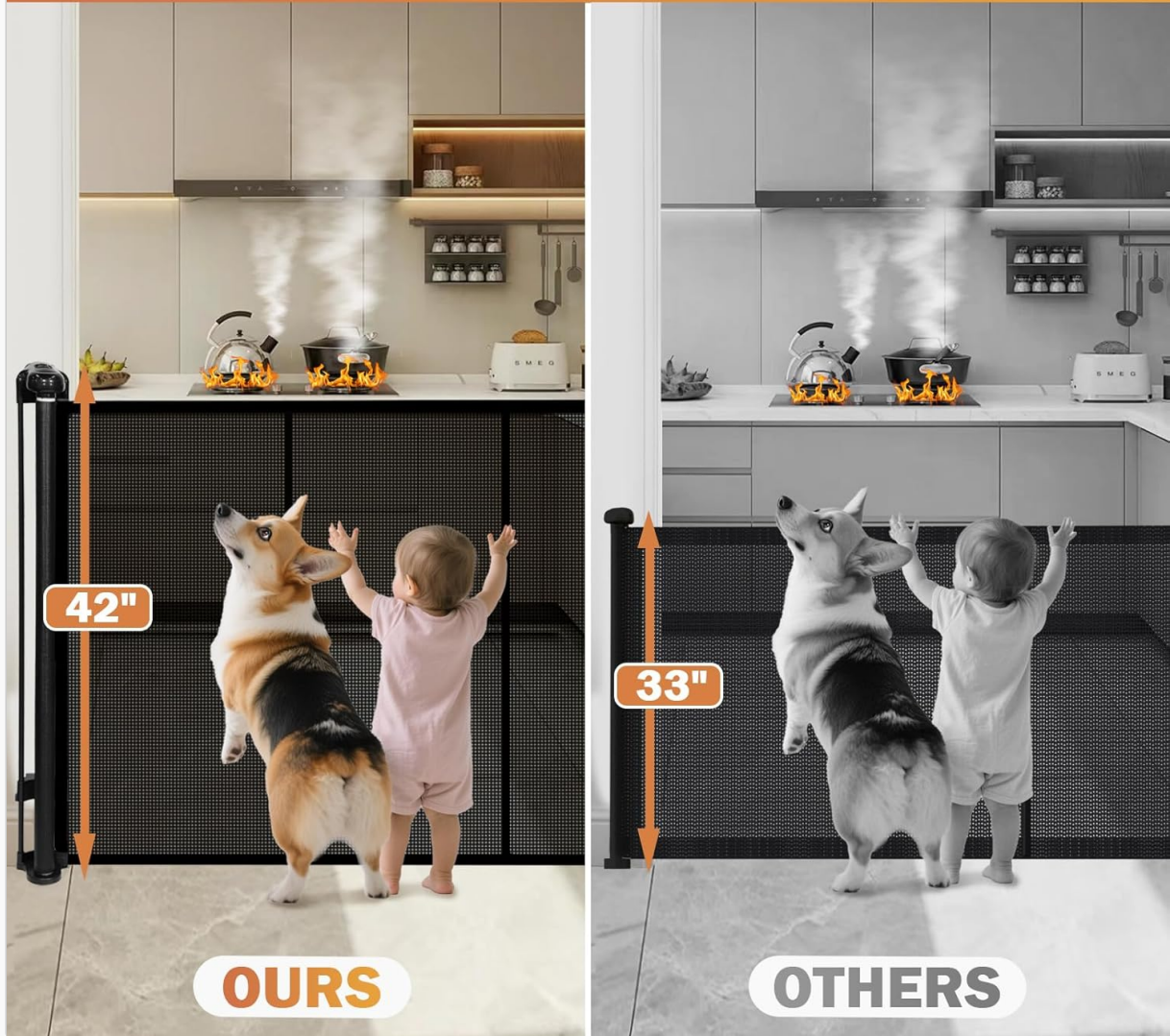
Image: Visual comparison highlighting the 42-inch height of the Pravoluxmax gate, providing superior safety against climbing for children and pets.