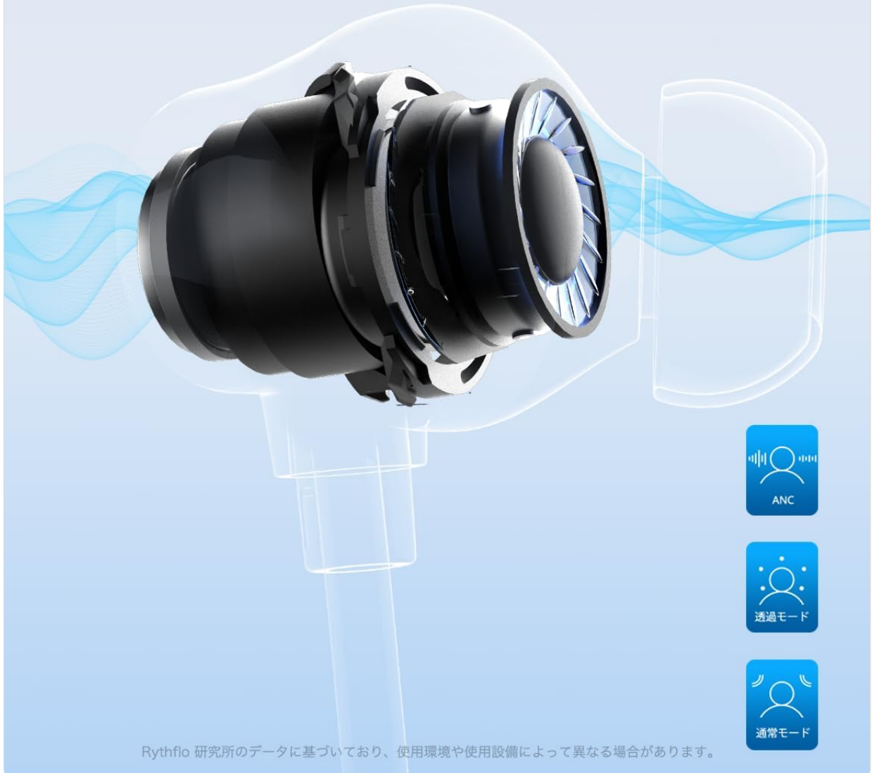
Image: Rythflo WH04 Neckband Headphones showing the overall design.