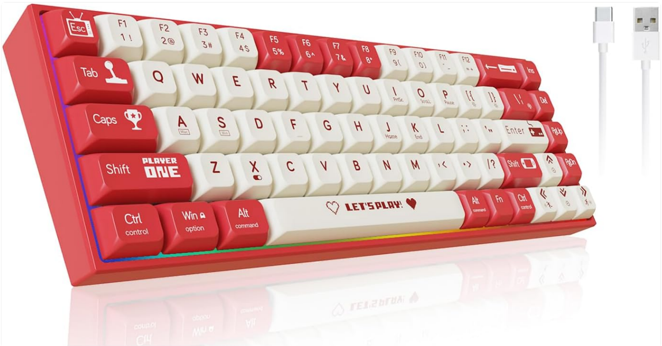
Figure 1: Attoe AK680 Mechanical Gaming Keyboard.

The Attoe AK680 is a wired mechanical gaming keyboard designed for performance and customization. It features a compact 60% layout, RGB backlighting, hot-swappable switches, and durable double-shot PBT keycaps. This manual provides essential information for setting up, operating, and maintaining your keyboard.