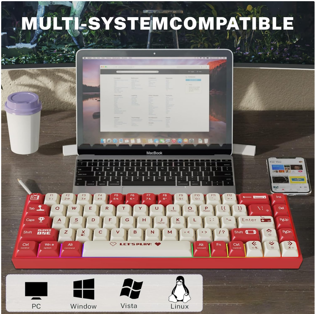
Figure 3: Multi-system compatibility of the keyboard.