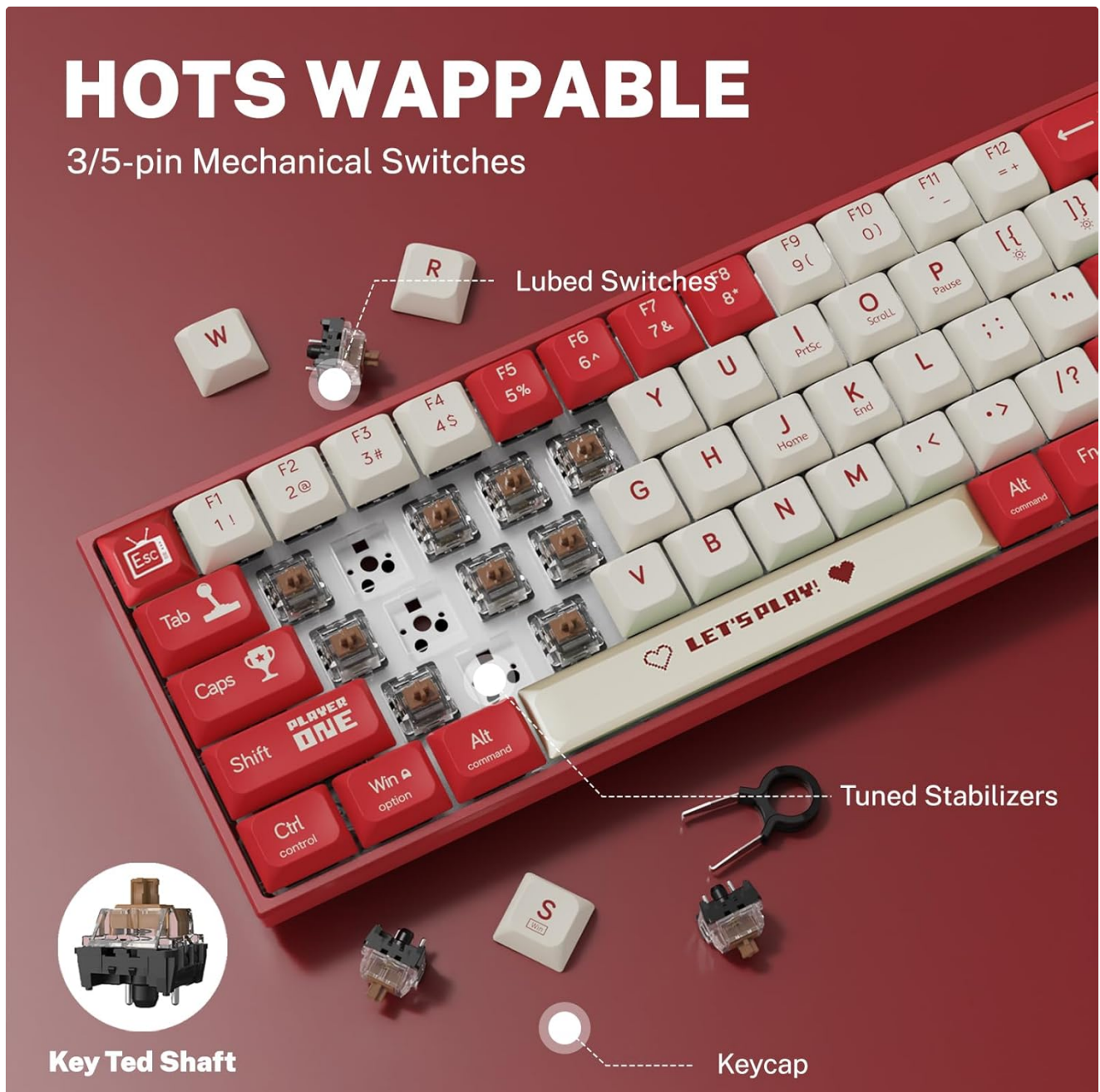
Figure 6: Hot-swappable switch mechanism.