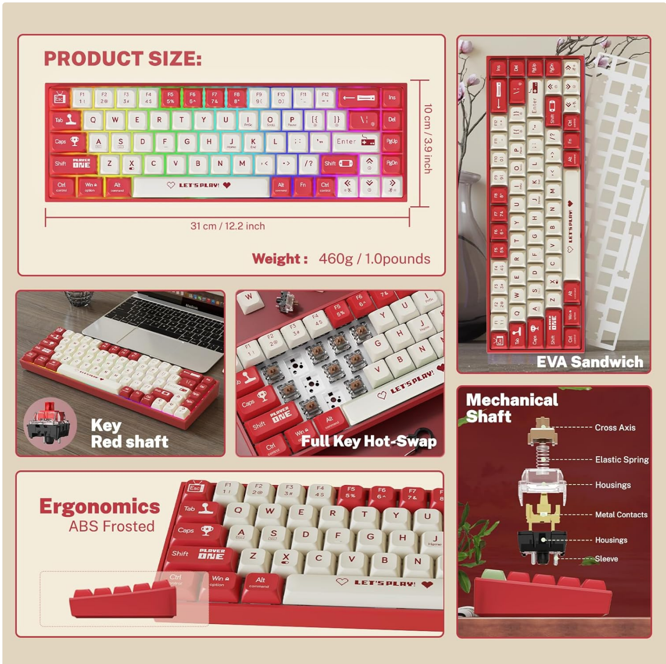
Figure 7: Components of a mechanical switch and tools for maintenance.