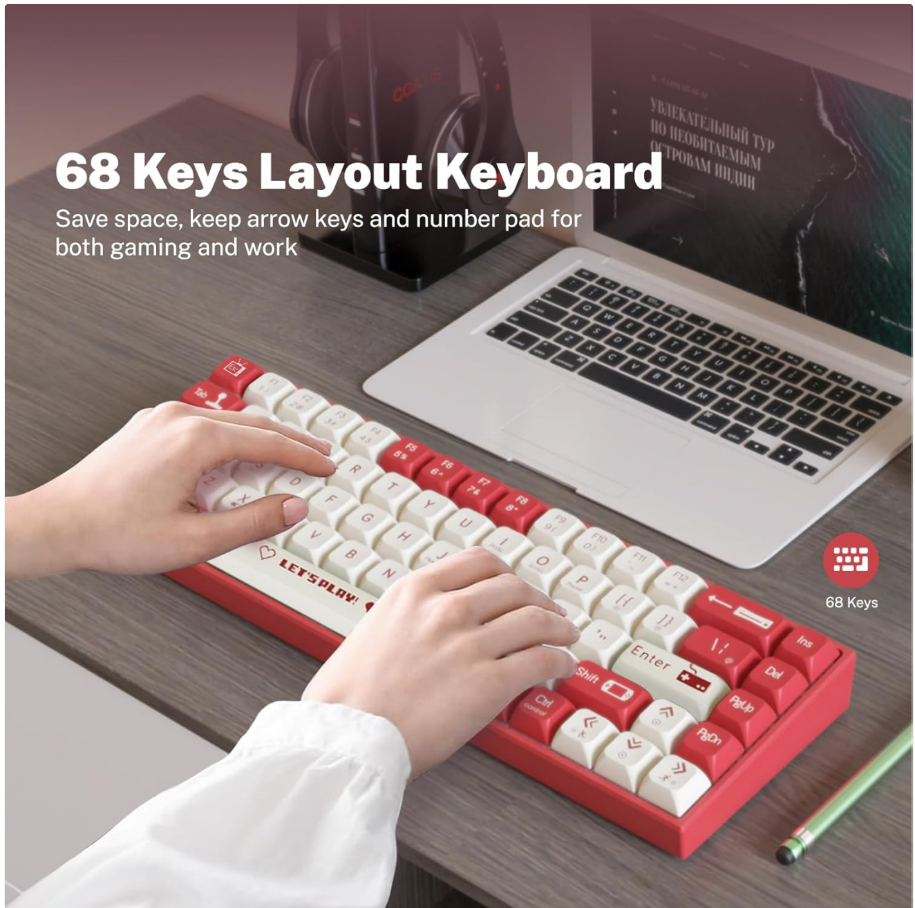
Figure 4: The 68-key layout for efficient use.

Save space, keep arrow keys and number pad for both gaming and work