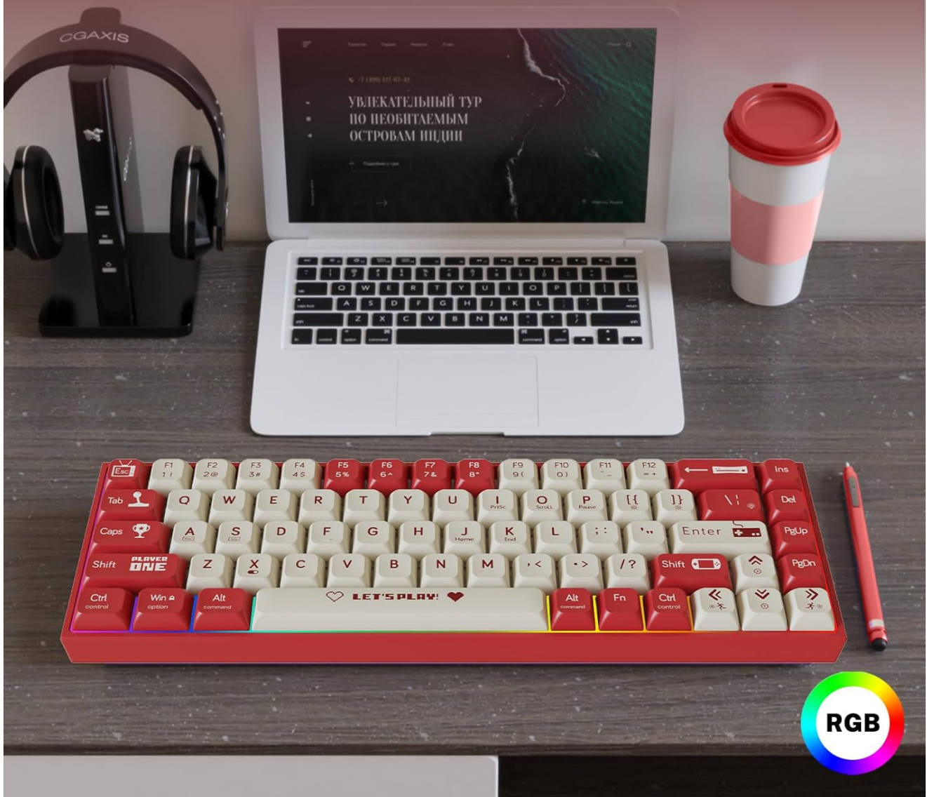
Figure 5: RGB Backlighting in operation.

Create the ultimate game atmosphere with vibrant lighting effect