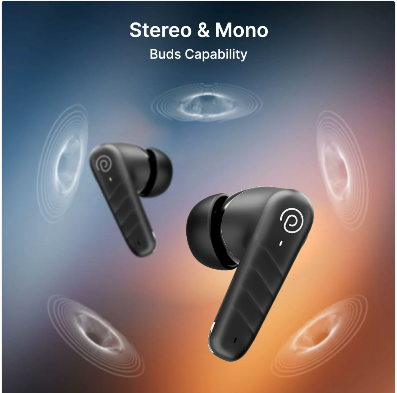
Image: Two pTron Bassbuds Spark earbuds shown separately, highlighting their ability to function in both stereo and mono modes.

The Bassbuds Spark can be used in either stereo mode (both earbuds) or mono mode (single earbud). Simply remove one earbud from the case to use it independently. The other earbud can remain in the case or be used later to switch back to stereo mode.