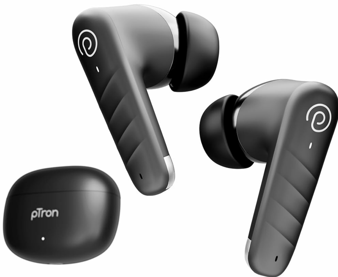
Image: pTron Bassbuds Spark TWS Earbuds and their charging case, displayed in black.