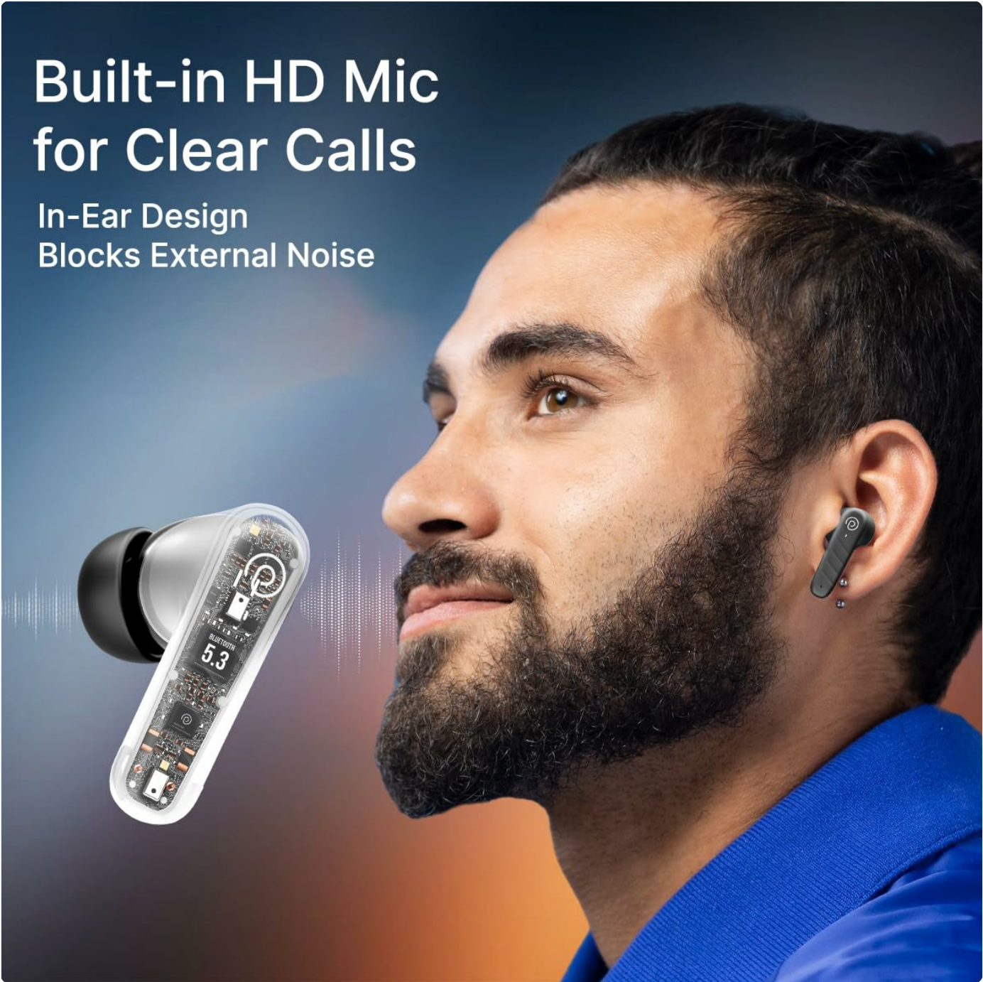
Image: A man wearing a pTron Bassbuds Spark earbud, demonstrating the clear call quality provided by the built-in HD microphone and in-ear design that blocks external noise.

The built-in HD microphone ensures clear call quality. Use the touch controls as described above to manage calls.