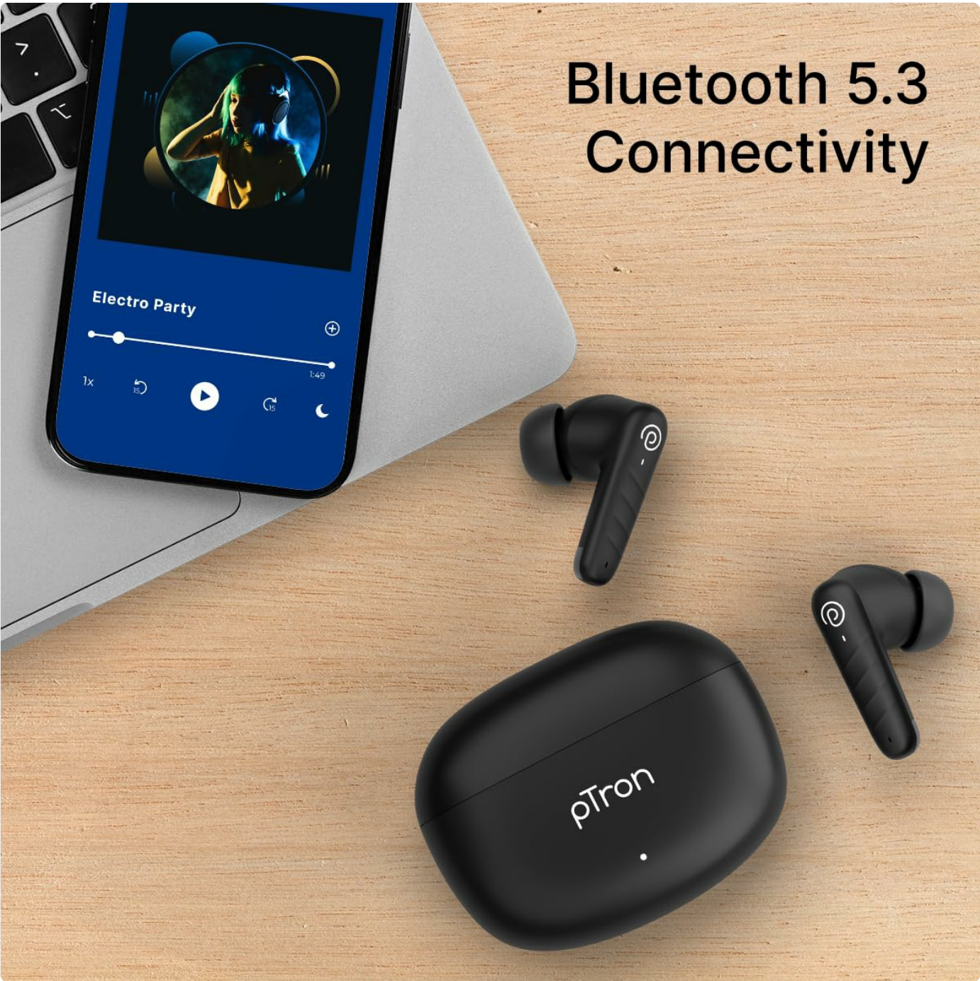
Image: pTron Bassbuds Spark earbuds and their case positioned next to a laptop, highlighting Bluetooth 5.3 connectivity.