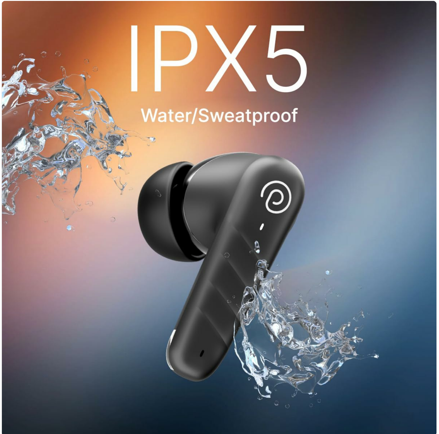
Image: A pTron Bassbuds Spark earbud with water splashing around it, demonstrating its IPX5 water/sweatproof rating.