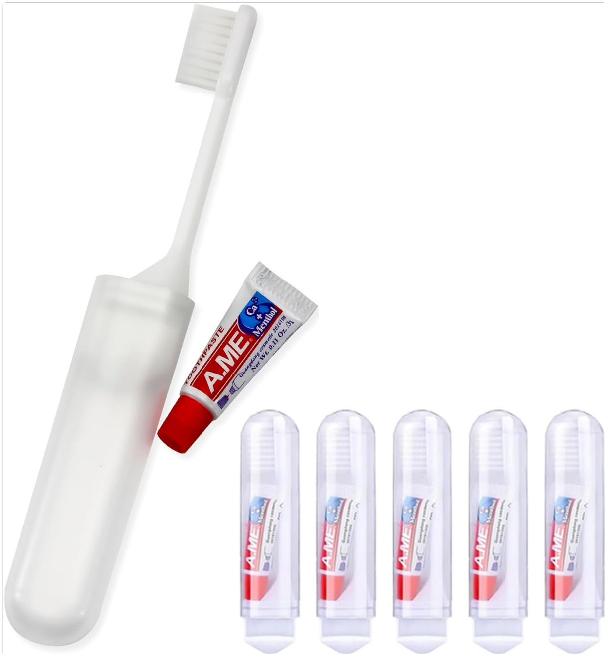
Figure 1: Contents of the JOUGE Travel Toothbrush Set, showing a folded toothbrush and a mini toothpaste tube.