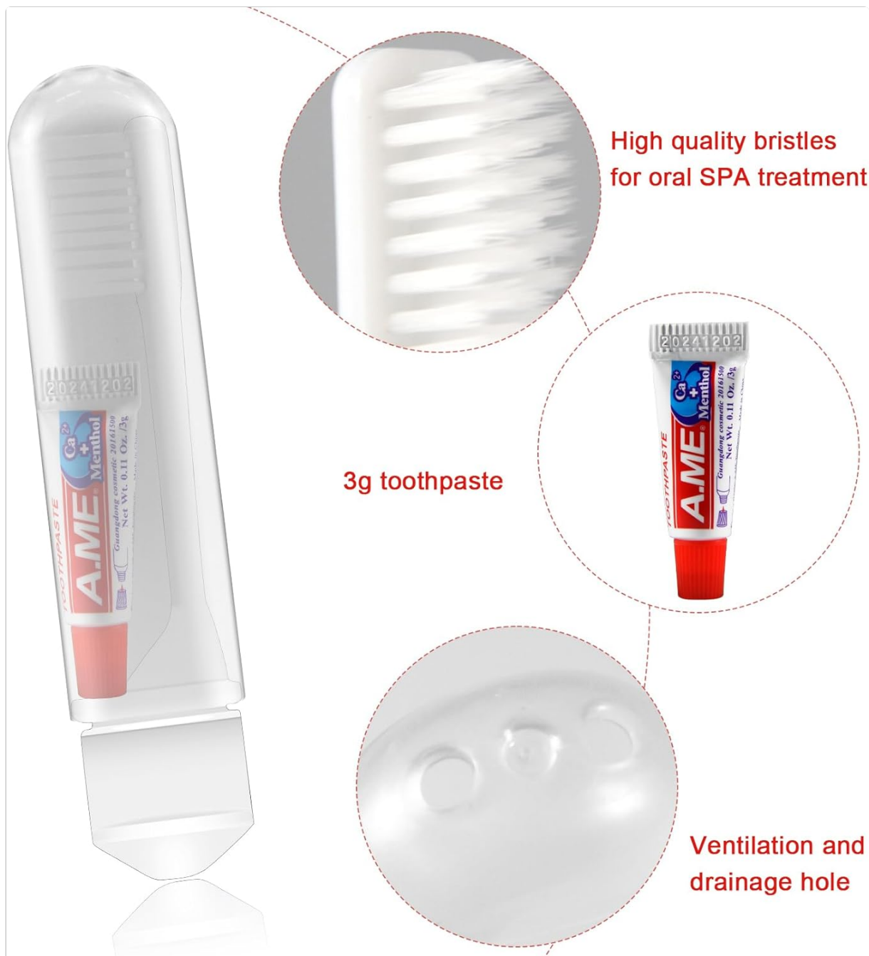
Figure 4: Detail of the ventilation and drainage hole on the toothbrush case, designed for proper drying.