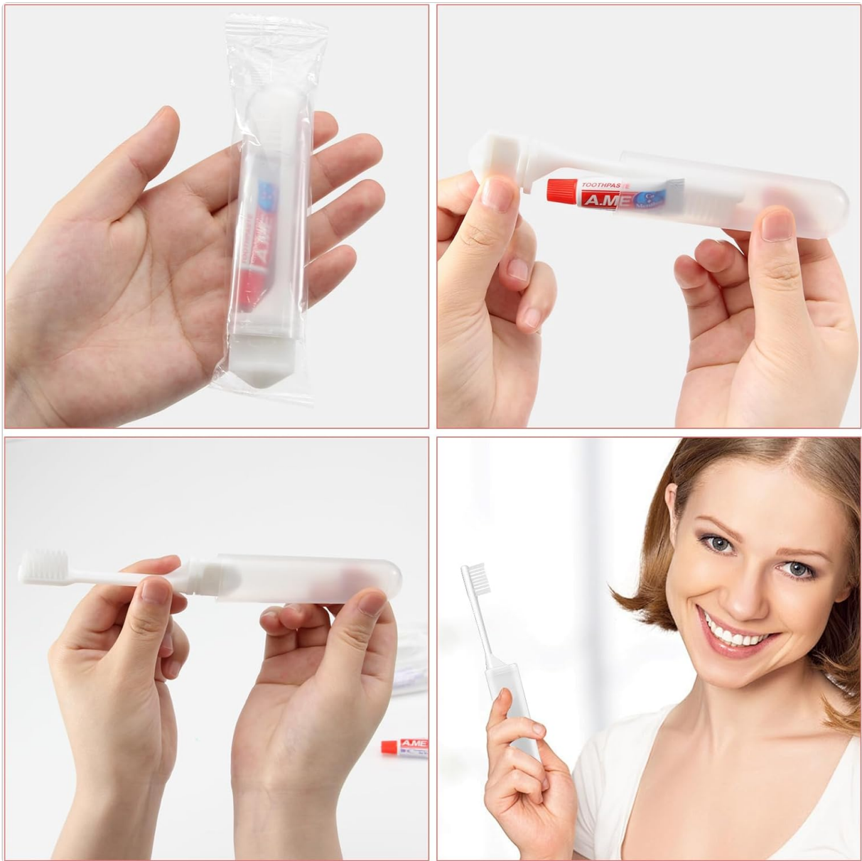
Figure 5: The toothbrush in its folded, compact form, demonstrating its travel-friendly size.

Your browser does not support the video tag.