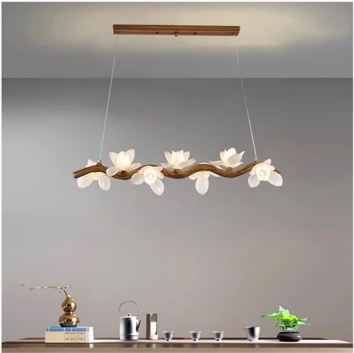
Image 1.1: The Nordic Chandelier D100cm Upper Flower installed above a dining table.