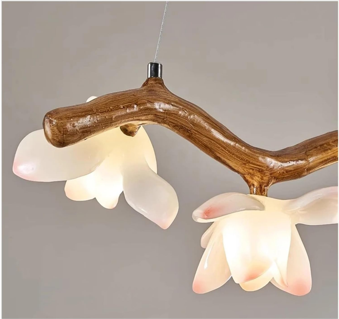
Image 4.2: Detail of a flower light and its connection to the main branch structure.