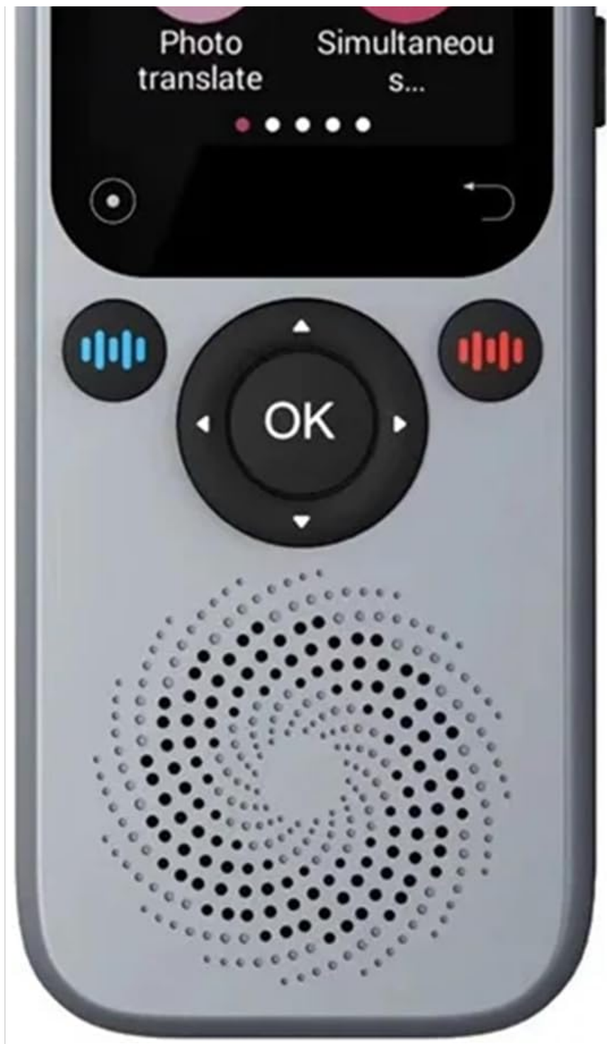
Image: Front view of the TWSYOXPR S20 AI Translator Device, showing its display screen and control buttons.