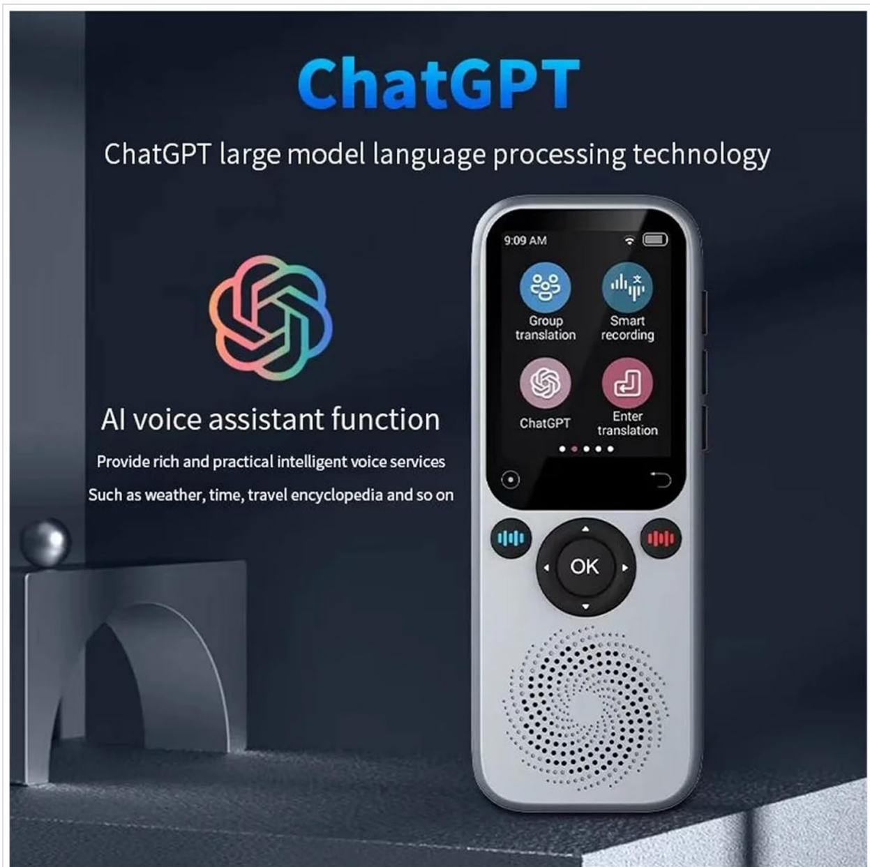
Image: The TWSYOXPR S20 AI Translator Device screen highlighting the ChatGPT and AI voice assistant functions, indicating its capability for intelligent language processing and practical voice services.