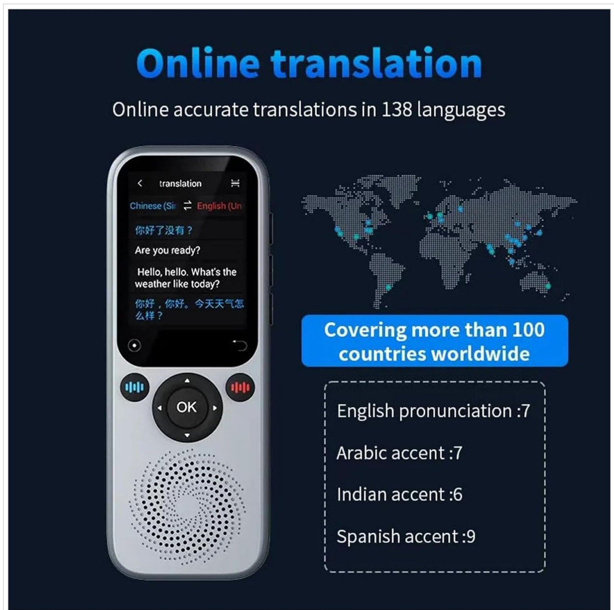
Image: The TWSYOXPR S20 AI Translator Device displaying its online translation interface, showing a conversation being translated between Chinese and English, with a world map indicating global coverage.