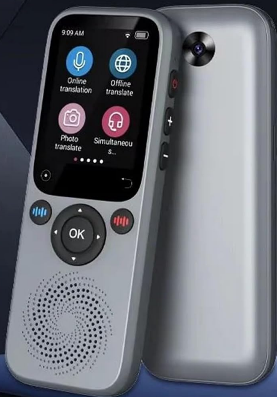
Image: The TWSYOXPR S20 AI Translator Device displayed alongside a list of its core features, including online translation, offline translation, group translation, intelligent recording, mobile translation, ChatGPT, and photo translation.