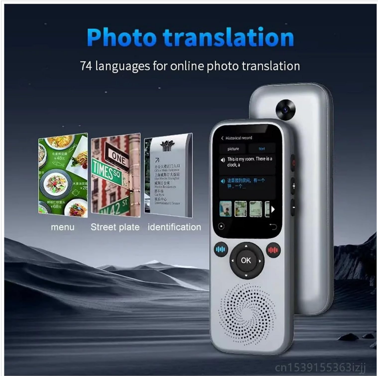
Image: The TWSYOXPR S20 AI Translator Device demonstrating its photo translation capability, showing examples of translating text from a menu, a street sign, and an identification document.