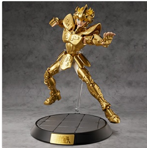
Image 4.1: The figure features 44 points of articulation for dynamic posing.

For a visual guide on assembly and features, please refer to the official product video below: