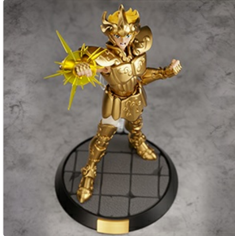
Image 5.2: Leo Aiolia showcasing the "Light Speed Fist" effect part.