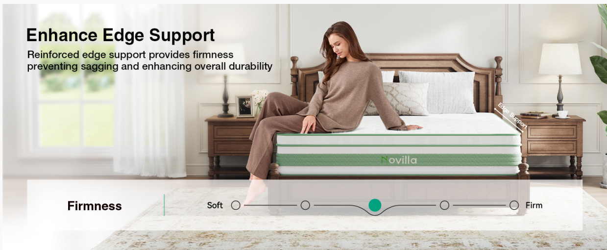
Image: A visual representation of the mattress's enhanced edge support, demonstrating its firmness and durability.

Reinforced edge support provides firmness preventing sagging and enhancing overall durability