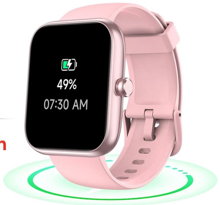
Image: Diagram illustrating the smartwatch dimensions, battery life (7 days), standby time (30 days), and charging time (2.5 hours for 300mAh battery).