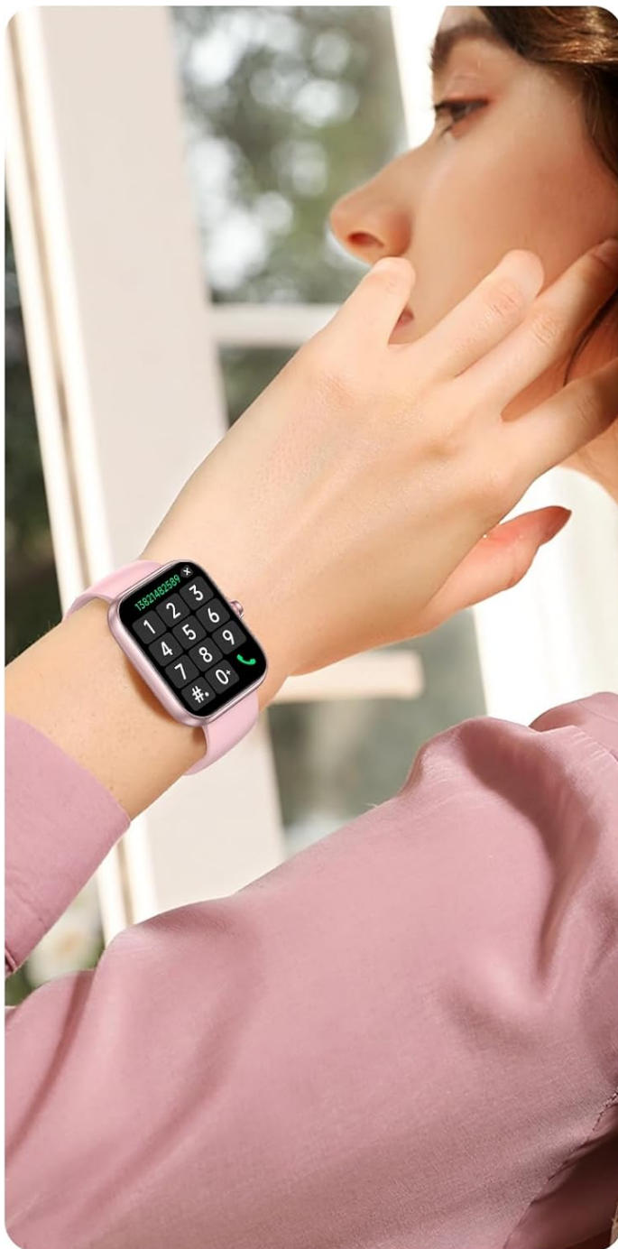
Image: The smartwatch displaying its capabilities for answering/making calls, syncing notifications from various apps, and interacting with Alexa.