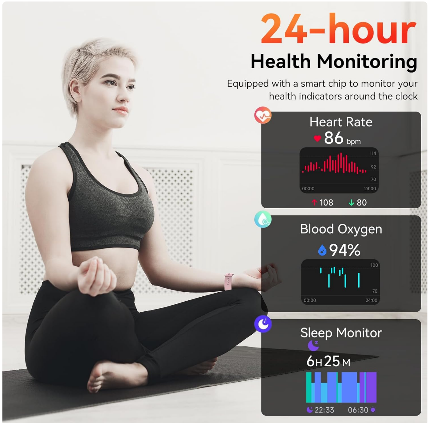
Image: A visual guide to the 24-hour health monitoring features, including heart rate, blood oxygen, and sleep tracking.