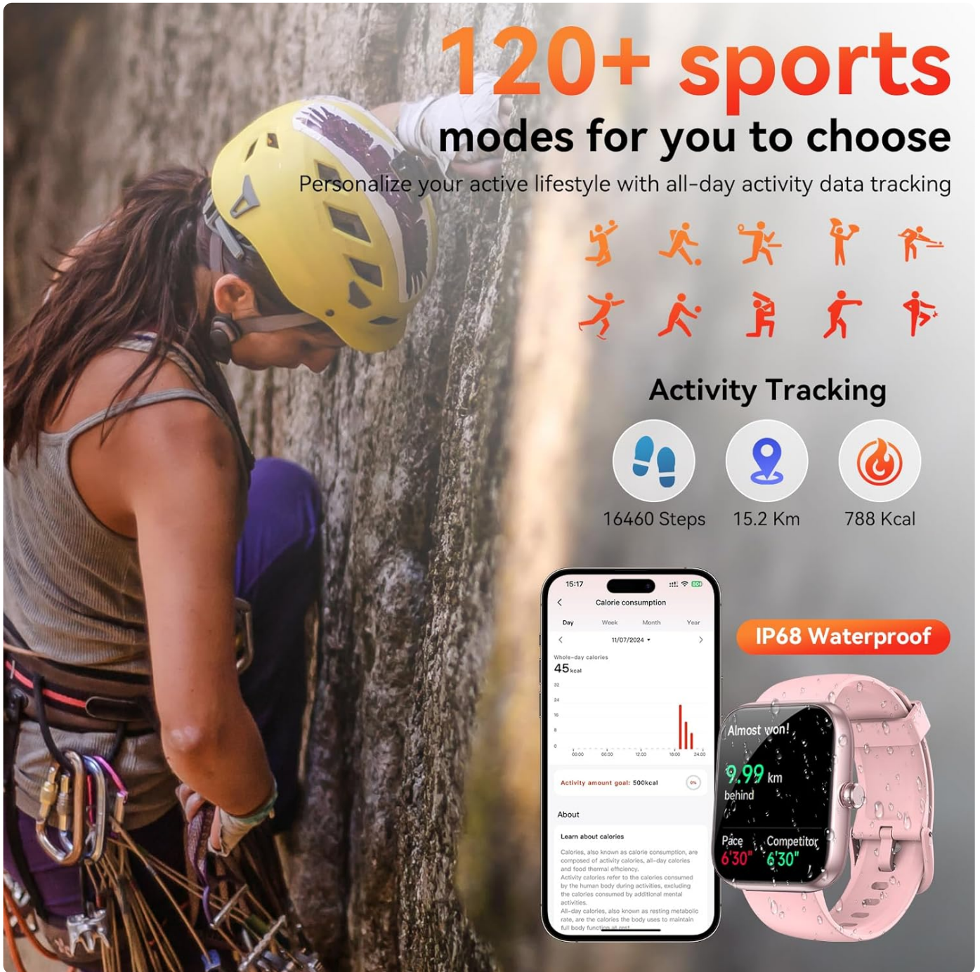
Image: An illustration of the smartwatch's 120+ sports modes and activity tracking capabilities, showing steps, distance, and calorie consumption.