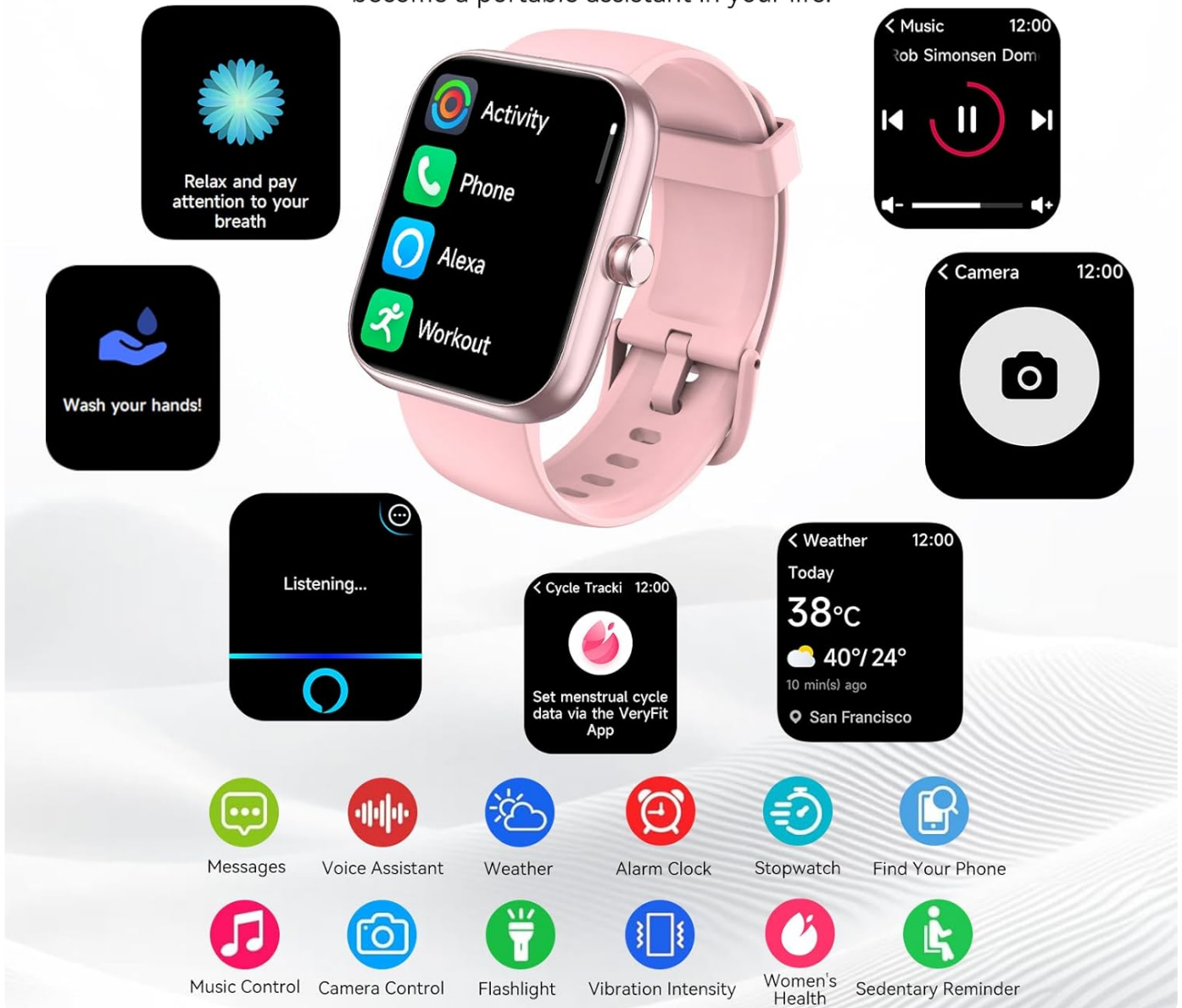
Image: A visual representation of the smartwatch's multifunctional capabilities, displaying icons for music, activity, phone, Alexa, workout, weather, and more.

Smart watches have a variety of practical functions and become a portable assistant in your life.