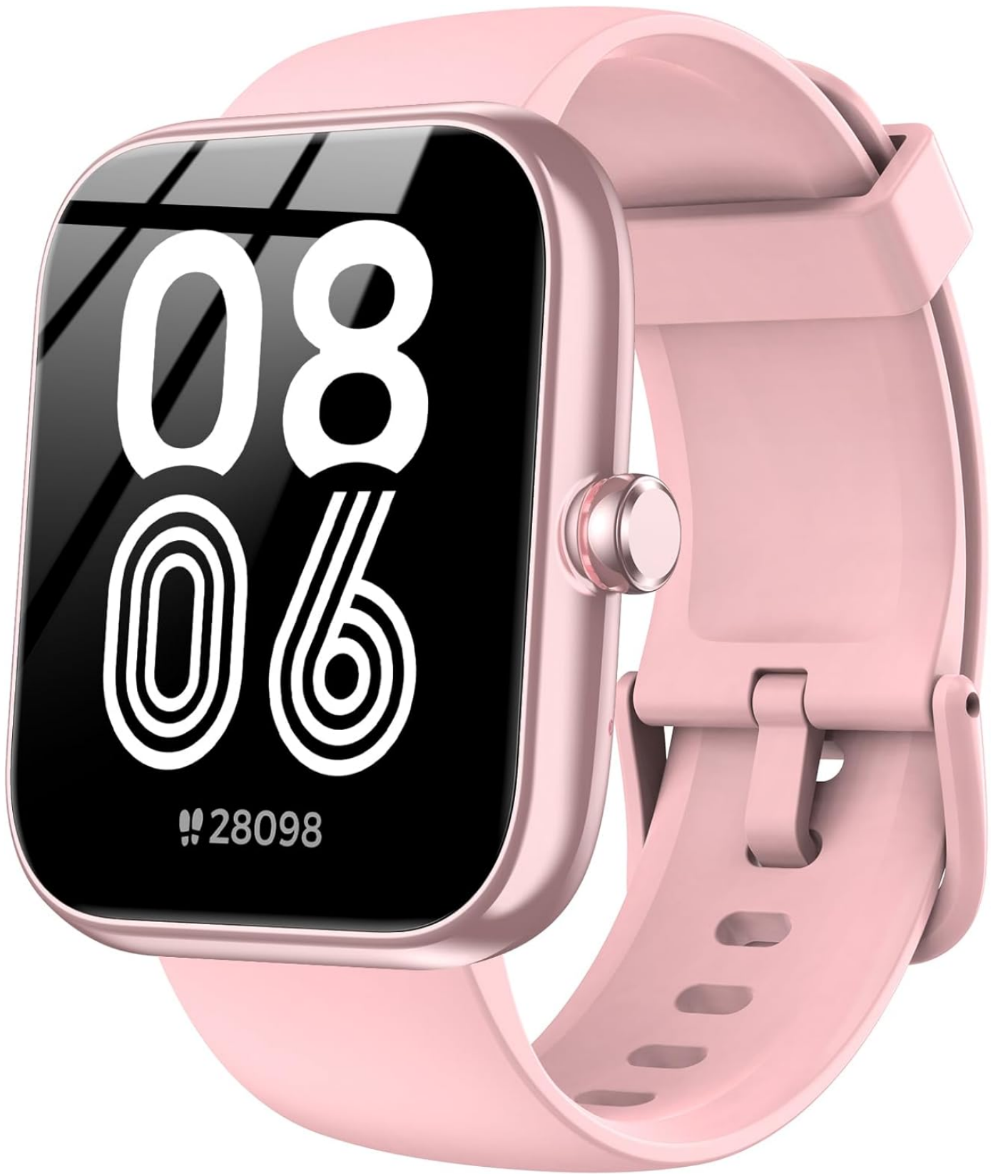
Image: The SENBONO Smart Watch, showcasing its sleek design and digital display.