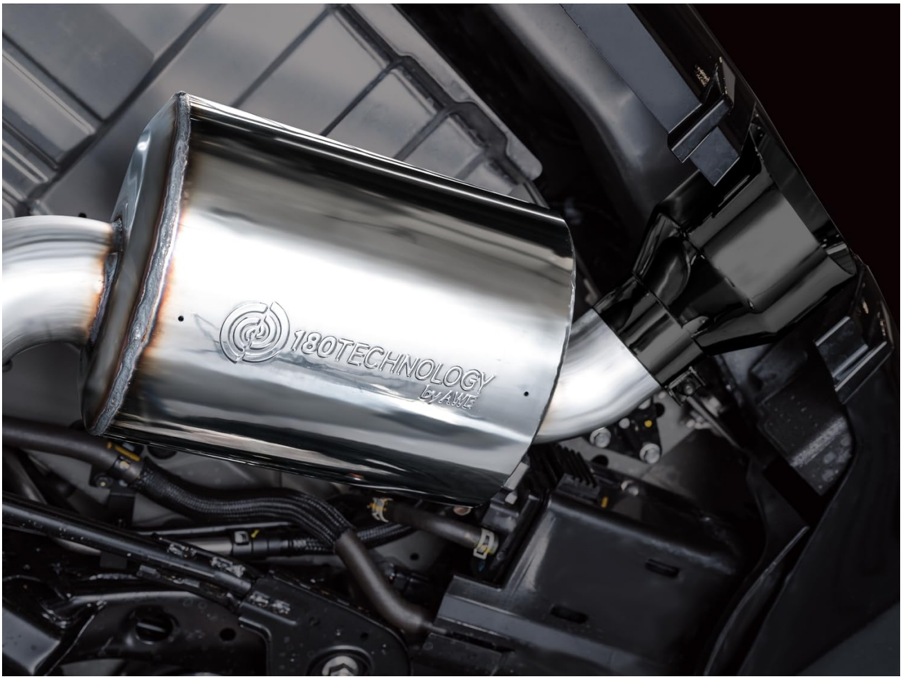
Figure 4: Detail of the AWE muffler, highlighting the "180 TECHNOLOGY" engraving, which signifies the integrated drone-canceling feature.