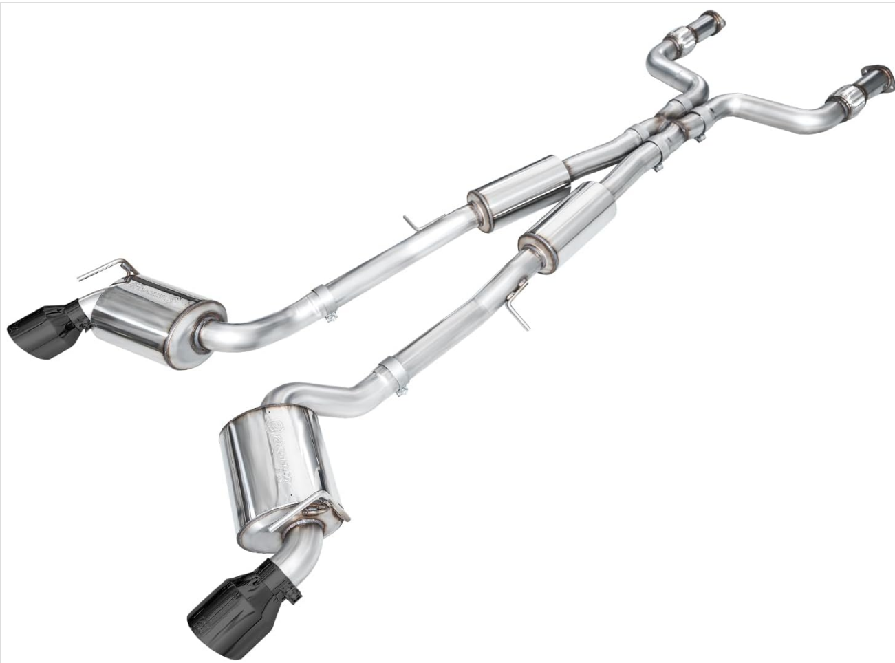
Figure 1: Overview of the AWE Touring Edition Catback Exhaust System, showcasing its dual pipe design, resonators, and diamond black tips.