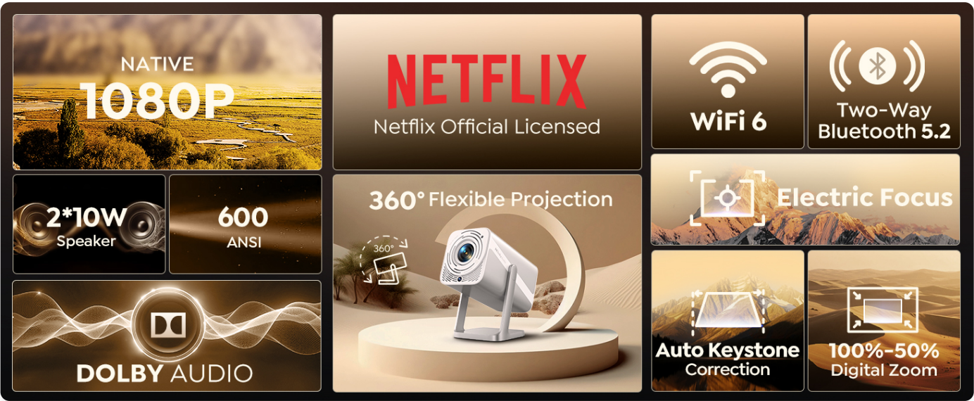
Image: The projector's interface displaying pre-installed streaming applications like Netflix, YouTube, and Prime Video, highlighting its official licensing.