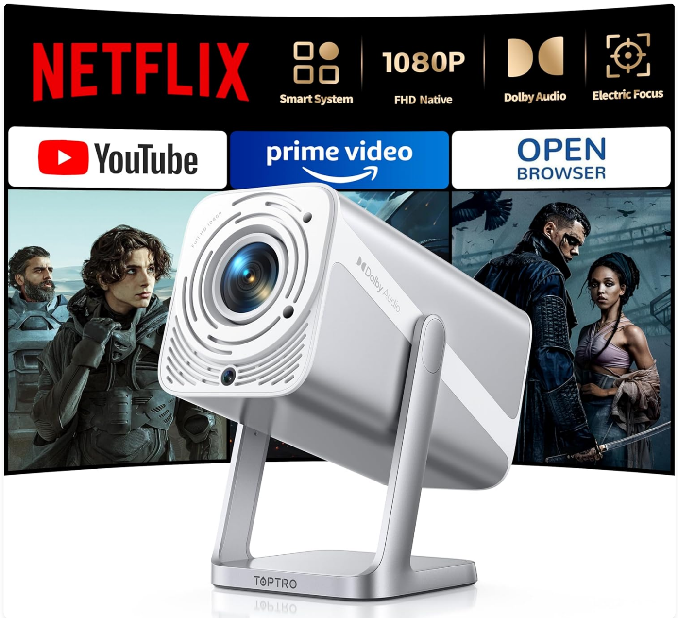
Image: The TOPTRO TP1 Smart Projector, a compact and portable device designed for versatile projection.