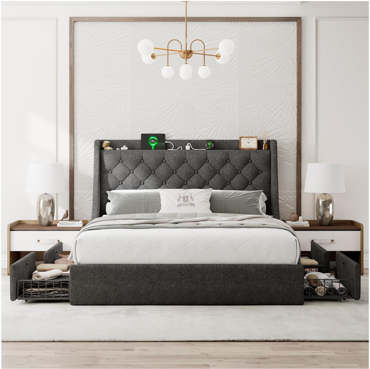
Front view of the bed frame with all four storage drawers pulled out, showcasing their capacity.