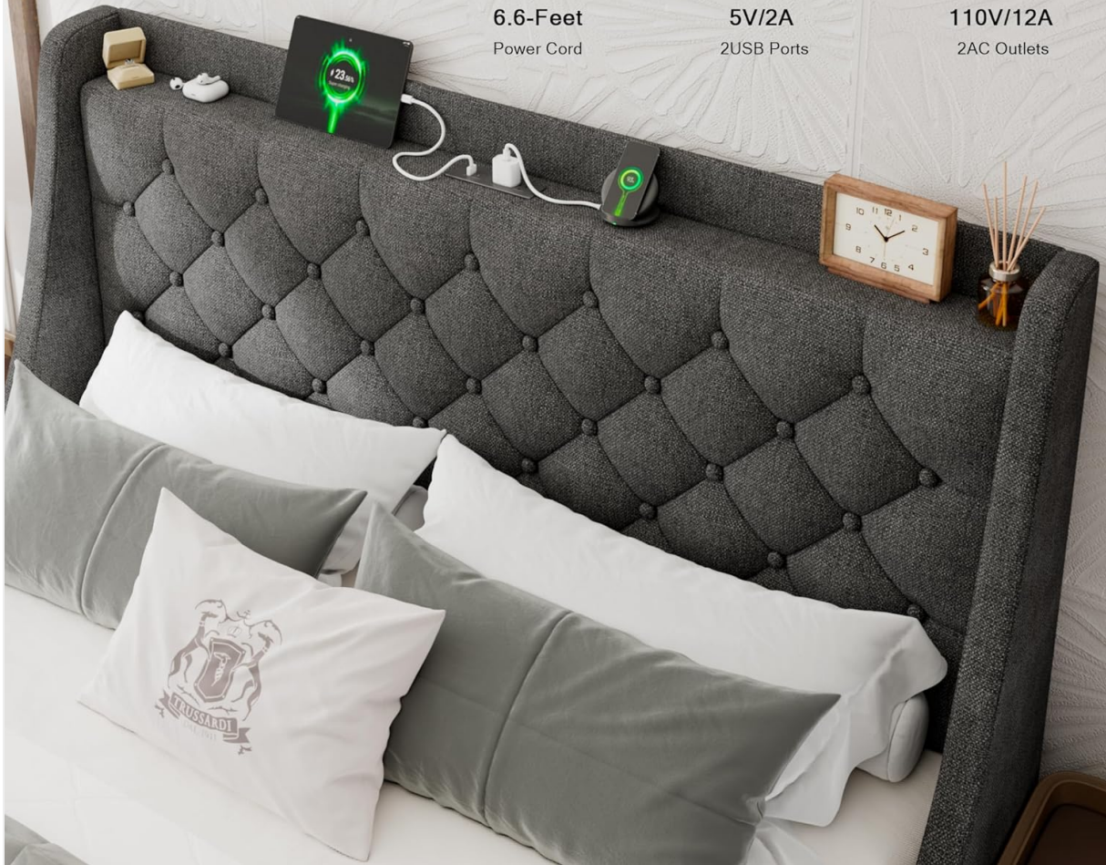
Close-up of the headboard's integrated charging station, showing a tablet and phone connected to USB ports and AC outlets.