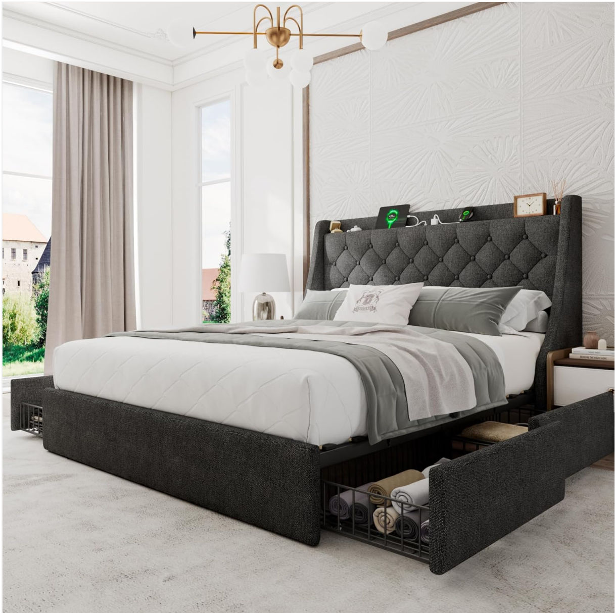
Einhorn Full Size Bed Frame with Storage Drawers and Charging Station.