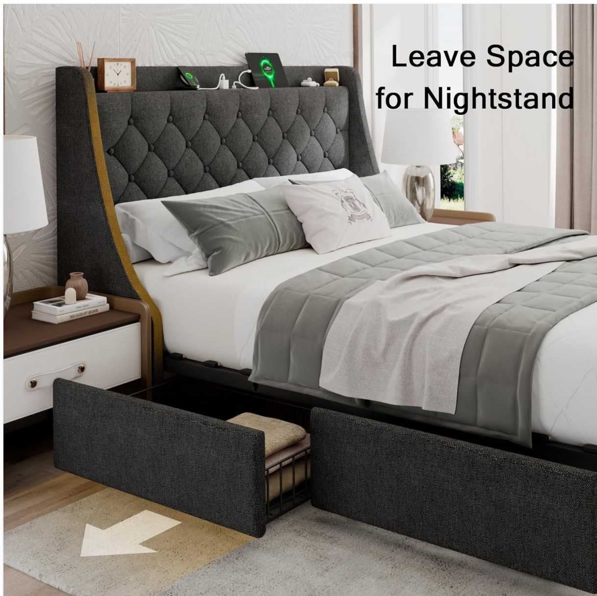
Image illustrating the design of the headboard that allows space for a nightstand next to the bed.