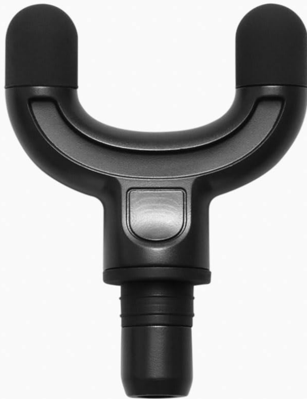
The U-shaped massage head, ideal for targeting muscles around the spine and neck.