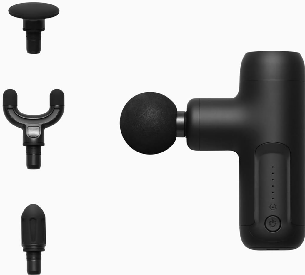
The Flowlife Flowgun Air massage gun shown with its four interchangeable massage heads.