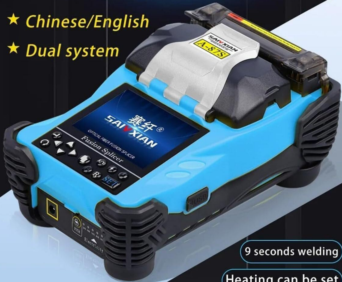
Figure 5.2: The clear 3.5-inch LCD display of the A-87S, showing real-time fiber alignment and splice quality, with content that can be flipped for dual-way operation.