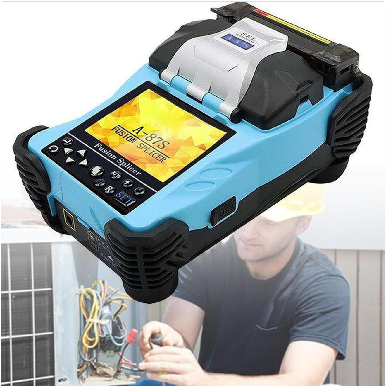
Figure 1.1: The A-87S Automatic Fiber Optic Fusion Splicer in an operational setting, demonstrating its compact design and user interface.