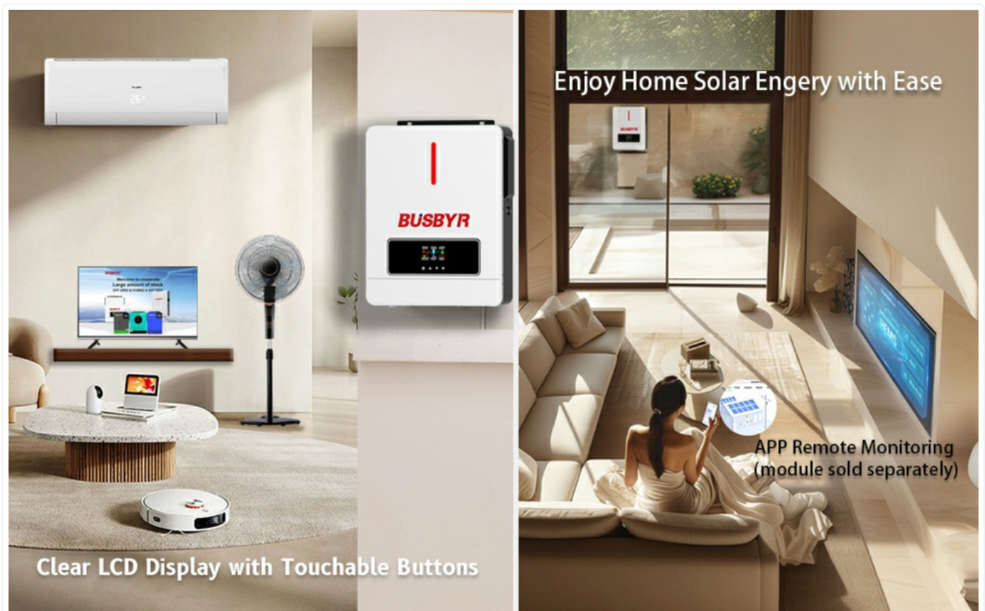
Figure 5.1: The inverter's LCD display and control buttons, providing a user-friendly interface for monitoring system status and configuring operational parameters. An example of remote monitoring via an app (module sold separately) is also shown.