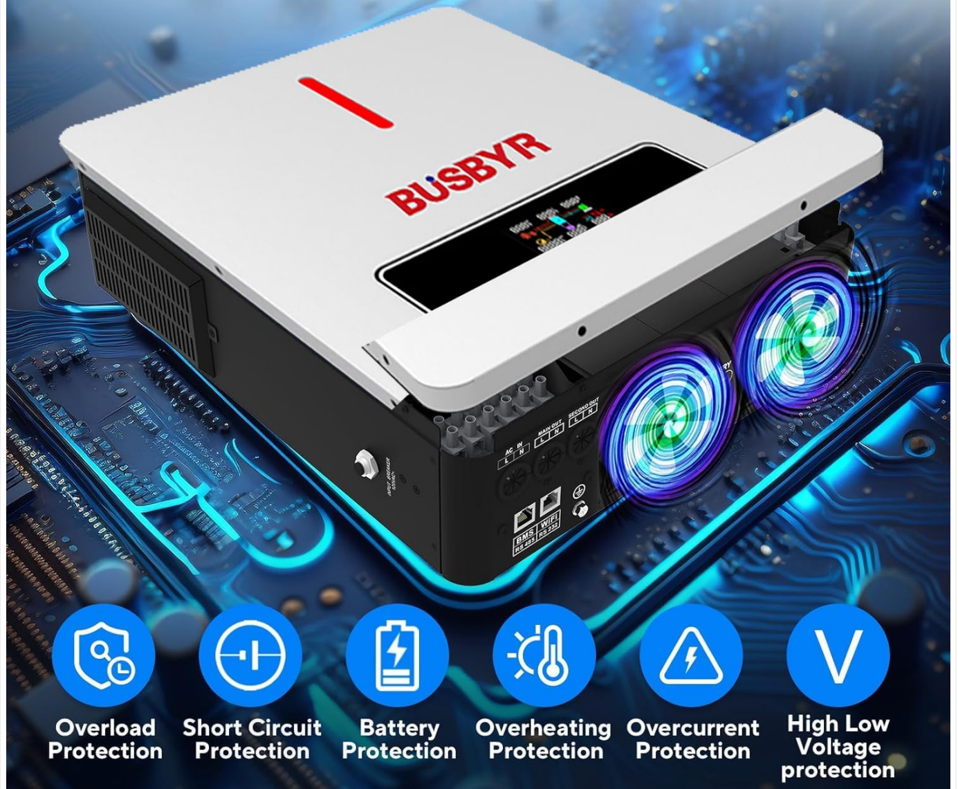
Figure 3.3: Overview of the multi-functional safety protections integrated into the inverter, including safeguards against overload, short circuit, battery issues, overheating, overcurrent, and voltage fluctuations.

Multi-functional safety protection - More Reliable & Stable