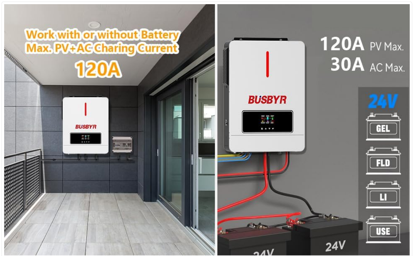
Figure 4.2: The inverter mounted on a wall, demonstrating its ability to work with or without a battery, and highlighting compatibility with GEL, FLD (Flooded), LI (Lithium-ion), and USE (User-defined) 24V battery types.