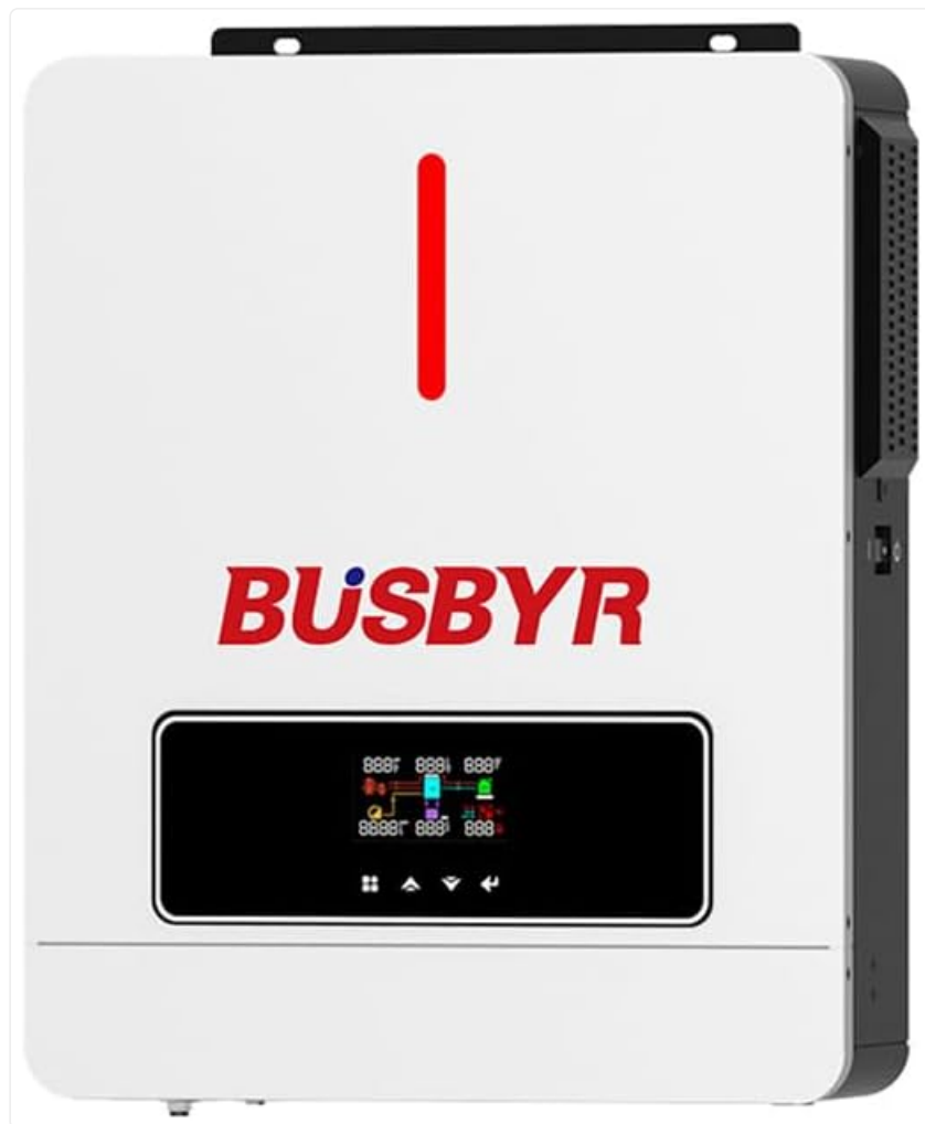
Figure 3.1: Front view of the 3600W Hybrid Solar Inverter, showing the main unit with the brand logo and the integrated LCD display panel.