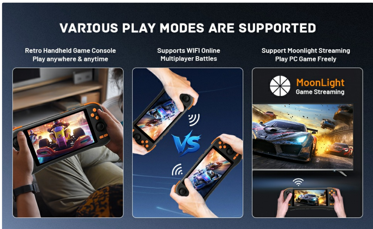
Image: Moonlight game streaming from PC to the Kinhank K56 console.