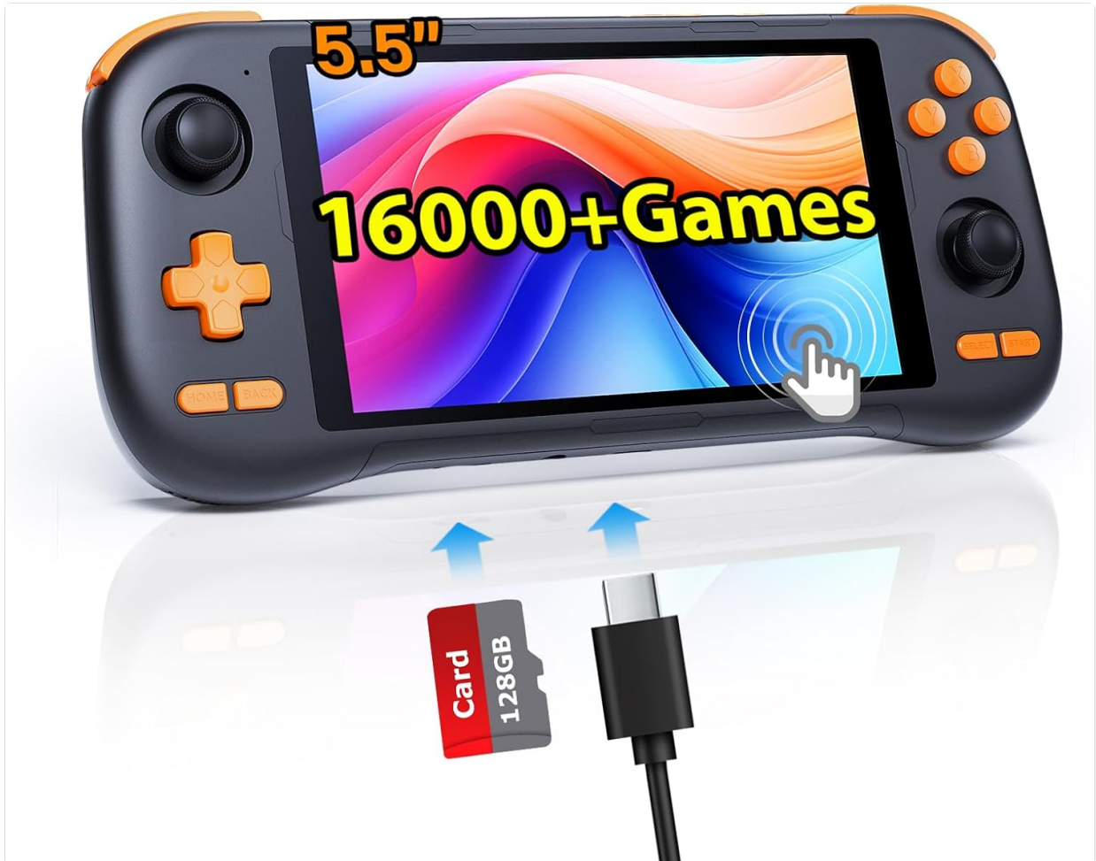
Image: Front view of the Kinhank K56 console.

Familiarize yourself with the layout of your Kinhank K56 console: