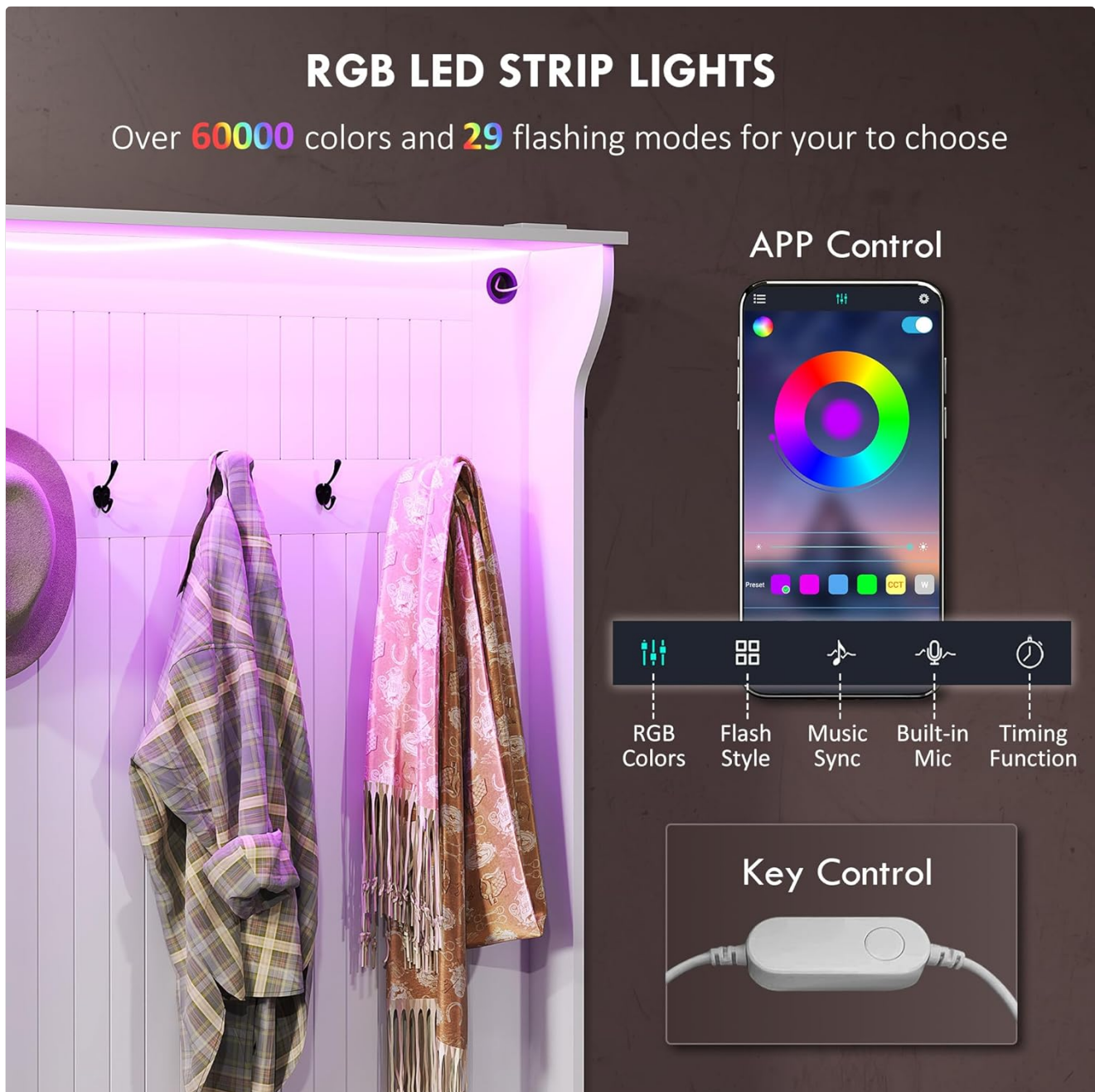
Figure 4: Overview of the RGB LED strip lights, highlighting app control features for color, flash style, music sync, built-in mic, and timing functions.