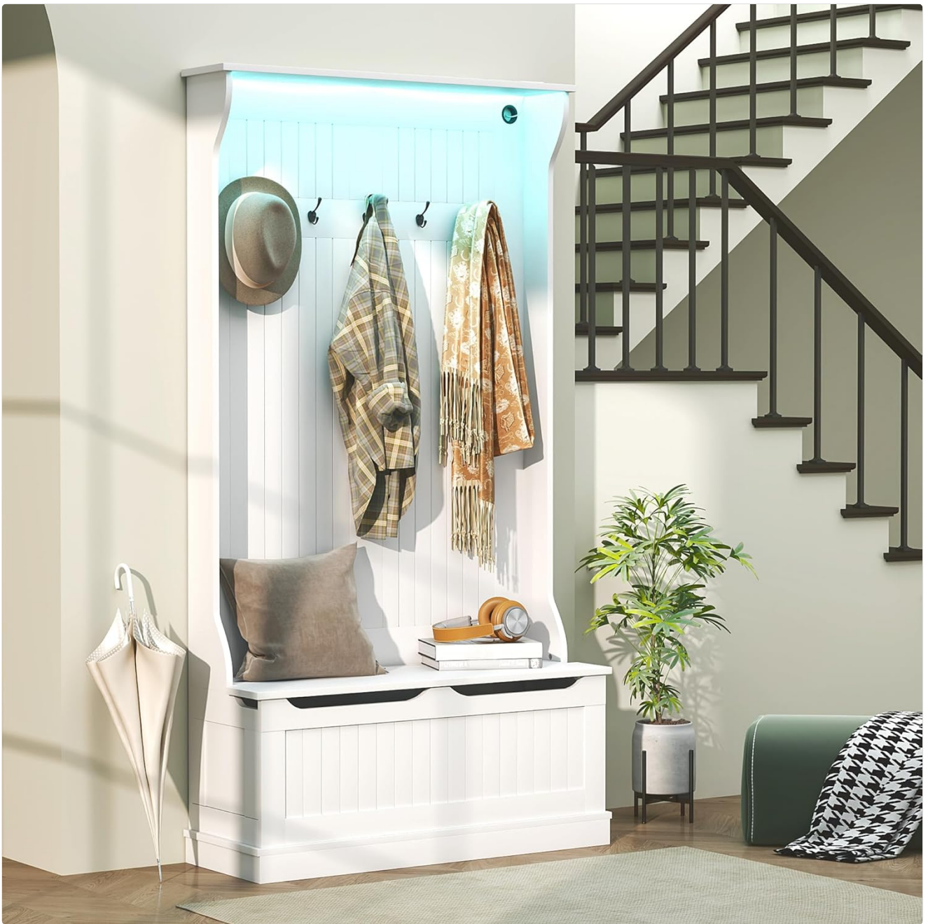
Figure 1: The HOMCOM 3-in-1 Hall Tree in an entryway setting, showcasing its coat rack, bench, and LED lighting.