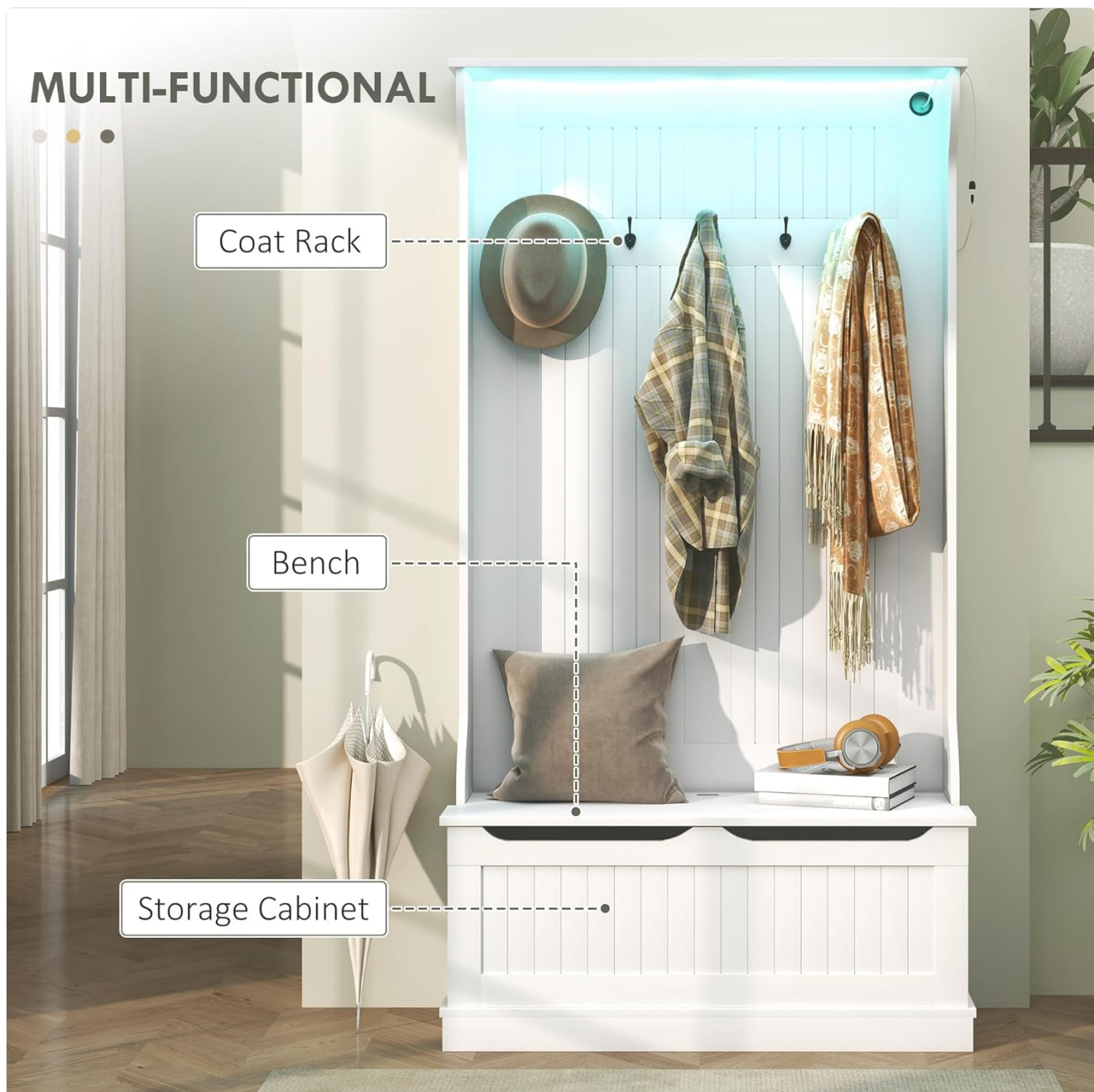
Figure 2: Diagram highlighting the multi-functional aspects: Coat Rack, Bench, and Storage Cabinet.