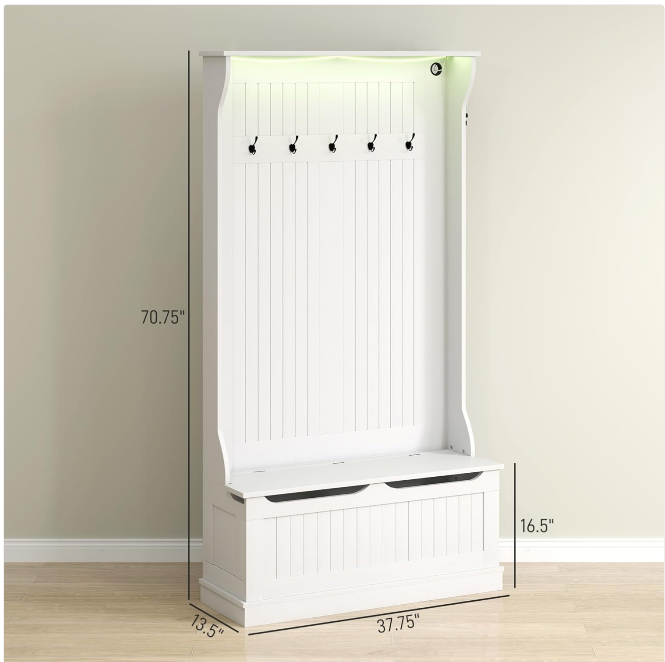
Figure 6: View of the hidden storage space beneath the bench, showing the lift-up seat panel with a support rod and U-shaped handles for easy access.