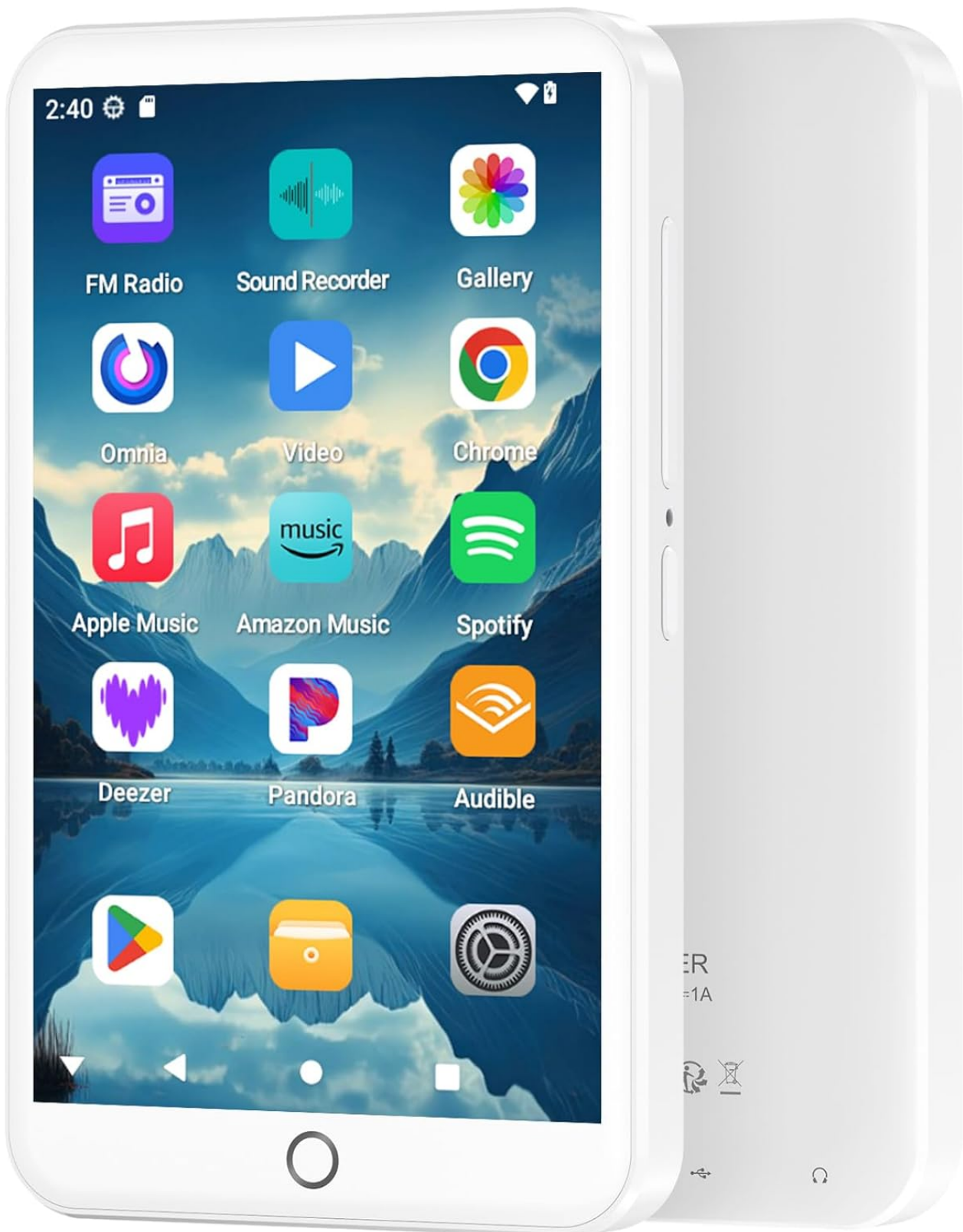
The Fanvace K11 MP3 Player, showcasing its intuitive Android 13 interface with pre-installed applications.