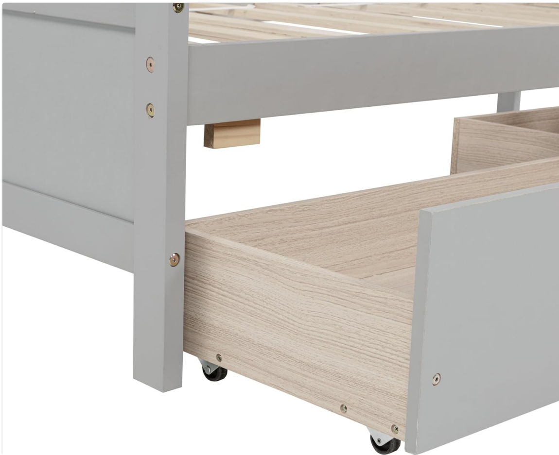
Image: Close-up view of the bottom corner of a storage drawer, showing the smooth-rolling caster wheel for easy movement.