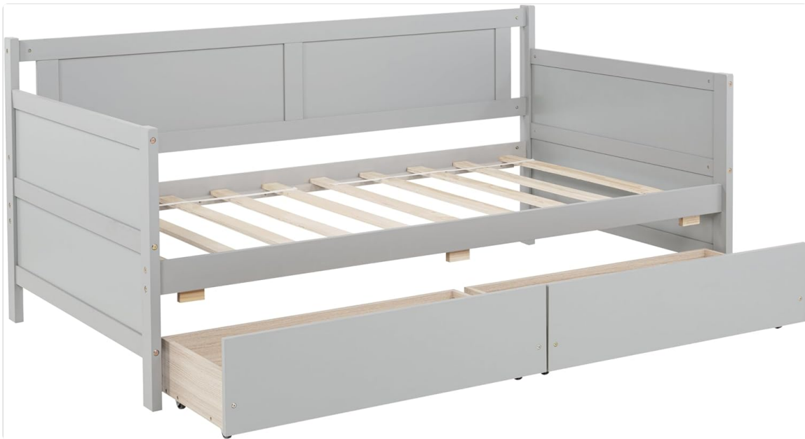
Image: Overview of the daybed frame components, including side rails and headboard/footboard sections, ready for assembly.