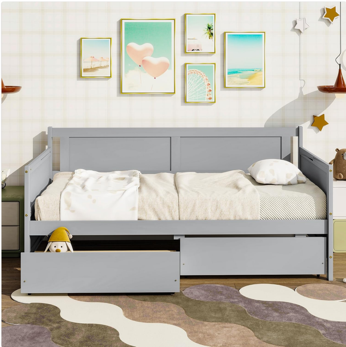
Image: The grey twin daybed with one of its two under-bed storage drawers partially open, revealing ample space for items.