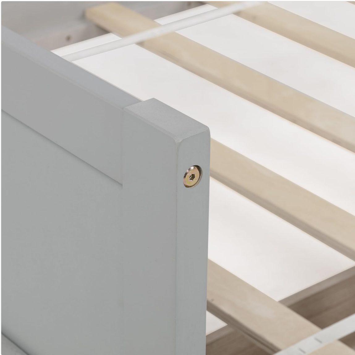
Image: Close-up view of a secure connection point on the daybed frame, illustrating how components fit together.