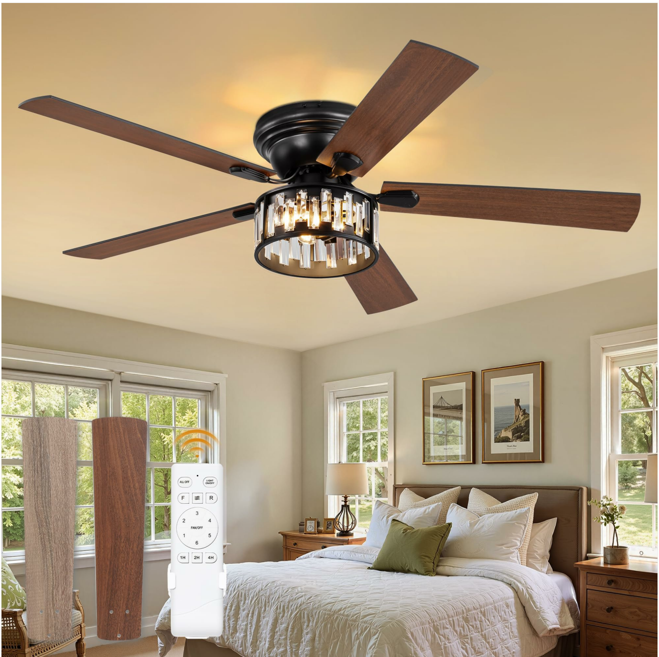
Image: The Fanbulous 56-inch Crystal Chandelier Ceiling Fan, showcasing its elegant design and crystal light fixture, installed in a modern living room setting.