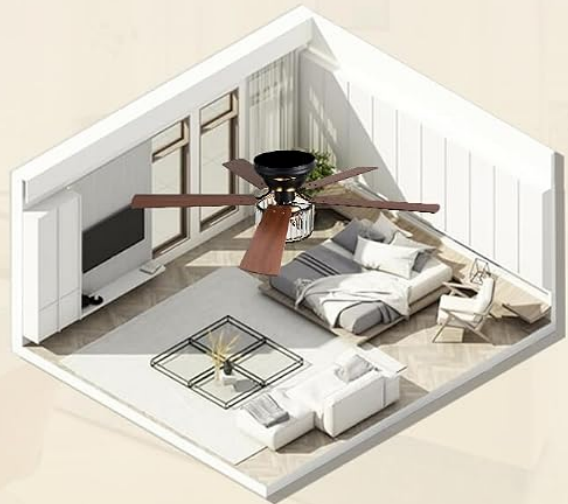
Image: Detailed dimensions of the 56-inch Fanbulous Crystal Chandelier Ceiling Fan, including blade length, fixture width, and overall height.