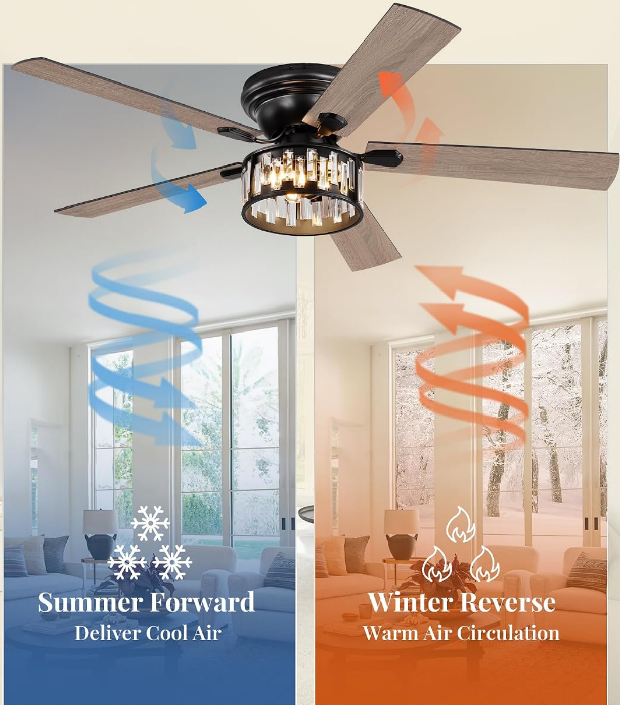
Image: A visual representation of the fan's reversible function, showing cool air delivery in summer (forward rotation) and warm air circulation in winter (reverse rotation).