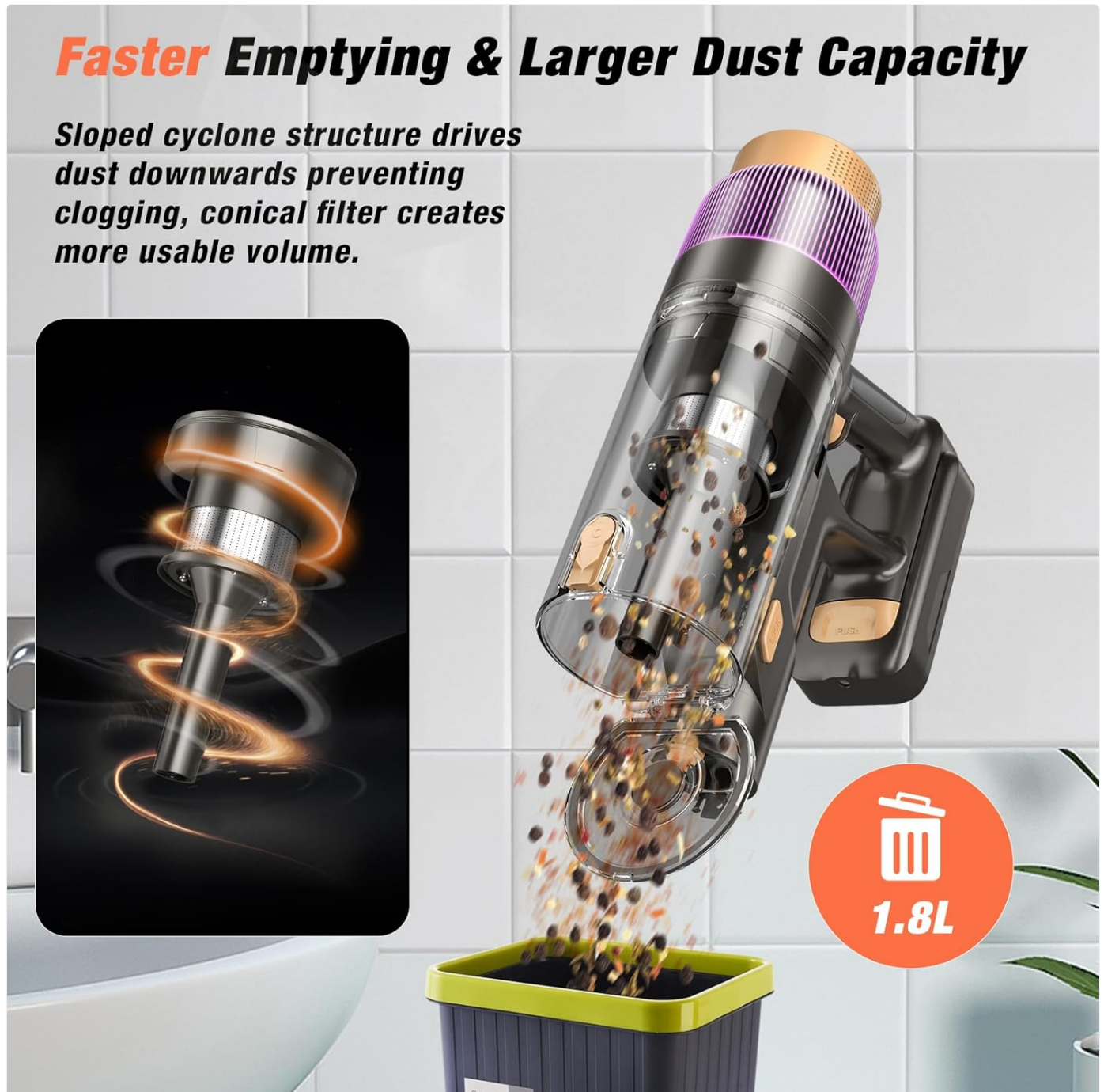
Image: Diagram illustrating the process of emptying the 1.8L dust cup and a warning about not overfilling.