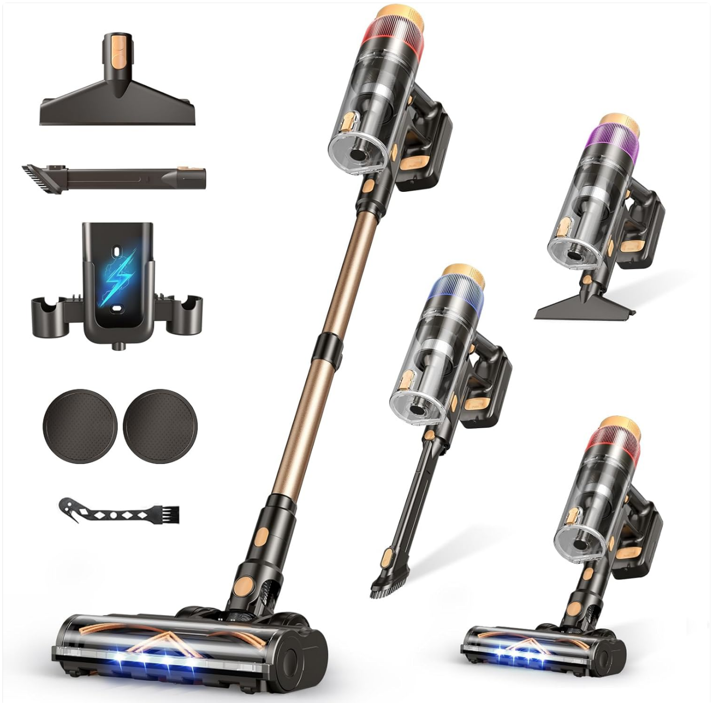
Image: All components included with the VBUOO Cordless Vacuum Cleaner, including the main unit, various brushes, and charging accessories.