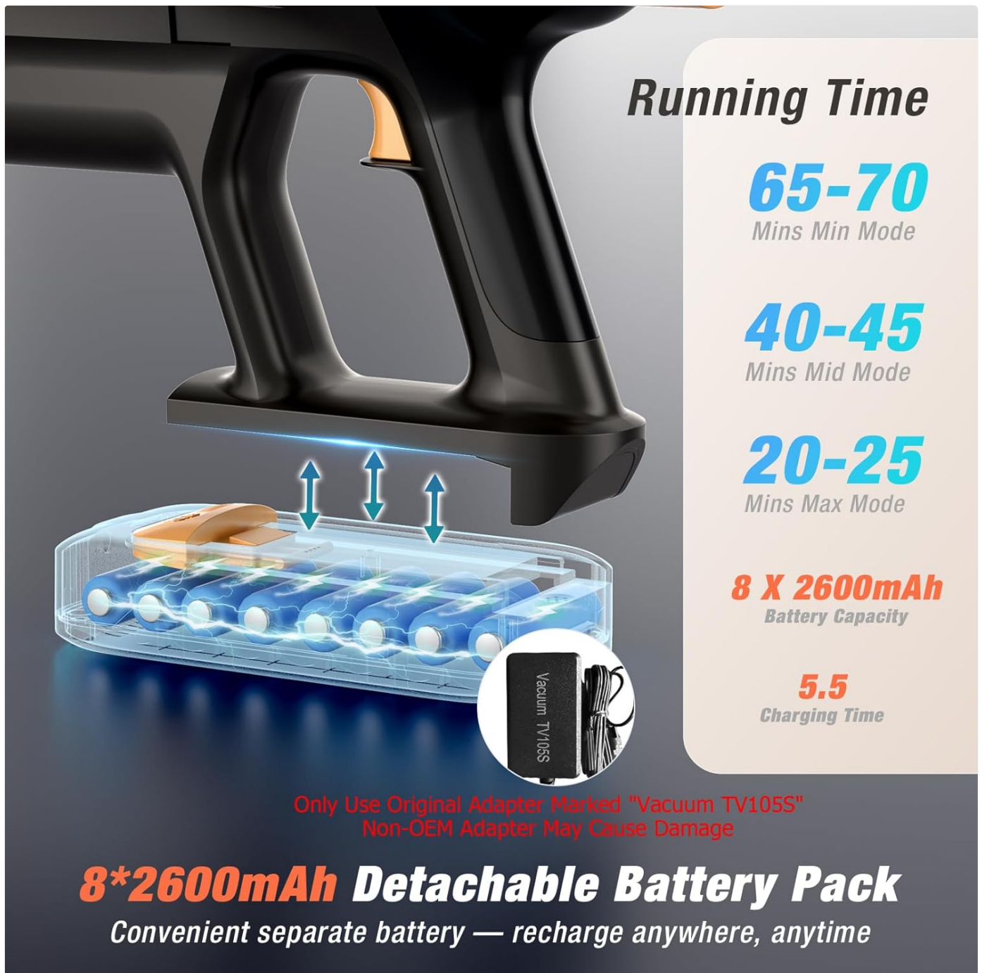
Image: Illustration of the detachable battery pack and various charging options, including direct charging and charging via the wall mount.