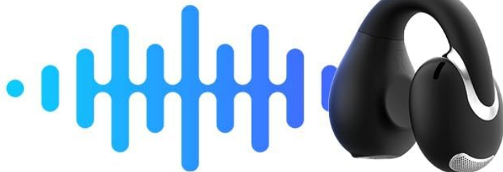
Image: A detailed diagram highlighting the 14.2mm speaker within the Jzones earbud, emphasizing its role in sound transmission enhancement technology.

sound transmission enhancement technology