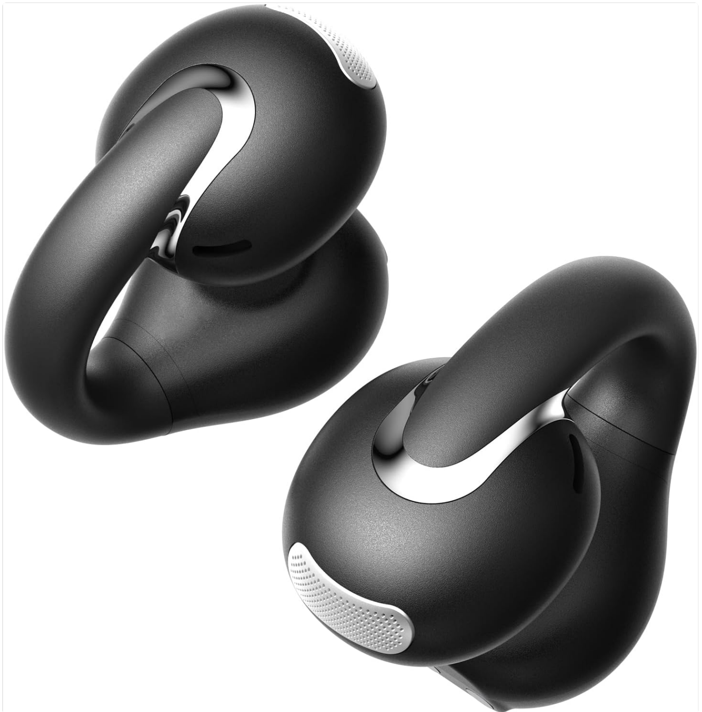
Image: The Jzones Open Ear Earbuds, showing both earbuds and their compact charging case.