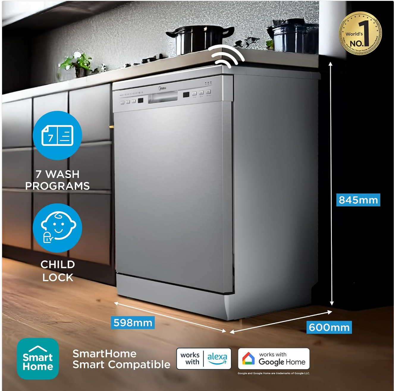
Image: Side view of the Midea MDWPF1301F dishwasher, illustrating its dimensions (845mm height, 598mm depth, 600mm width).

The dishwasher should be placed on a level surface near a water supply, drain, and electrical outlet. Ensure adequate space for opening the door and loading dishes. The product dimensions are 59.8D x 60W x 84.5H Centimeters.