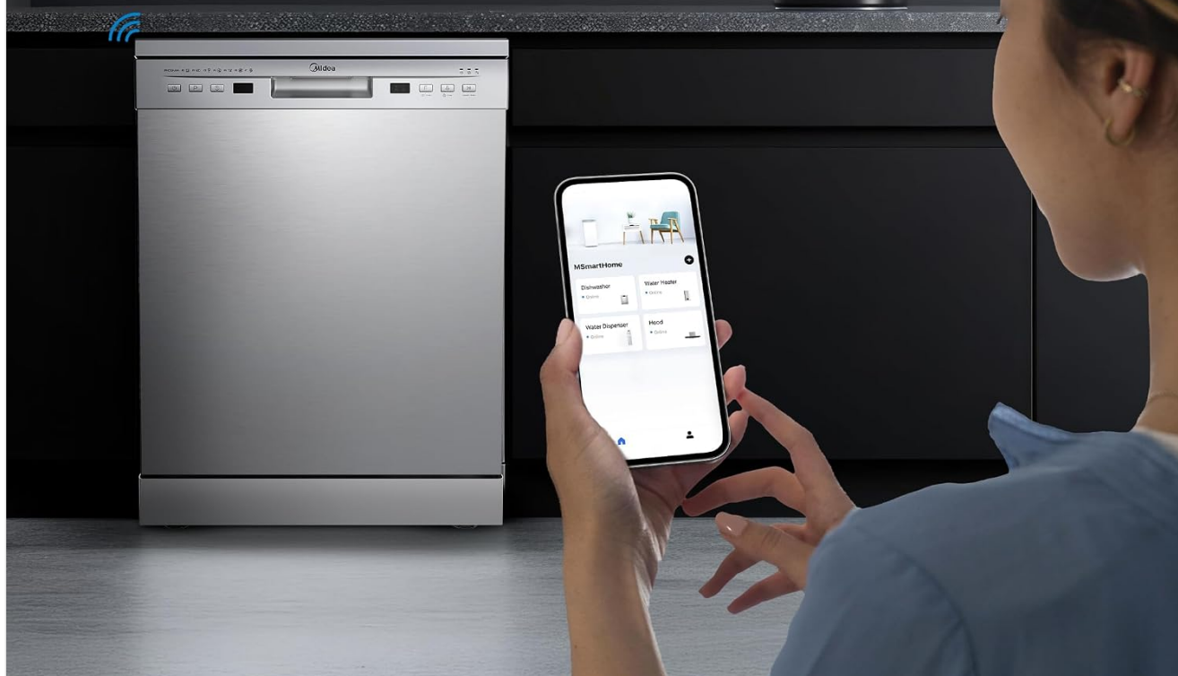
Image: Front view of the Midea MDWPF1301F freestanding dishwasher in silver finish, showing the control panel and door.