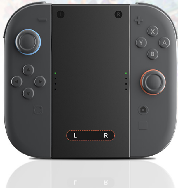
Image: Explanation of the LED indicator lights for charging status (Red: Charging, Green: Fully Charged, No Light: Not Working).