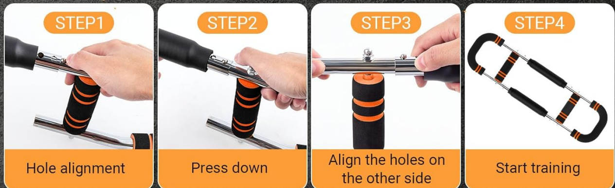
Image: A four-step visual guide demonstrating the assembly process of the Twister Arm Trainer. It shows aligning holes, pressing down the spring bar, aligning the other side, and the final assembled product.

Please select 2 resistance bars with the same resistance for installation.