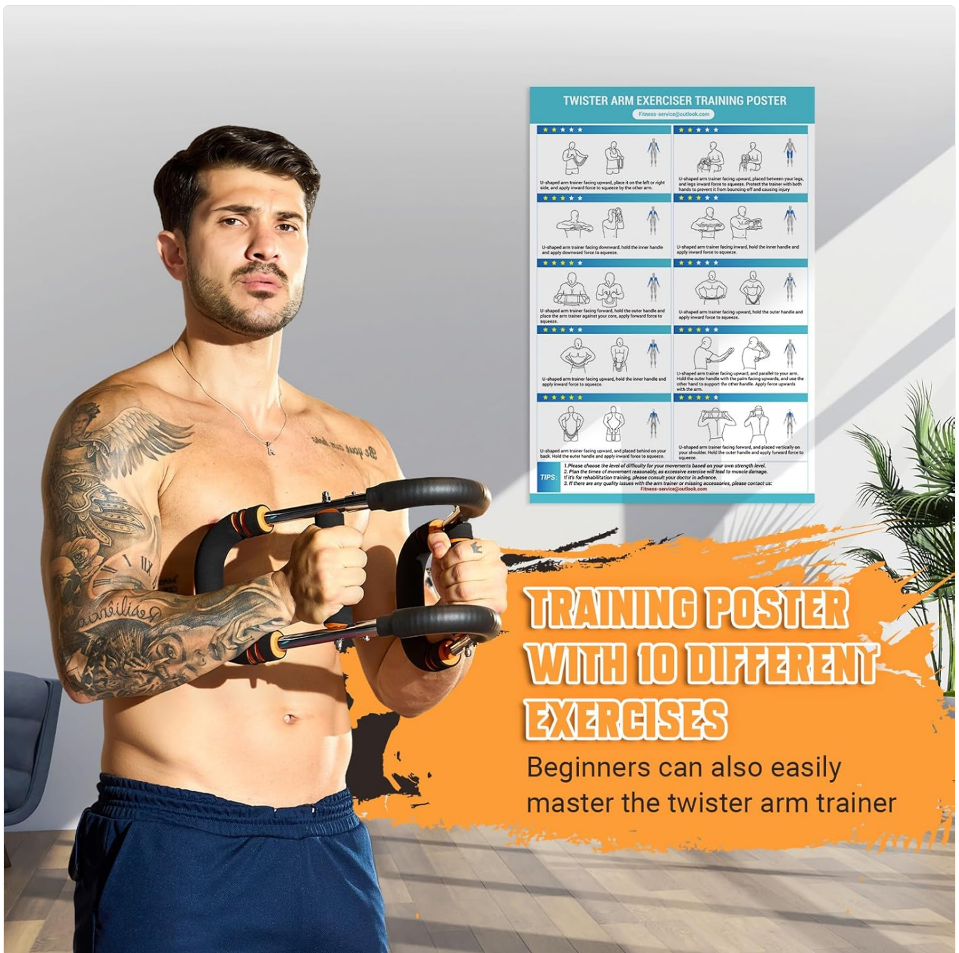
Image: A man using the Twister Arm Trainer, with the included training poster visible in the background, illustrating various exercises for different muscle groups.