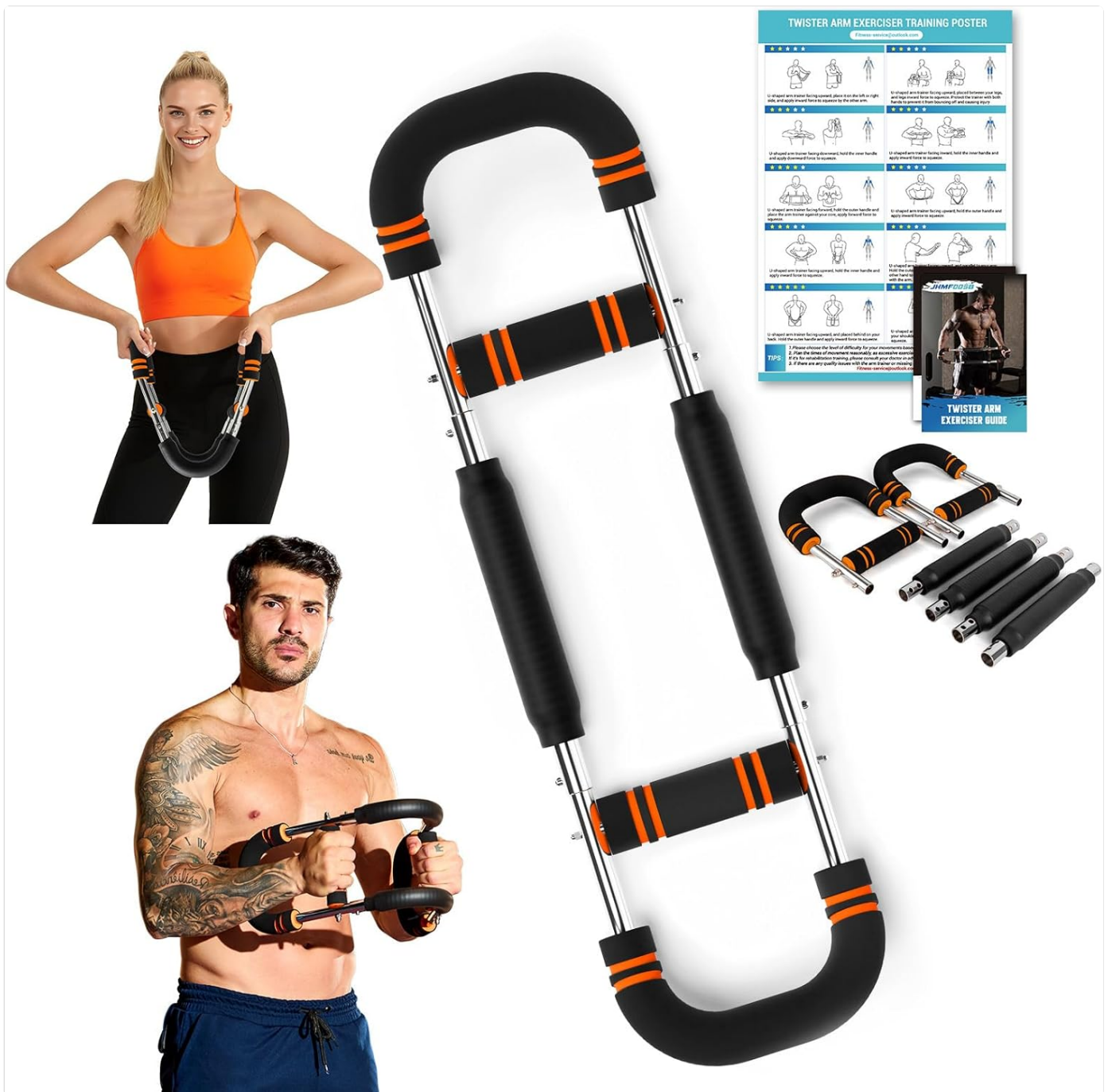
Image: Overview of the JHMFDDSB Twister Arm Trainer, showing the main unit, detachable springs, and the included training poster. A man and woman are depicted using the device.