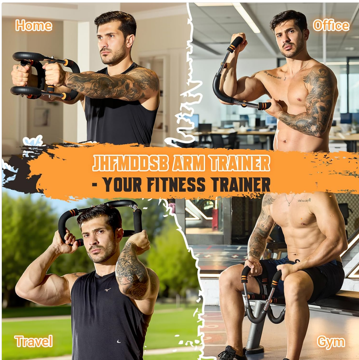
Image: A man demonstrating the versatility of the JHMDDSB Arm Trainer, using it in various settings such as home, office, gym, and during travel.